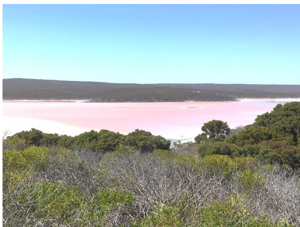
Above left – Hammersley inlet Dec 2020