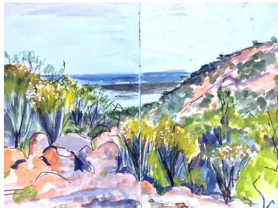
Above clockwise: granite Peak from below/ patch of bush / cold view from a granite peak/ Me at a viewpoint