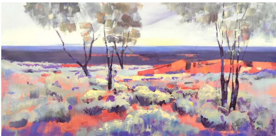
Left - Winter Flowers on the Bluff (Acrylic on canvas)

In July I visited & climbed a bluff in the Murchison district, and this gave me plenty of ideas. First I painted on location, then at home I worked from my sketchbook, memories and photos to paint 'Winter Flowers on the Bluff' – depicting the plateau with its masses of flowering bushes. After that I took a different approach and made some more abstract pieces that drew on my memory of climbing and exploring the bluff. See " This Way Up Amongst The Flowers ". This painting aims to contain numerous memories of place rather than one view, I have tried not to worry about things making sense and have played around with heightened colour and shifting views. Its amazing how one walk can fuel lots of ideas.