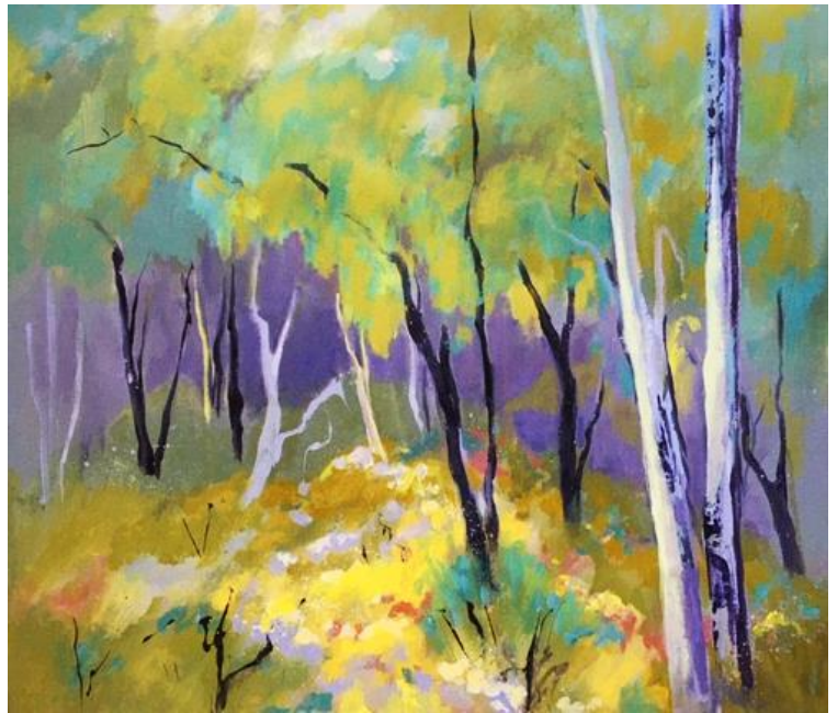
Untitled for now (Acrylic on canvas)