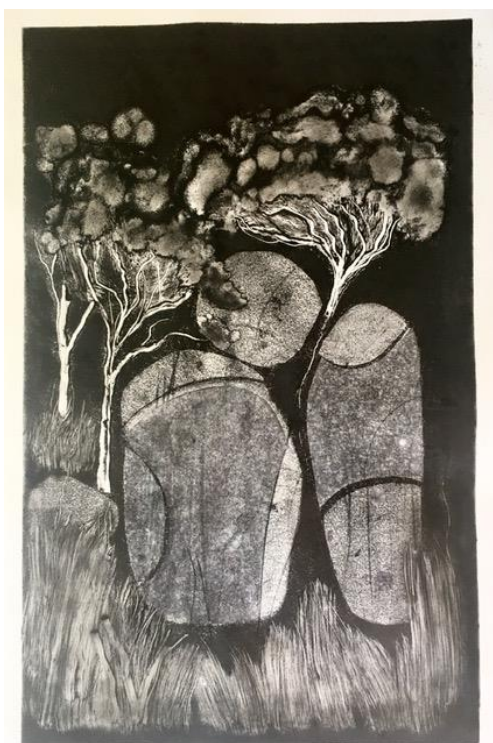
'Melaleuca and Boulders'

I have recently bought a new toy – a portable good quality Italian made printing press! The aim is to use it so that I can finally print with a press at home and to use it as a teaching tool in my classes later this year. Although I do quite a bit of printmaking, I mainly print without a press and have adapted my methods and techniques to hand printing. I work often in the painterly process of monotype printmaking which doesn't require a press. (you can see an example of this below). I am looking forward to broadening my printmaking skills and discovering numerous ways of using my press.