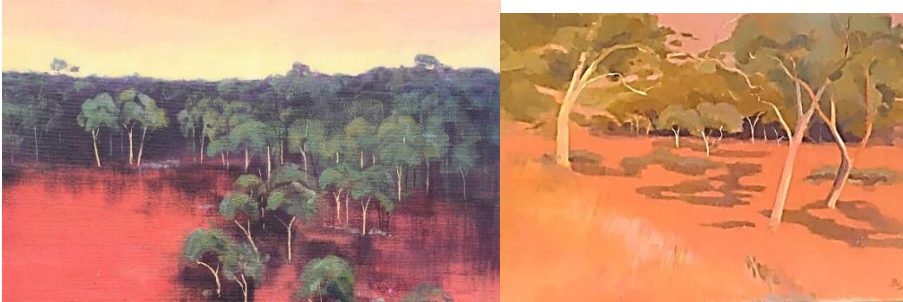
some of my paintings for sale at a discount

In terms of exhibitions, it's going to be a quiet run up to Christmas. However, I do have quite a lot of work from the last 2 years that is sitting idly in my studio. I have an idea forming to either have an open studio sale at my home or a pop up weekend exhibition as some point towards the end of the year (or early 2023). I will keep you posted if this happens. If you are interested in purchasing any of my artwork, then my studio door is always open for a visit and as I need to clear out the old to make space for the new, I will be offering discounts