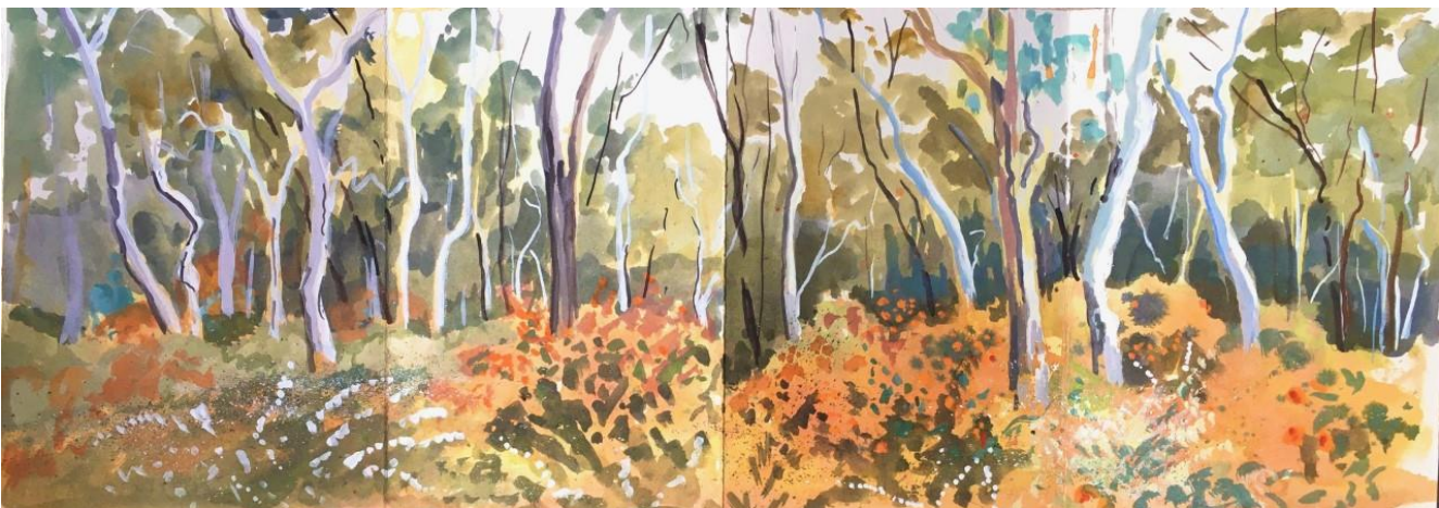
accordion sketchbook painting done on location in the Wandoo woodlands. 7.30 am, pea flowers in the sunshine.