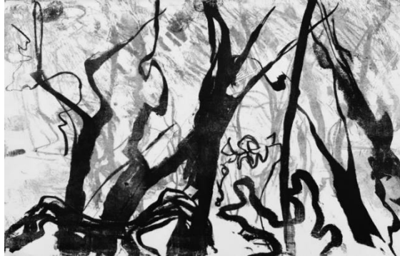
Some experiments with kitchen lithography