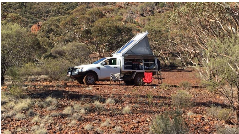
Left - our compact home away from home

I mentioned in my last newsletter that we were awaiting the conversion of our 4 wheel drive into a camper. The vehicle is now converted and means that we can be fully self-sufficient and prepared for travel into some more remote areas. It is the remote and deeply quiet areas that inspire me the most to paint and create.