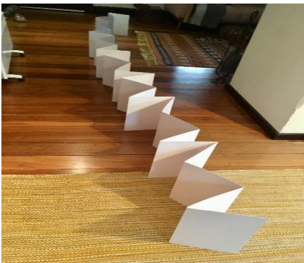
left – making the book