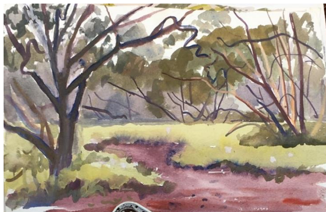
Gouache painting done at camp on a very cold morning.