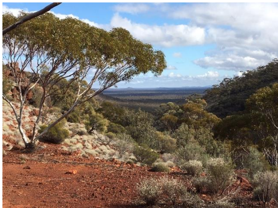
Helena and Aurora Ranges

As WA opened its regional borders again my recent camping trip was much anticipated and appreciated. I spent a week in the remote Helena and Aurora ranges which is a stunning ironstone banded range surrounded by the wilderness of the Great Western Woodlands which is the largest intact woodlands on earth. The area is about 100km north of Southern cross and is of exceptional beauty. Unfortunately, mining companies have an eye on this area so the more people who know about this area the better. I spent a happy week here exploring the area and managed to do some plein air painting every day. I also discovered the fun of drawing trees by torchlight – shine a light on a tree in the darkness and the form is rendered simple and clear.