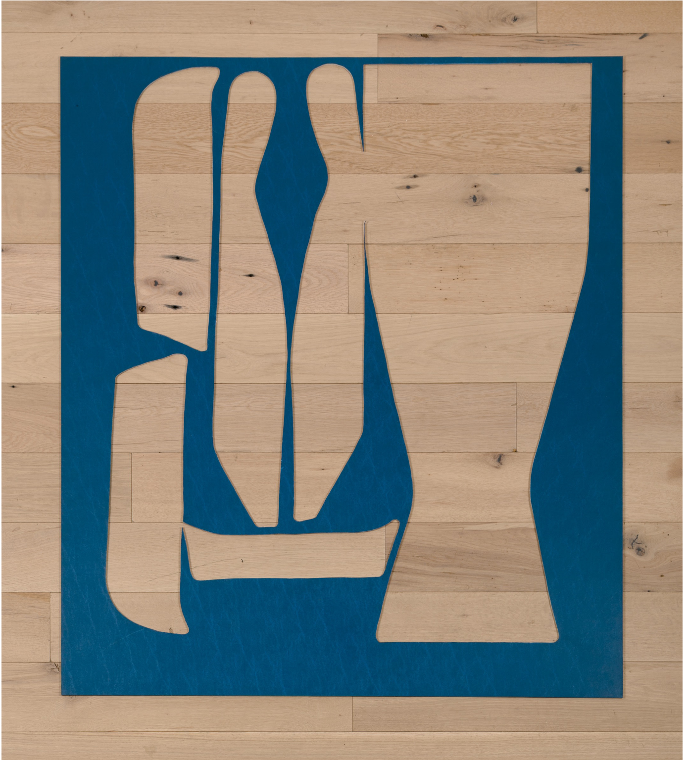
D-90 Blue No.116, 2016 fabric scraps procured from manufacturer (09/2015-11/2016) on plexi 55 × 48 × 1/4 inches