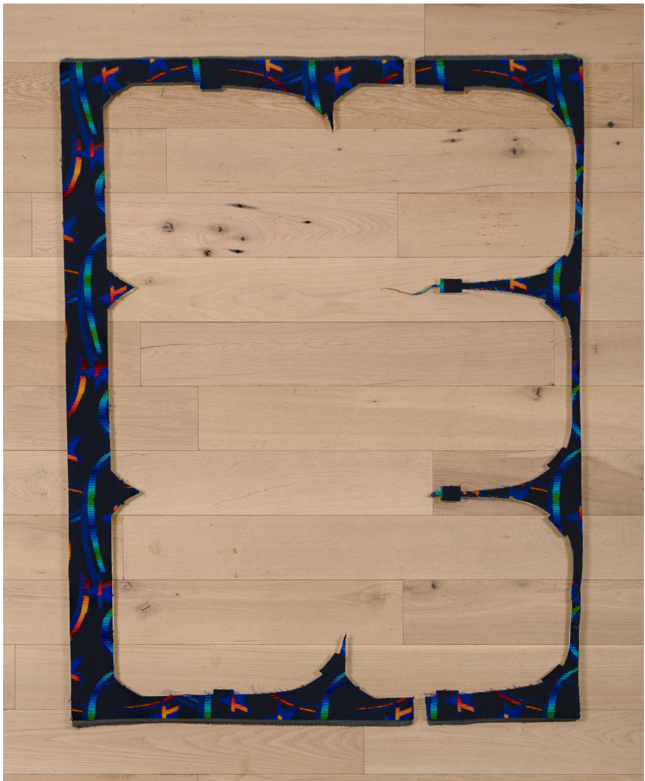
Untitled (Dark Blue), #2, 2017 fabric scraps procured from manufacturer (09/2015-11/2016) on plexi 61 1/2 × 24 × 1/2 inches