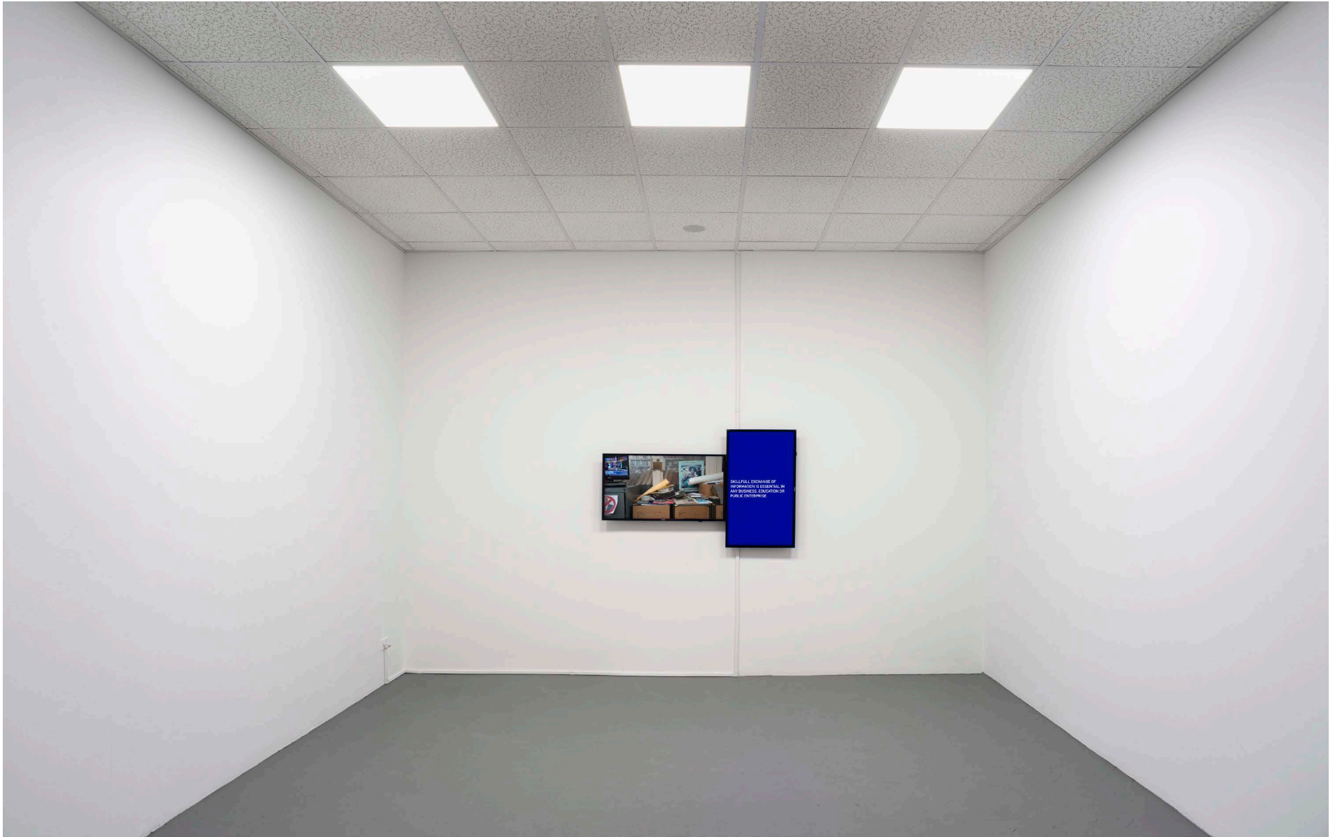
Footfall #78. 78 Metal, acoustic ceiling tiles, florescent lighting and speakers, Variable dimensions, 2019