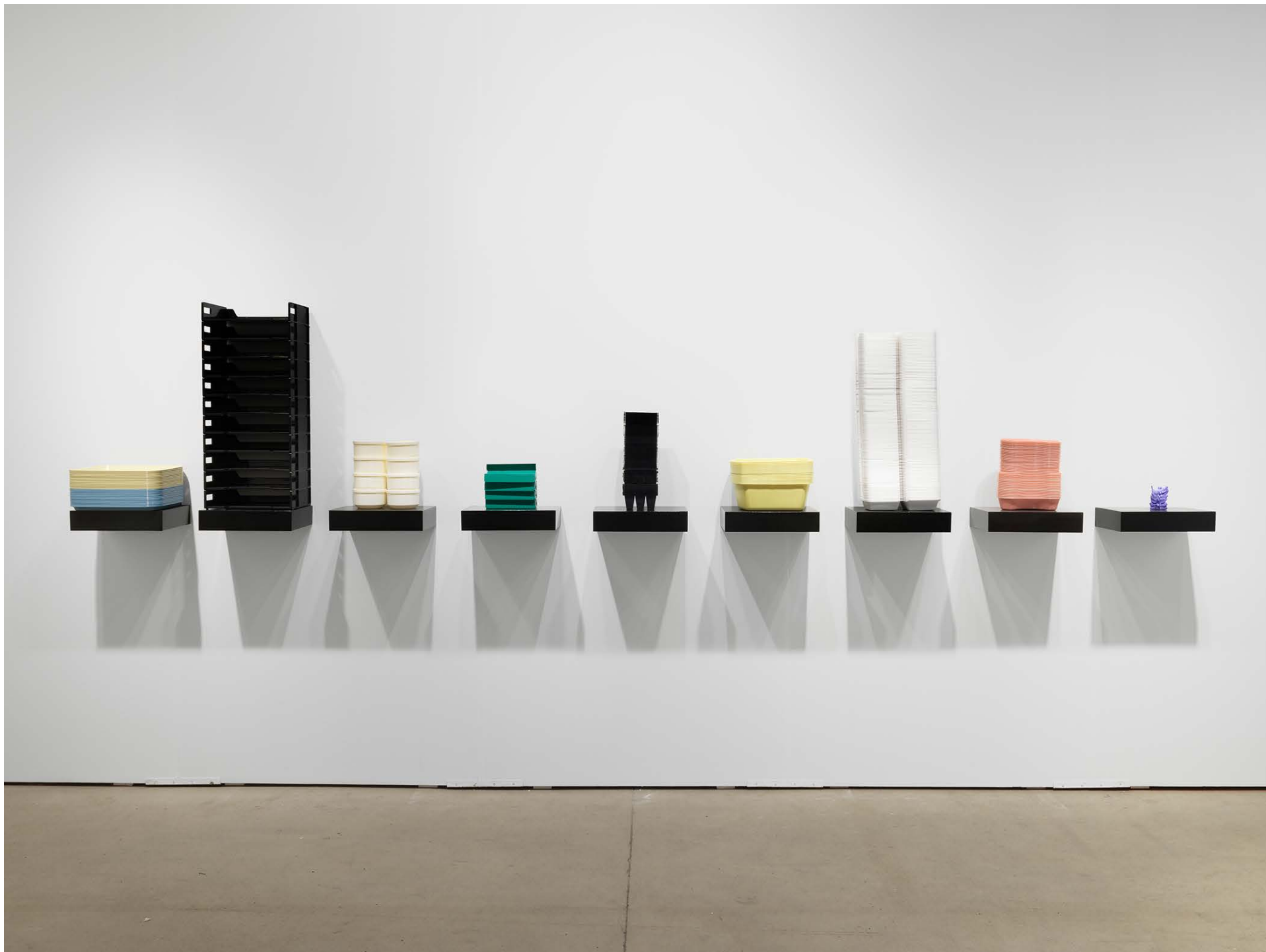
Trays For Working , Various repurposed lunch trays, dental trays, styrofoam trays, kidney trays, medical trays, plant trays, manicure trays, paper trays, coin trays, wood, lacquer paint and hardware, Variable dimensions, 2018