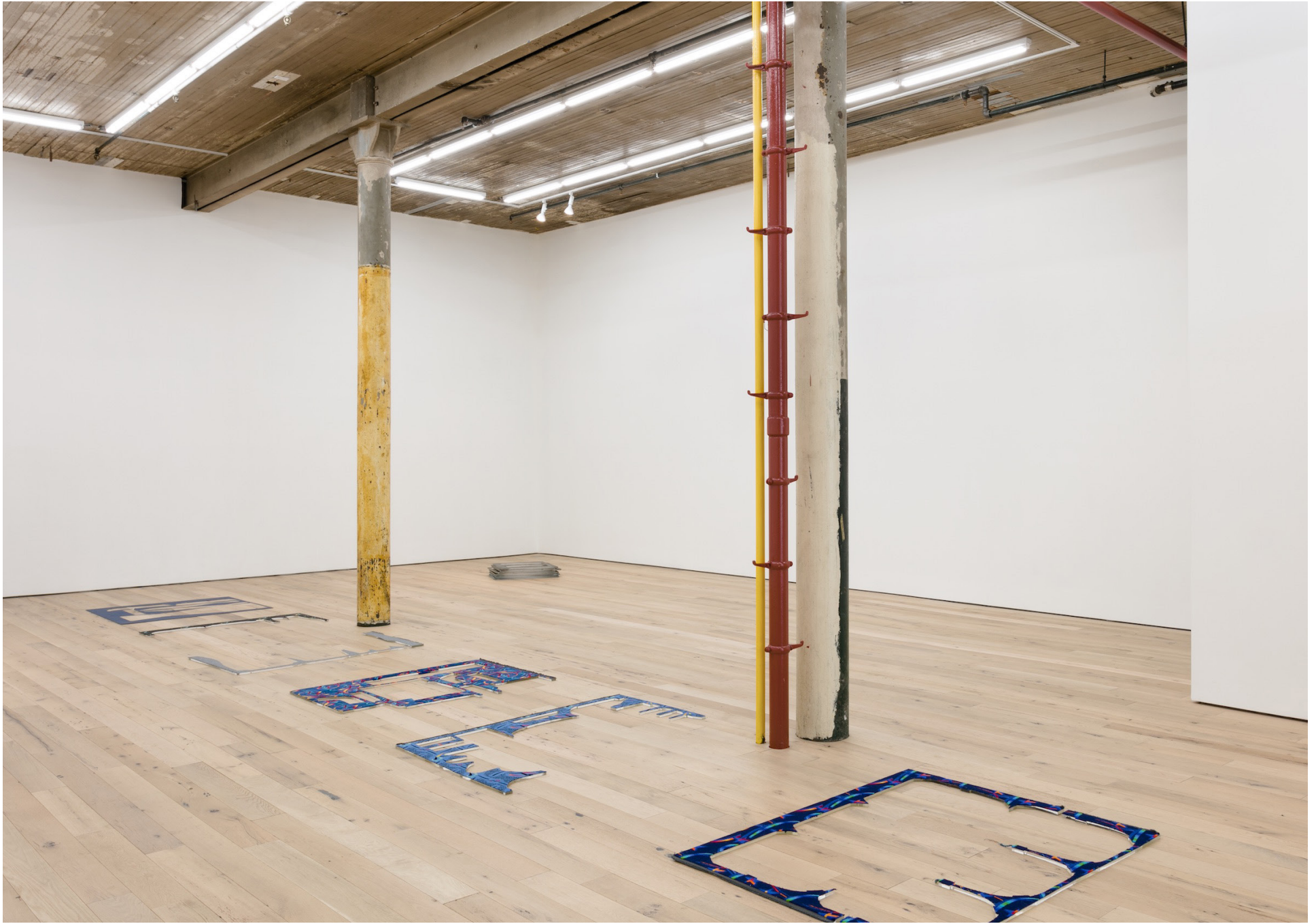
Receipt of a Form Exhibition View. Martos Gallery, 2017