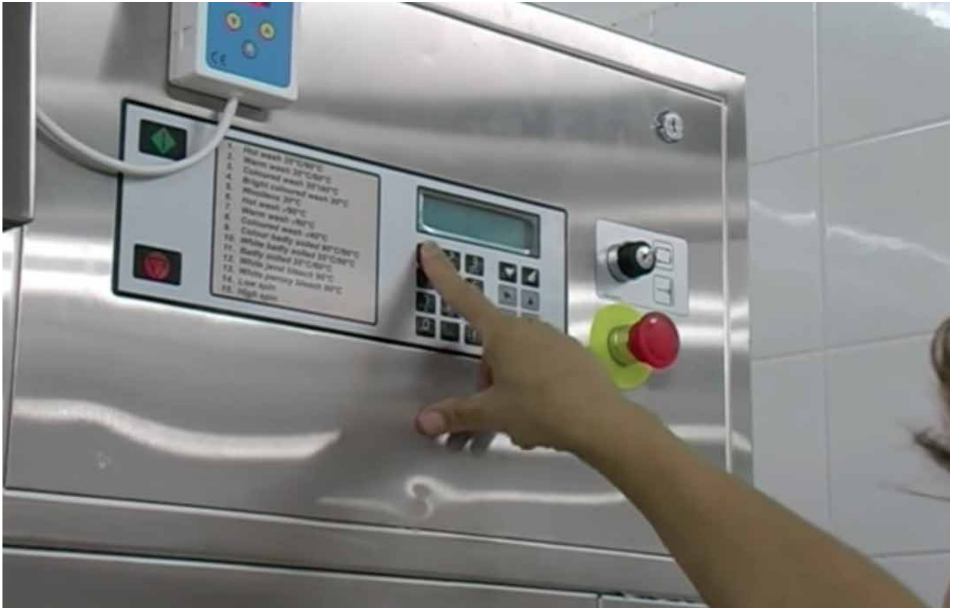
Visible Hands , (video still), Digital video, 3:48 min, 2018