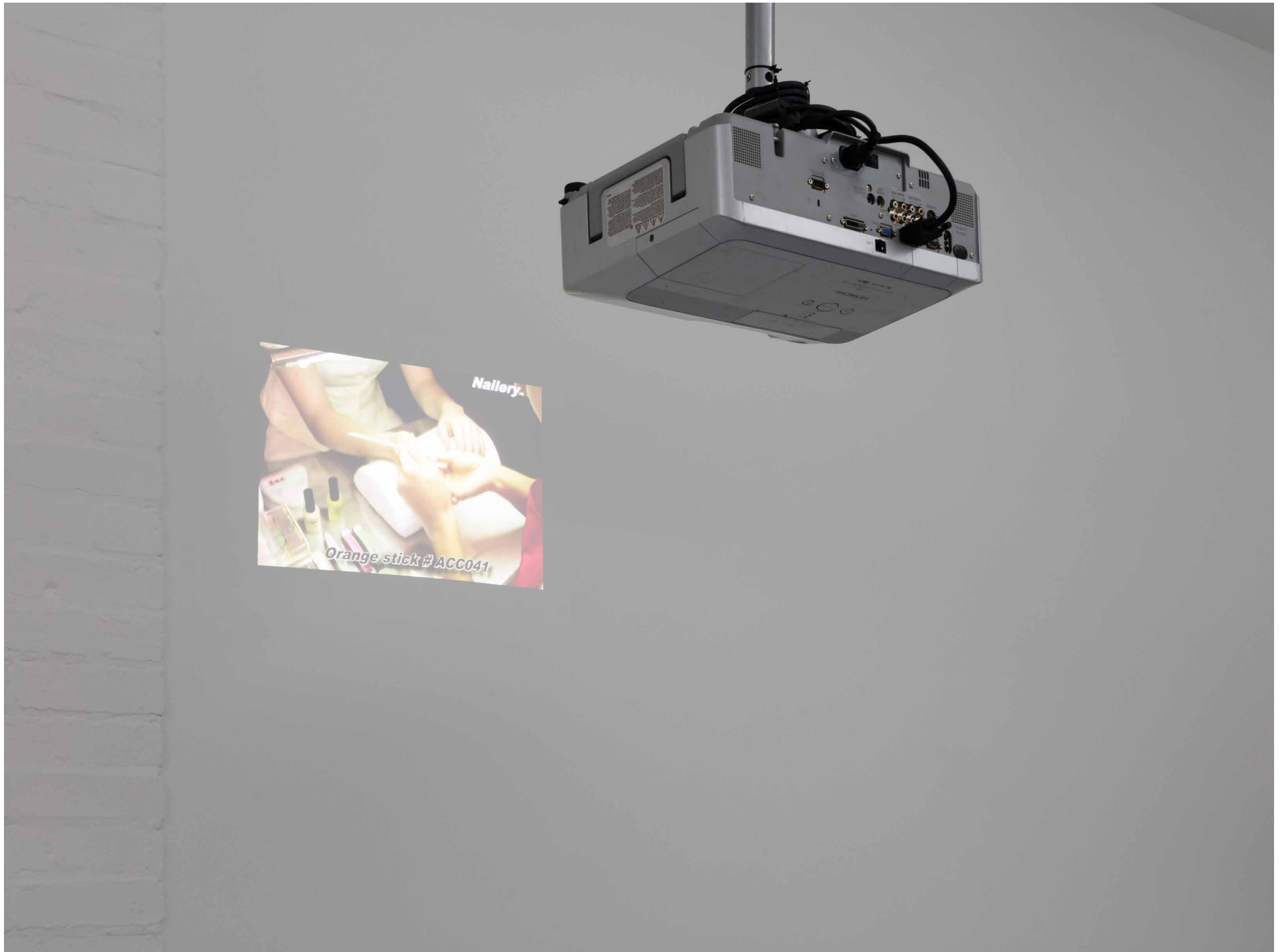
Visible Hands , Installation view, Digital video, 3:48 min, 2018