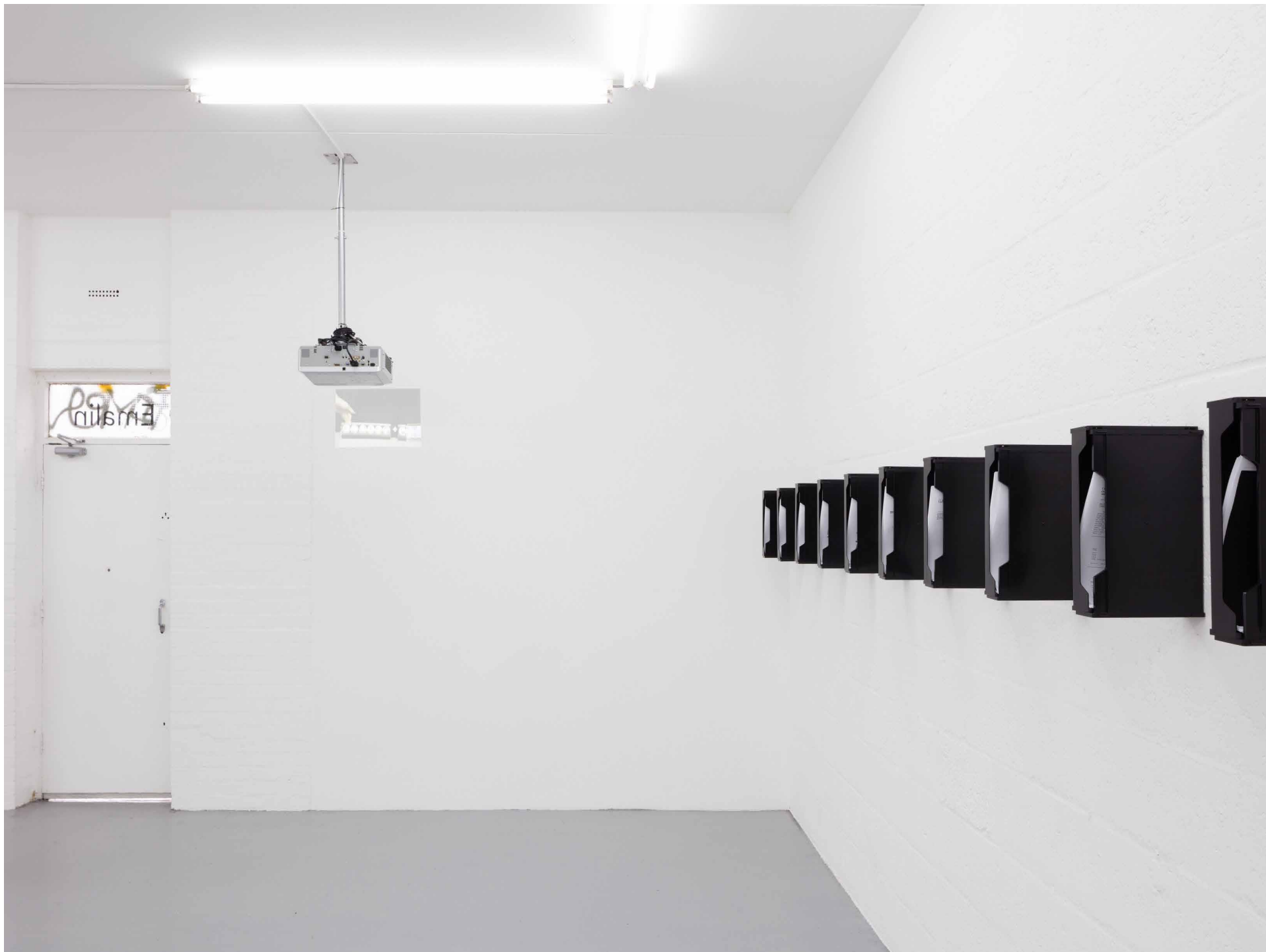
Exit Strategy , Installation view, Emalin Gallery, 2018