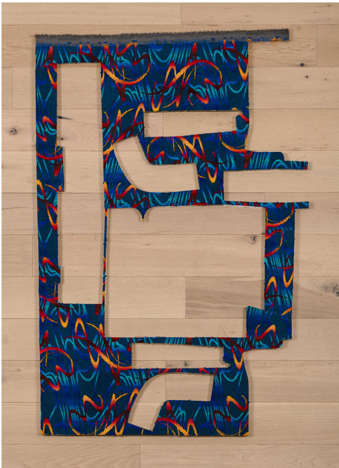
South Beach Blue No.389, # 2, 2017 fabric scraps procured from manufacturer (09/2015-11/2016) on plexi 57 × 38 3/4 × 1/2 inches