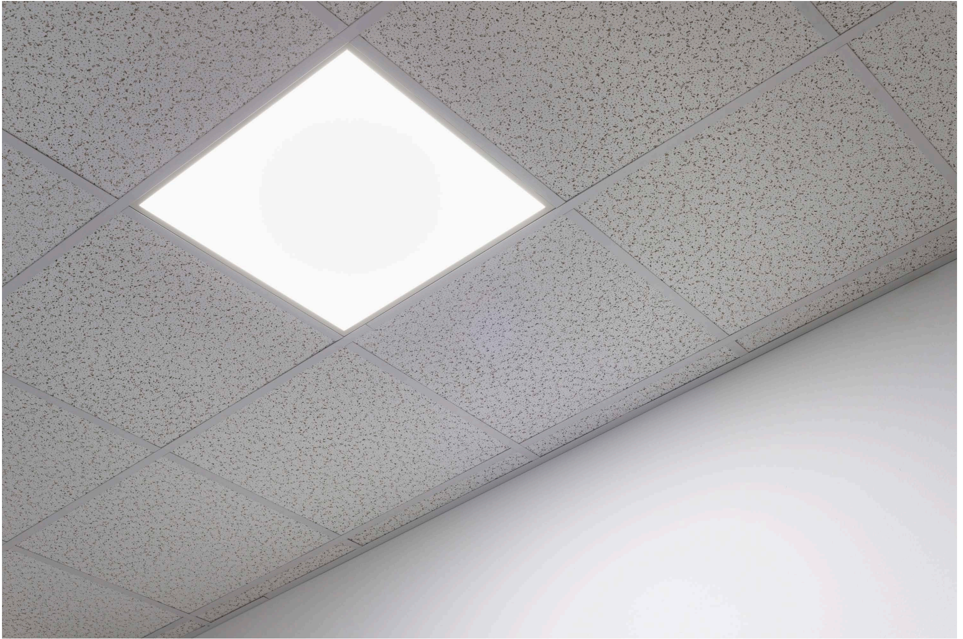
Footfall #78 . Detail. 78 Metal, acoustic ceiling tiles, florescent lighting and speakers, Variable dimensions, 2019