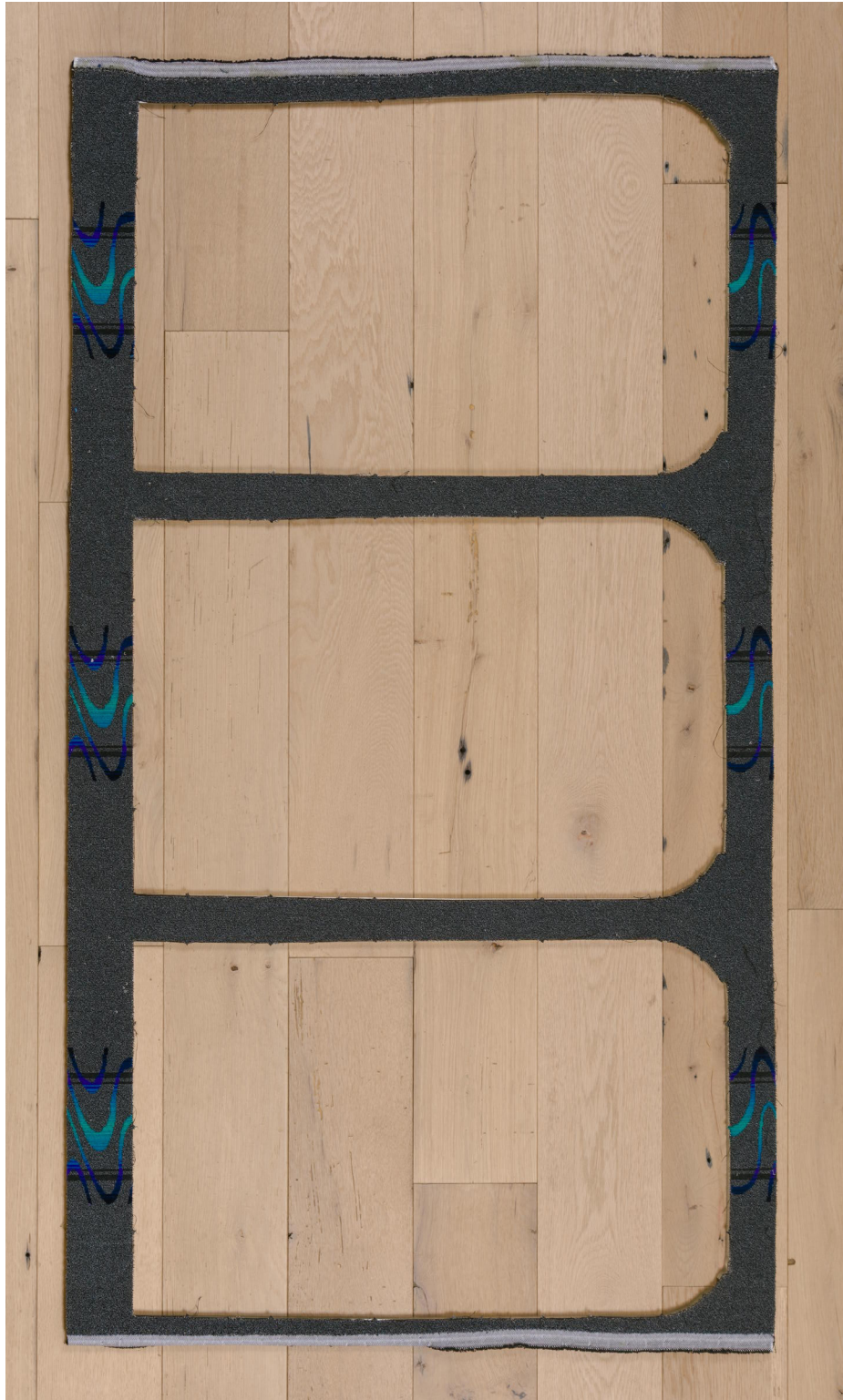
Incense Blue, 2017

fabric scraps procured from manufacturer (09/2015-11/2016) on plexi 56 x 36 x 1/2 inches