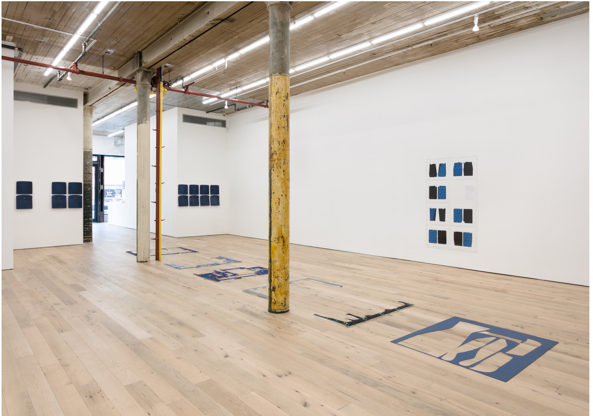
Receipt of a Form Exhibition View. Martos Gallery, 2017