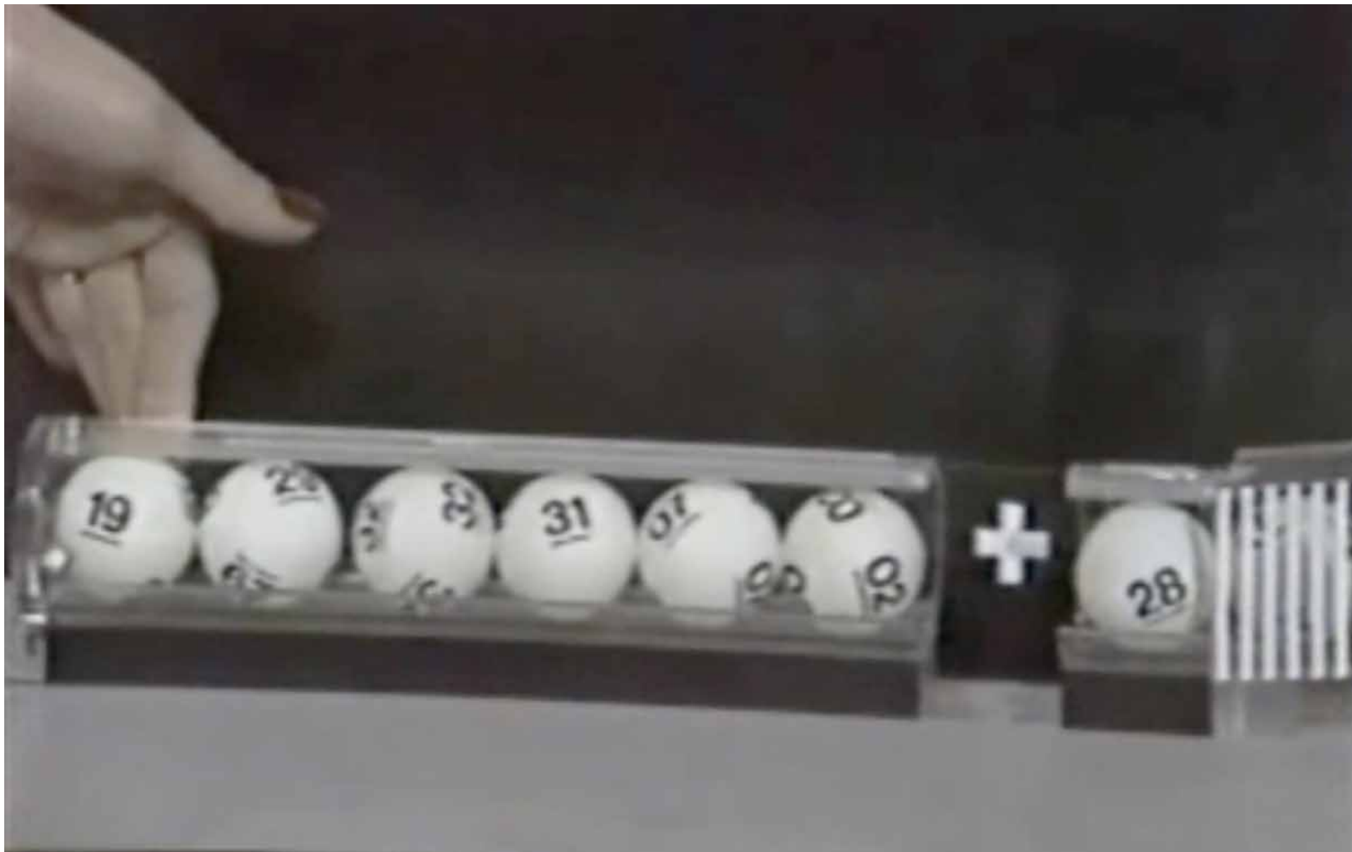
Visible Hands , (video still), Digital video, 3:48 min, 2018