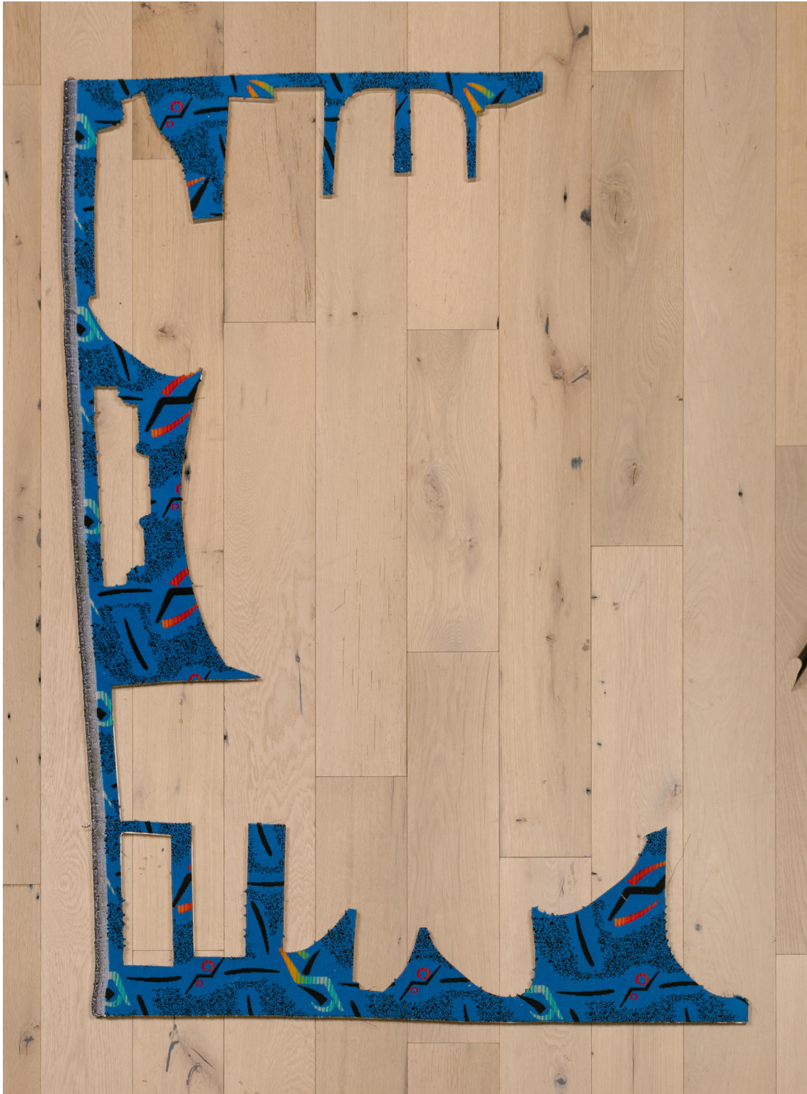
Boomer Blue No. 340 #2, 2017

fabric scraps procured from manufacturer (09/2015-11/2016) on plexi 62 × 42 × 1/2 inches