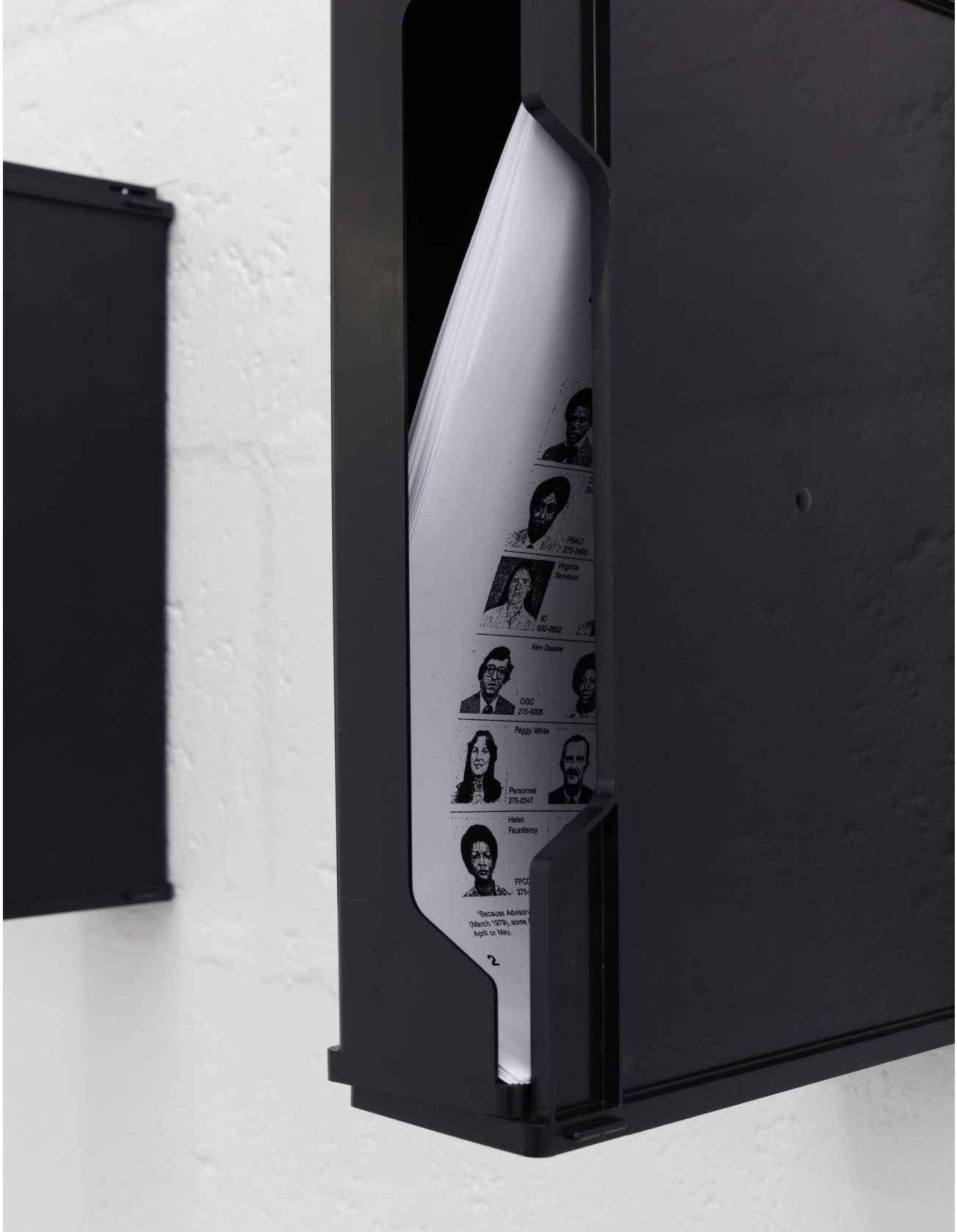
A4: 1979 EEO Affirmative Action Plan, Affirmative Action: National Institutes of Health Does Not Fully Meet Federal Requirements, Affirmative Employment: Assessing Progress of EEO Groups in Key Federal Jobs Can Be Improved, EDA: Treatment of Blacks at the Economic Development Administration in the 1980s, EEO Advisory Council's 1978 Report, EEO Oversight: Functional Study of GAO's Career Ladder Promotional Process, Equal Employment Opportunity: Immigration and Naturalization Service's Equal Employment Opportunity Program, Equal Employment Opportunity: Women and Minority Aerospace Managers and Professionals, Federal Employment: Progress of Women and Minorities in Key Federal Jobs and Handling of EEO Complaints at the Bureau of Alcohol, Tobacco, and Firearms, Report To The Honorable Shirley Chisholm House of Representatives: The National Institute of Education Should Further Increase Minority And Female Participation in its Activities, Selected Publications On Equal Employment Opportunity, Social Security Administration: Employment of and Service to Hispanics, What Is The EEO? Detail. Plastic, paper and hardware, 28' x 13.25", 2018