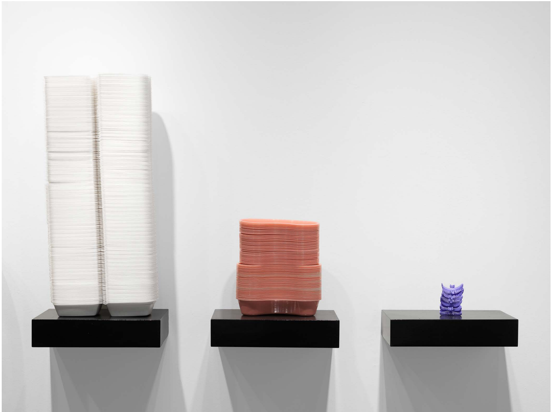
Trays For Working. Detail, Various repurposed lunch trays, dental trays, styrofoam trays, kidney trays, medical trays, plant trays, manicure trays, paper trays, coin trays, wood, lacquer paint and hardware, Variable dimensions, 2018