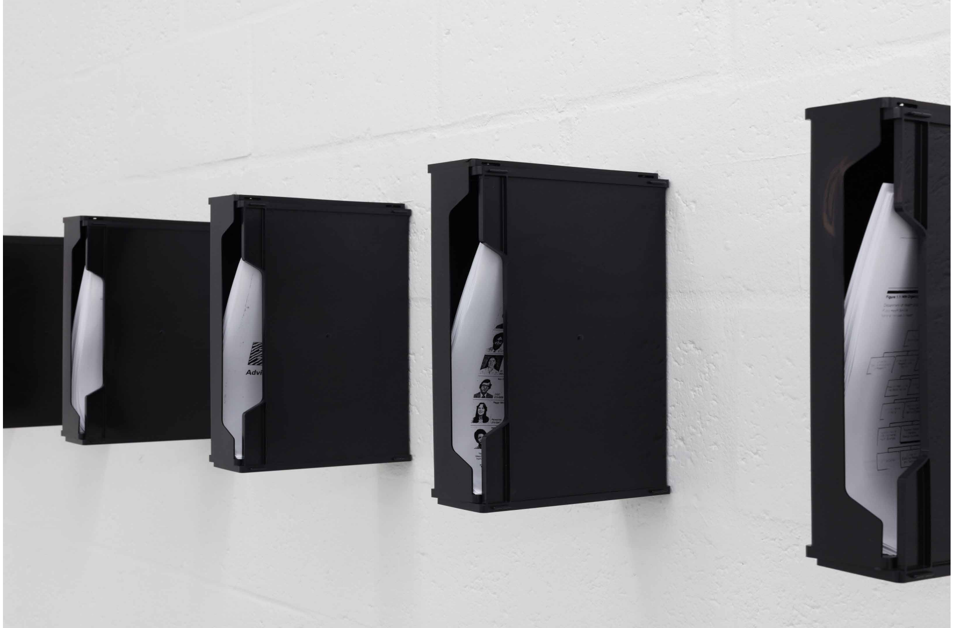
A4: 1979 EEO Affirmative Action Plan, Affirmative Action: National Institutes of Health Does Not Fully Meet Federal Requirements, Affirmative Employment: Assessing Progress of EEO Groups in Key Federal Jobs Can Be Improved, EDA: Treatment of Blacks at the Economic Development Administration in the 1980s, EEO Advisory Council's 1978 Report, EEO Oversight: Functional Study of GAO's Career Ladder Promotional Process, Equal Employment Opportunity: Immigration and Naturalization Service's Equal Employment Opportunity Program, Equal Employment Opportunity: Women and Minority Aerospace Managers and Professionals, Federal Employment: Progress of Women and Minorities in Key Federal Jobs and Handling of EEO Complaints at the Bureau of Alcohol, Tobacco, and Firearms, Report To The Honorable Shirley Chisholm House of Representatives: The National Institute of Education Should Further Increase Minority And Female Participation in its Activities, Selected Publications On Equal Employment Opportunity, Social Security Administration: Employment of and Service to Hispanics, What Is The EEO? Detail. Plastic, paper and hardware, 28' x 13.25", 2018