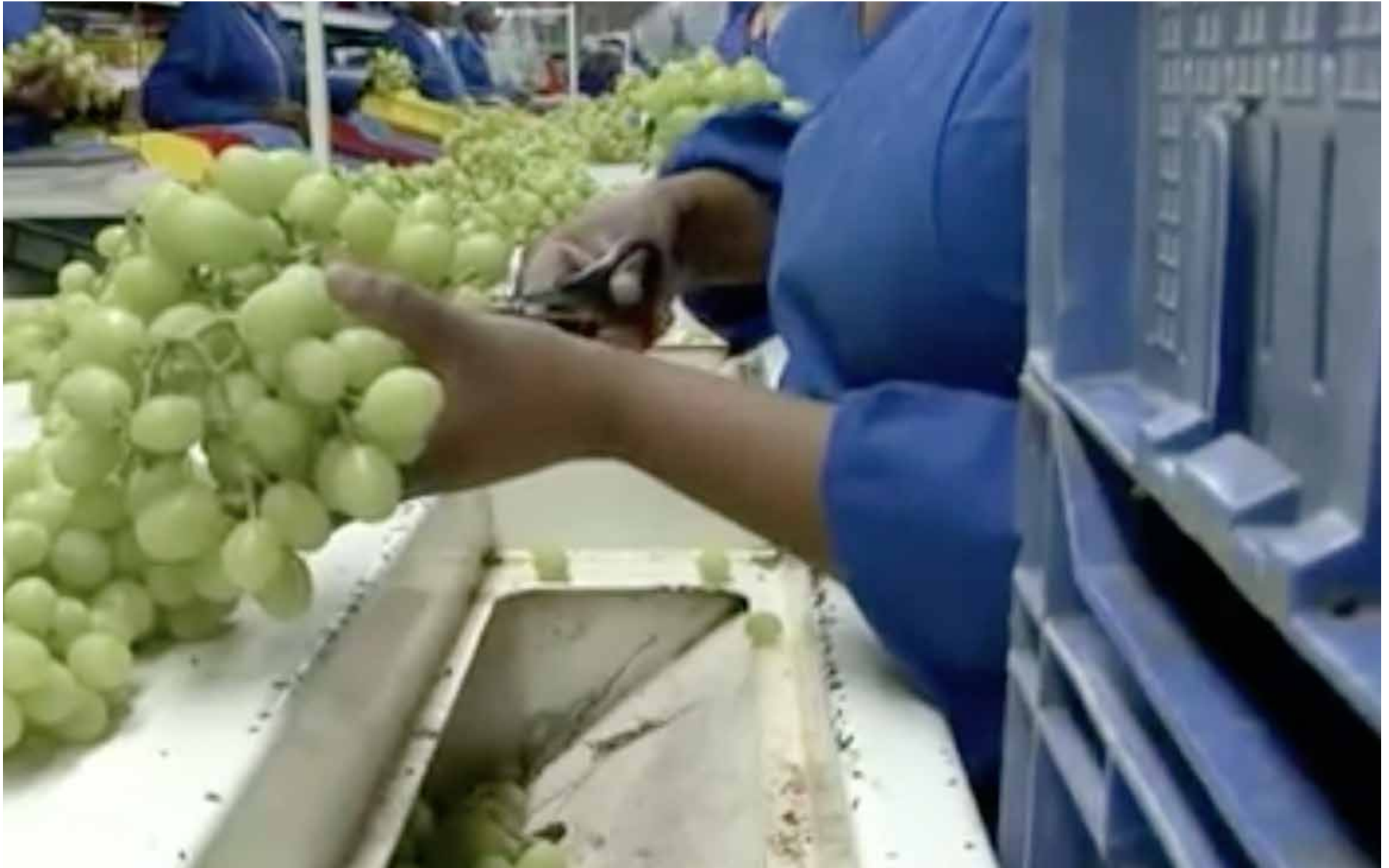
Visible Hands , (video still), Digital video, 3:48 min, 2018