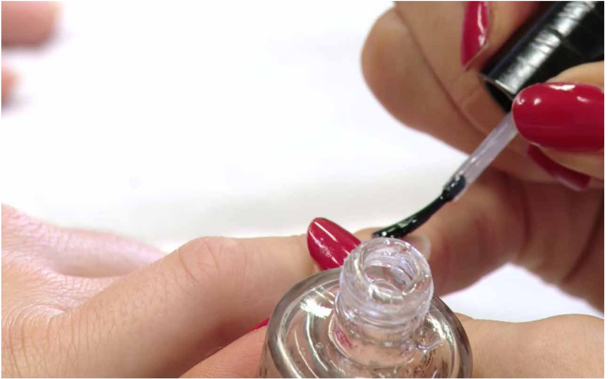
Visible Hands , (video still), Digital video, 3:48 min, 2018