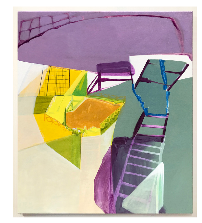
Side Fire • 2018 • 30" x 26" • acrylic on canvas

Repetitious marks resembling tiles remind me of trips to the pool, my mother renovating