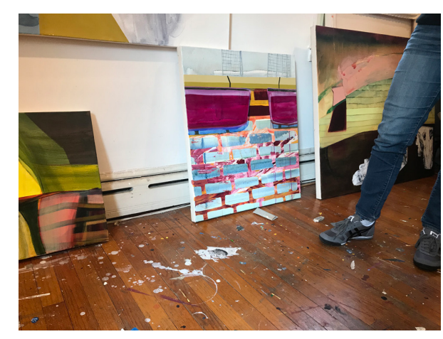
A view from our final studio visit together on January 12, 2019

sons actually created moment domestic levitu. This little painting is what originally set me off on considering difference the between a scene and a place. This place in particular contained intersection the of so many ideas (motherhood, suburban living, violence perceived