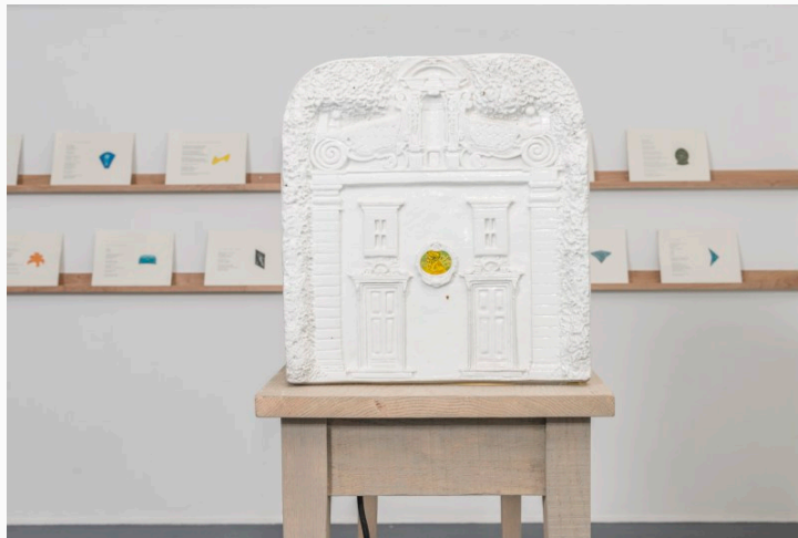
Serena Perrone, Fata Morgana , 2017, installation view [detail view of Fata Morgana / Mondo Nuovo (Tusa) in installation].