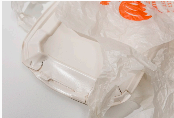
Yoonmi Nam, Take Out (Csirke-Fogo), 2015.

vulnerabilities. Their remaking into works of fine art presented a contrasting yet concurrent sense of time, both eternal and fleeting, forcing us to question the temporality of such objects in our own worlds. Indeed, though these objects that we encounter everyday are trash, created to be used and discarded even more swiftly than cut flowers, their presence in landfills and on our streets belies their intended disposability. In particular, the Styrofoam containers evoke their persistent presence through our knowledge that unlike the flowers, they will not biodegrade. Nam's work thus seemed to offer an eternal solution to the inevitable decay of such impermanent things, as if, by rendering such images in porcelain and fine paper, she has suspended them in time, like a fly in amber.