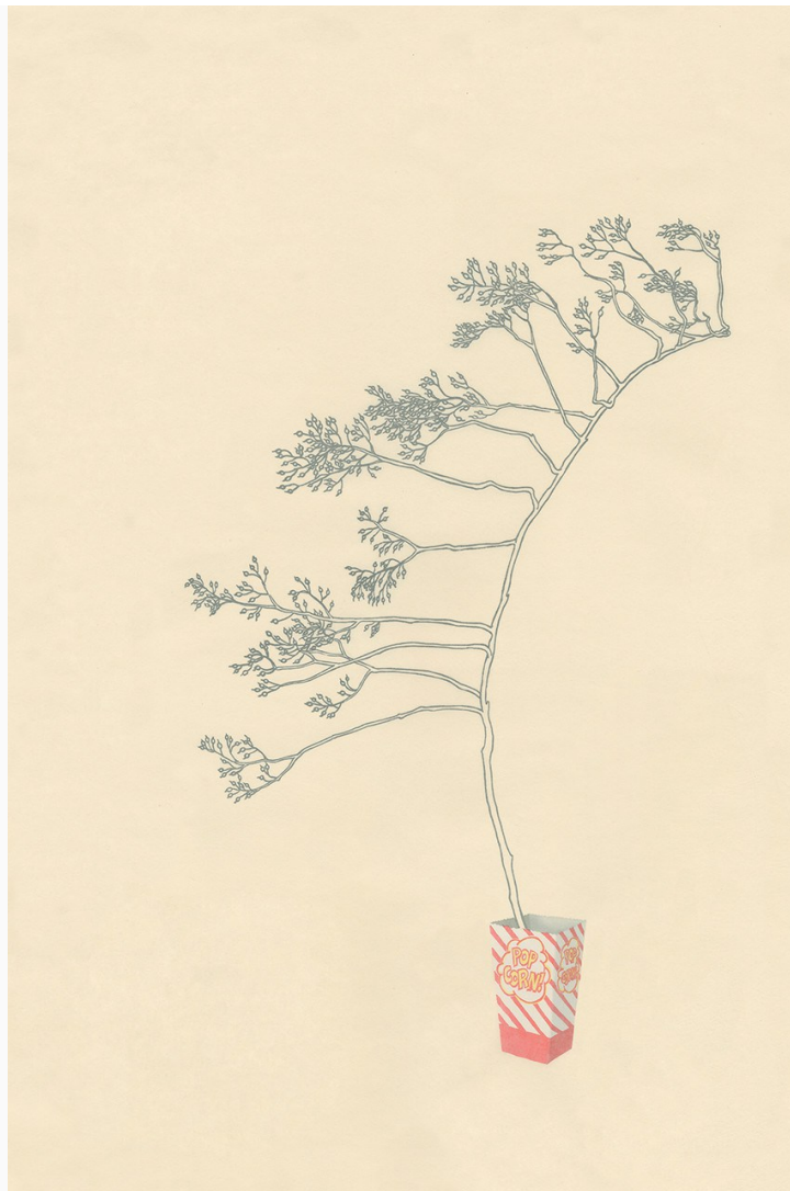
Yoonmi Nam, POP CORN!, 2016

Accompanying the prints were several sculptural objects variously depicting ever-more disposable and quotidian objects, including plastic bags and food containers. There was something humbling about the attention and care that Nam has bestowed upon takeout bags with that ever-present yellow smiley face, or crushed Styrofoam containers, broken as if they'd been stepped on; the deceptively realistic bags were, in fact, printed on fine Japanese paper, and what looked like Styrofoam was really porcelain. Displayed on pedestals throughout the gallery, Nam both elevated their value and invited viewers to take a closer look, to inspect their delicate and fragile material. As containers of our quotidian habits, these containers are also relics of our lives, our values and our