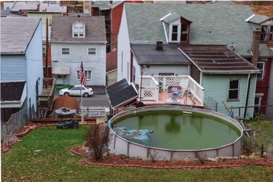
Justin Kimball, Oak Street from the Elegy series

this green is the aqua-colored plastic of the pool-cover partly submerged in the water, and the pastel green paint on one wall of an extension of the house. A view to the street, although foreclosed by the side of a house, suggests a fairly dense, if unseen, population. As is par for the course in such photography, Kimball does not miss the opportunity to find two bright and shiny U.S. flags and apply them parallel to the picture plane.