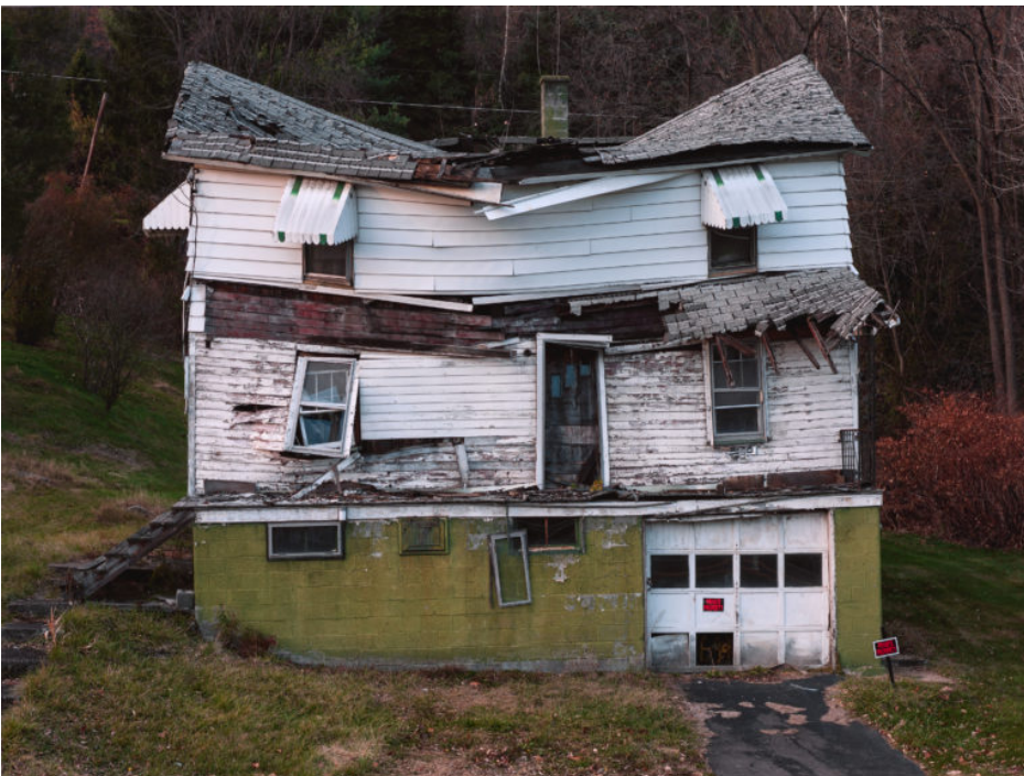
Justin Kimball, North Greenbush Road from the Elegy series

this green is the aqua-colored plastic of the pool-cover partly submerged in the water, and the pastel green paint on one wall of an extension of the house. A view to the street, although foreclosed by the side of a house, suggests a fairly dense, if unseen, population. As is par for the course in such photography, Kimball does not miss the opportunity to find two bright and shiny U.S. flags and apply them parallel to the picture plane.