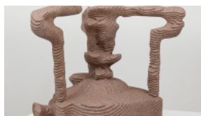
BY RACHEL SHIPPS - DECEMBER 1, 2014

Early Exposures: 19th Century Photography at the RISD Museum