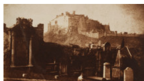
BY MICHAEL ROSE - JULY 9, 2015

Contemporary Master Drawings at Cade Tompkins Projects