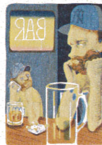
Nicole Eisenman, Bar , 2012, Lithograph.