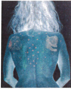
Valerie Hammond, Apports , 2012, Photographure.