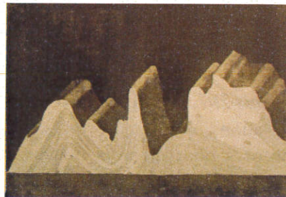
William Skeritt, Catskill Layer Cake , 2012, Etching and Aquatint.

IPCNY presents New Prints 2013/Winter , consisting of over sixty projects by artists at all stages of their careers, selected from some 3,000 submissions. The exhibition will be on view at 508 West 26th St, 5th Floor, from January 18, 2013 - March 9, 2013. New Prints 2013/Winter is the forty-fourth presentation of IPCNY's New Prints Program, a series of juried exhibitions organized by IPCNY several times each year featuring prints made within the past twelve months. An illustrated brochure with a curatorial essay accompanies the exhibition.