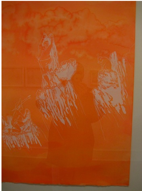
Here is a detail of this screen print on water color wash.