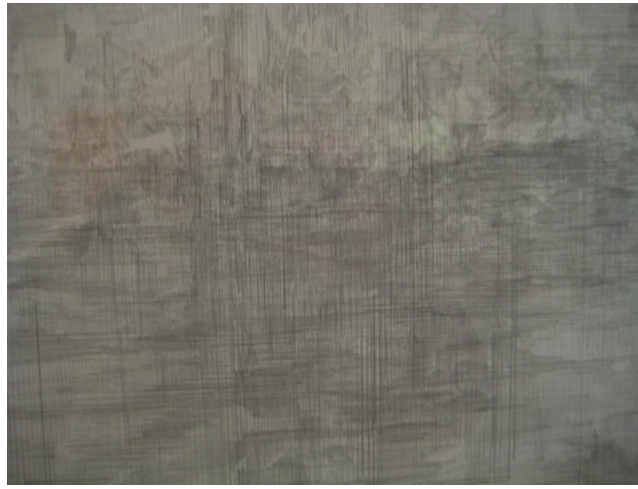
Above are Kelly Wallace's Reparations no. 1 & 2 . with a detail of no. 2 .