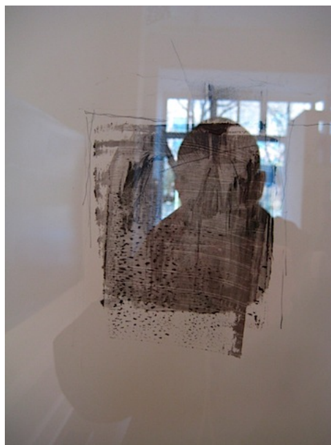
Below is the large, lovely woodcut Through the Periscope by Serena Perrone, followed by detailed shots.