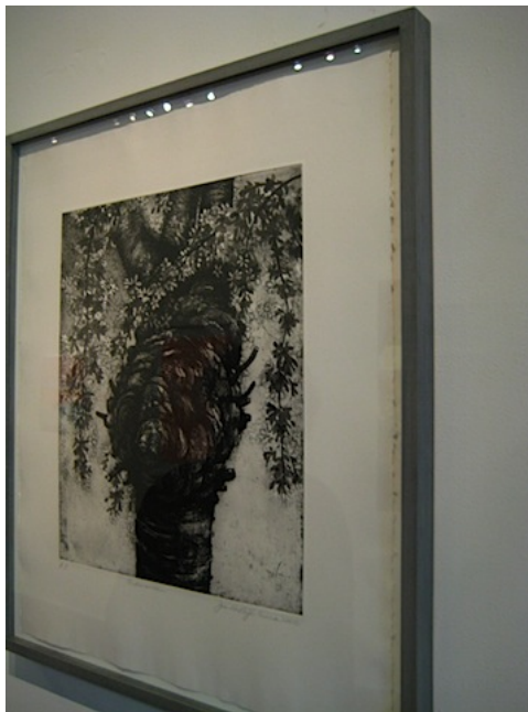
The show also incorporated some historic work, like this Harry Bertoia piece from the 1970's.