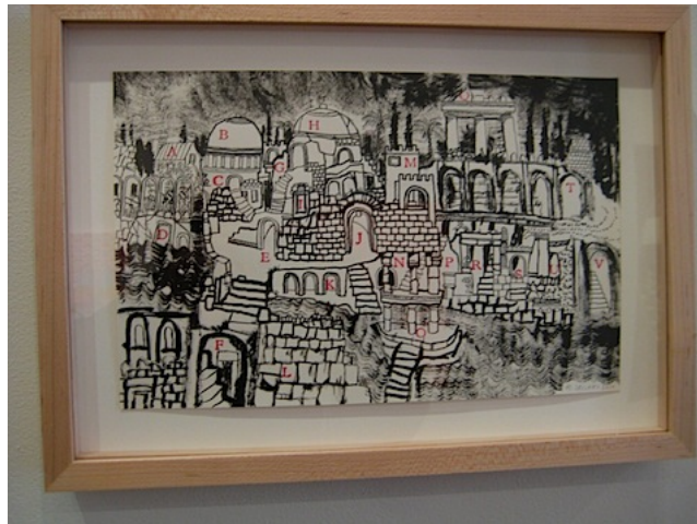
Below, Randall Sellers, Forget Repeat 1.