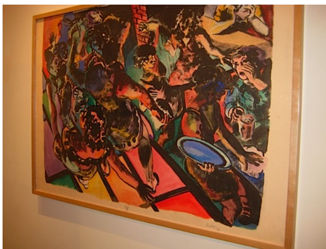
Here is an installation shot from their back gallery space.