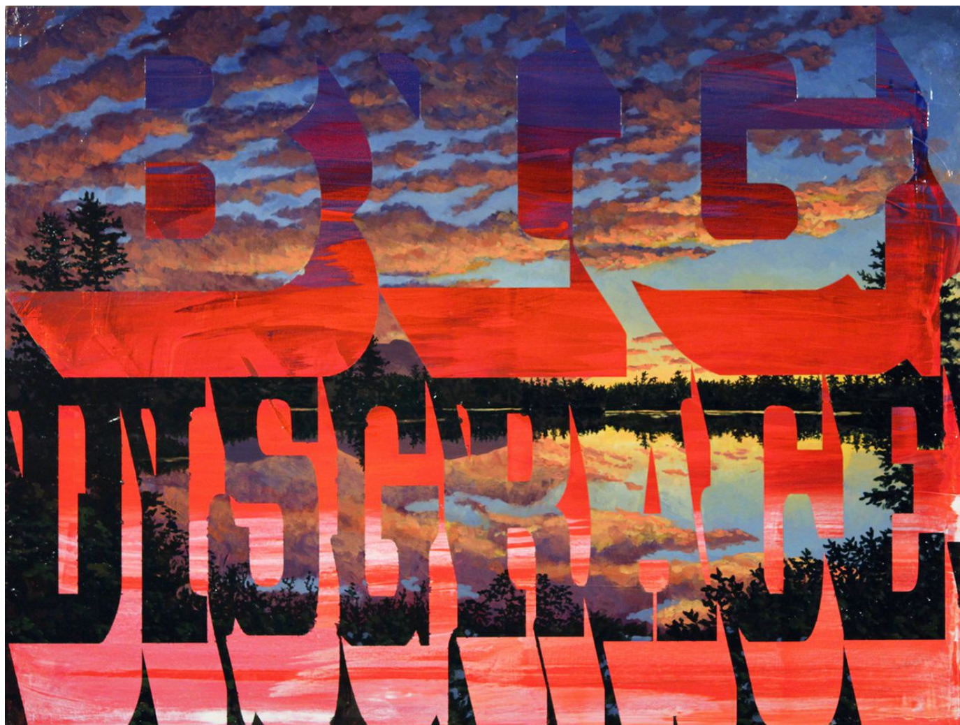
Artist Joe Wardwell's exhibit continues his exploration of American landscape and rock music with "Big Disgrace."

His marks create a constellation, bring the galaxies down to earth and onto the scrap heap, and reference the Nazca Lines, shallow designs carved into the ground in the Peruvian desert more than a millennium ago. History telescopes in this piece. So does scale. It's humbling.