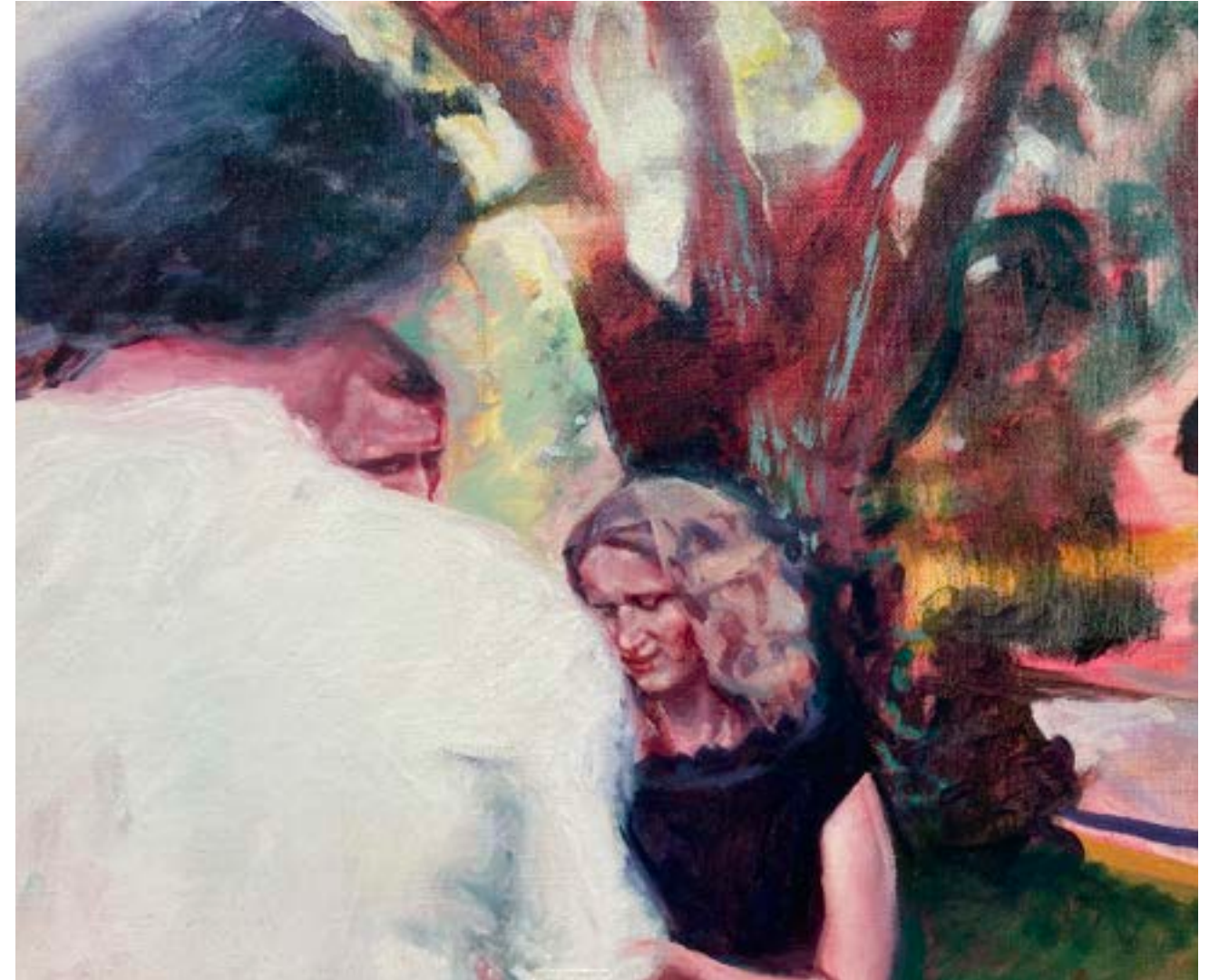
Embarkation # 5 , Oil on Linen, 11x14 in, 2008