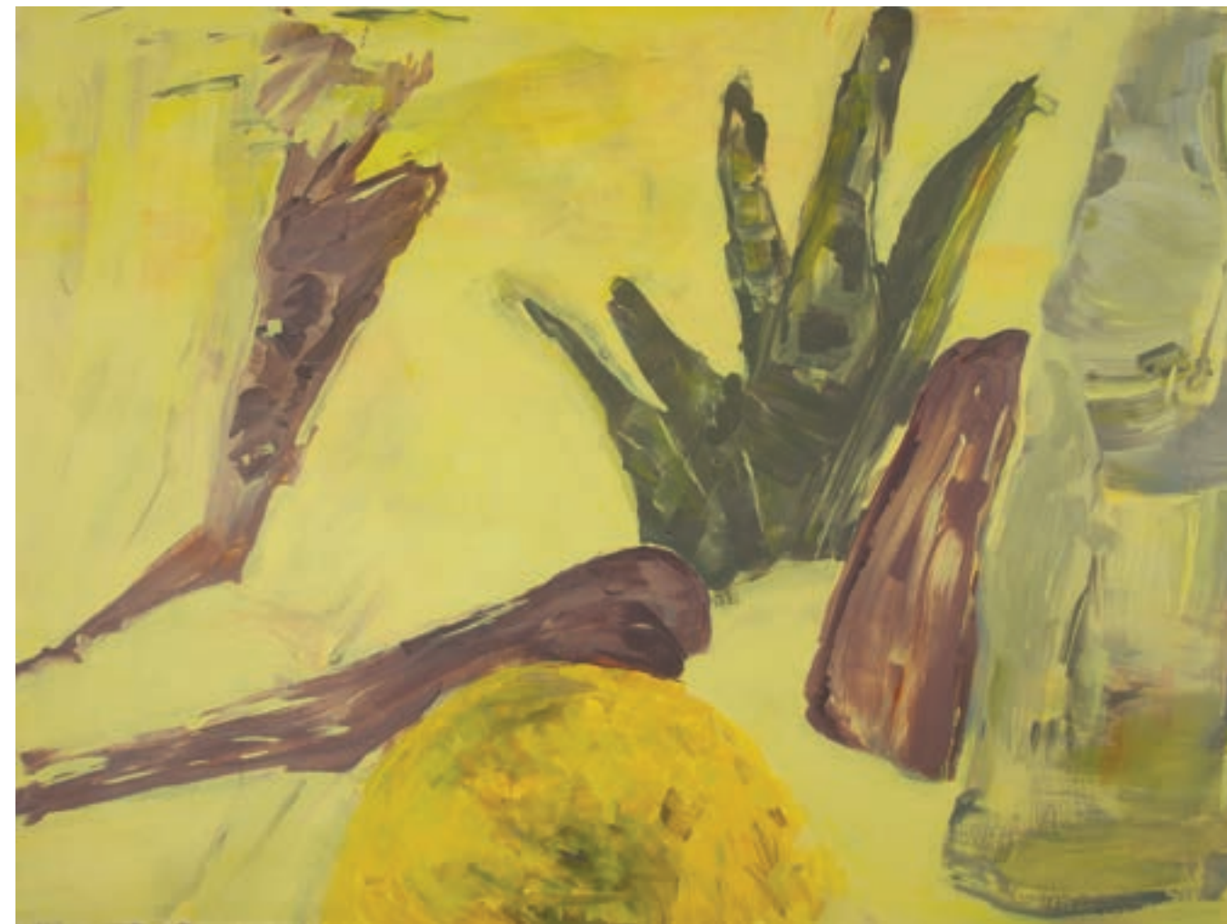
Dream Abstraction #2 , Acrylic on Arches cold press watercolor paper, 22x30 in, 2023