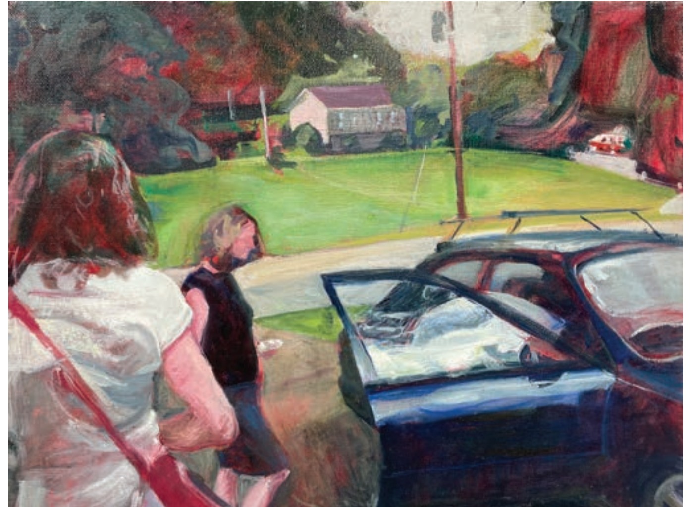
Embarkation # 1 , Oil on Linen, 11x14 in, 2008