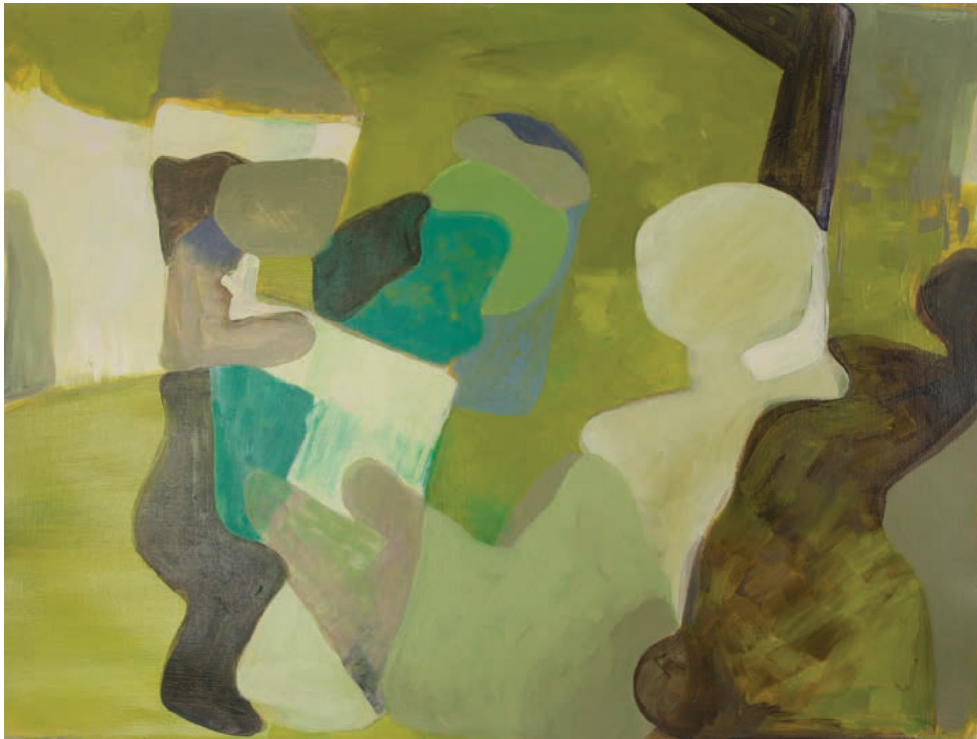
Dream Abstraction #60 , Acrylic on Arches cold press watercolor paper, 22x30 in, 2023