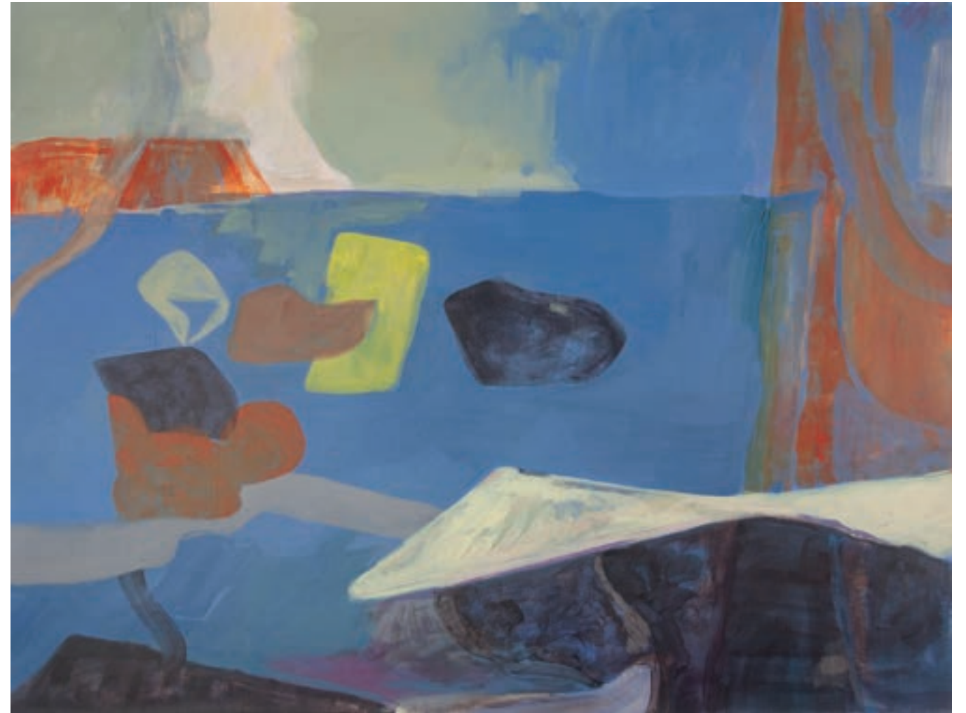
Dream Abstraction #38 , Acrylic on Arches cold press watercolor paper, 22x30 in, 2023