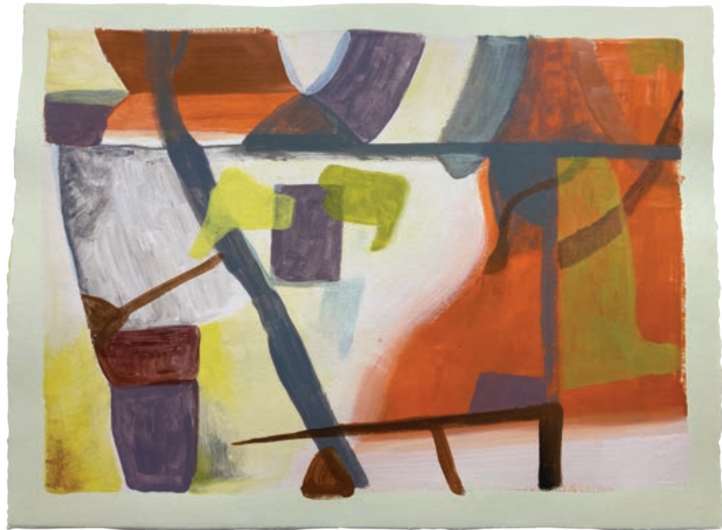
Abstract Variation #32, Acrylic on Stonehenge paper, 11x15 in, 2013.