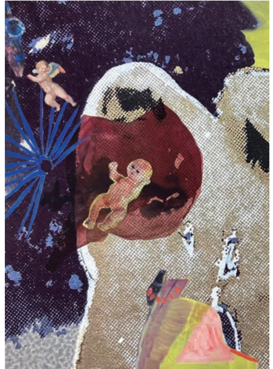
Proceeds of a processions #4 , Digital collage, inkjet print, paper collage and acrylic paint on Canson paper, 20.5x14.5 in, 2024