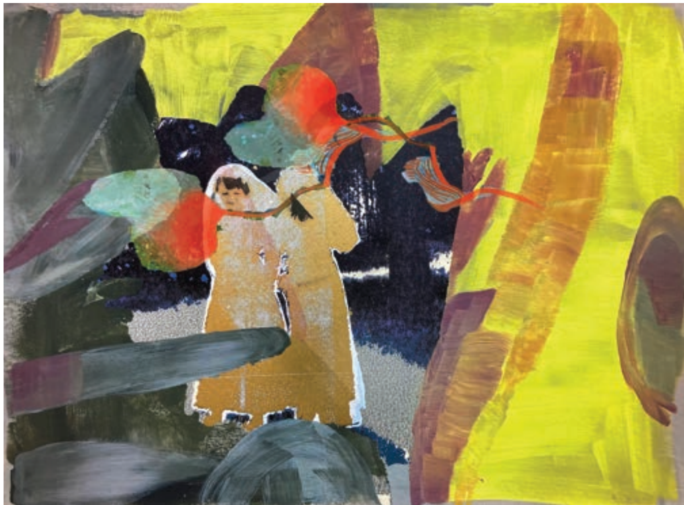
Proceeds of a processions #1 , Digital collage and inkjet print on Canson paper, 14.5x20.5 in, 2024