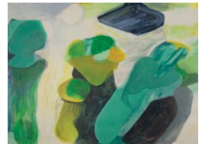
Dream Abstraction #61

Originally, Crean intended these works as the starting point for yet a further iteration. They were meant as abstracted spaces that would serve as the settings for figural imagery. Just as in a theater stage, the variations allow the scene to take on a different character simply by changing the layout or the lighting. As compelling as these paintings were as scenes in which to deploy figuration, Crean realized as she progressed that they also had the capacity to stand on their own as finished compositions. They reminded her, as she ex-