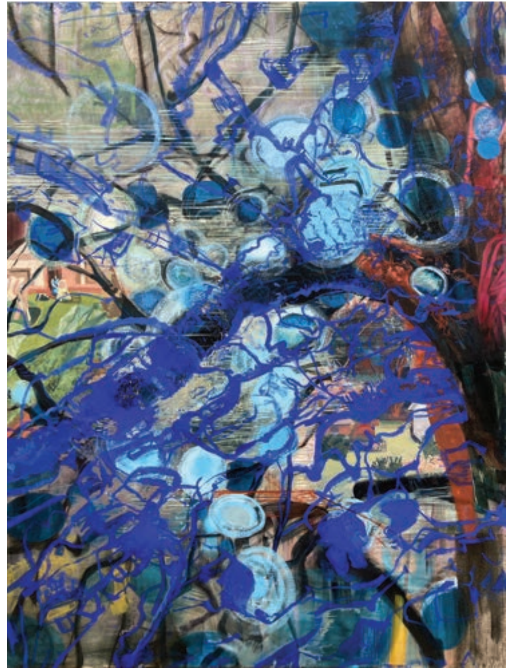
Through the Branches , Oil on linen, 69x52 in, 2024