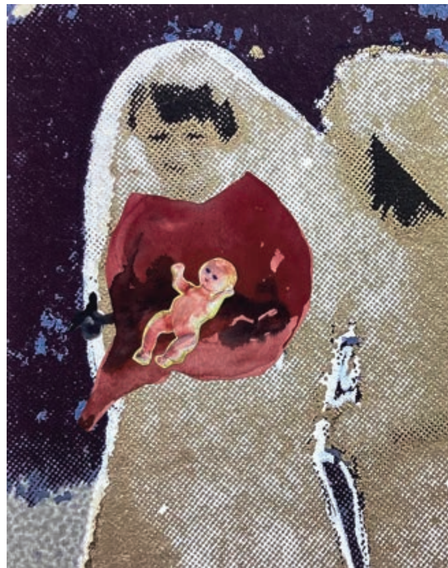
Proceeds of a processions #2 , Digital collage and inkjet print on Canson paper, 20.5x14.5 in, 2024