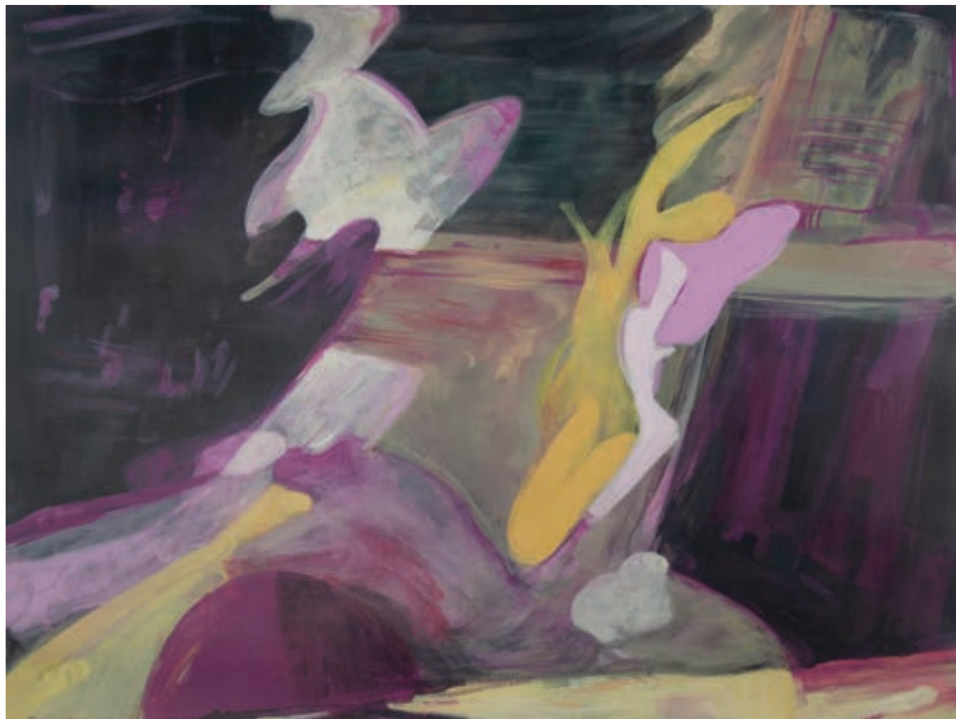
Dream Abstraction #49 , Acrylic on Arches cold press watercolor paper, 22x30in, 2023