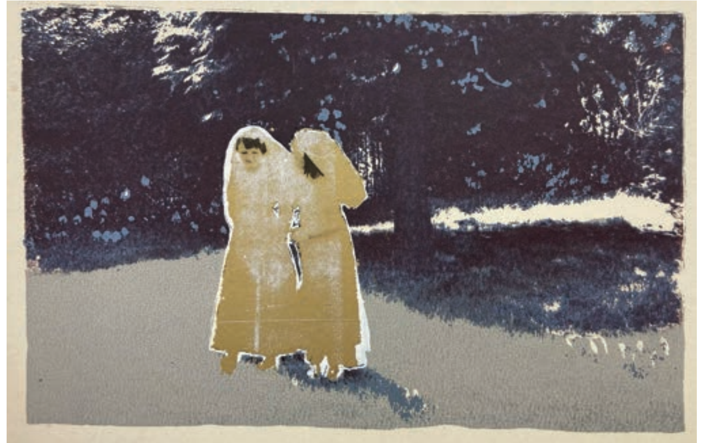
Communion , Screen print, 8 x 12 in, 1977