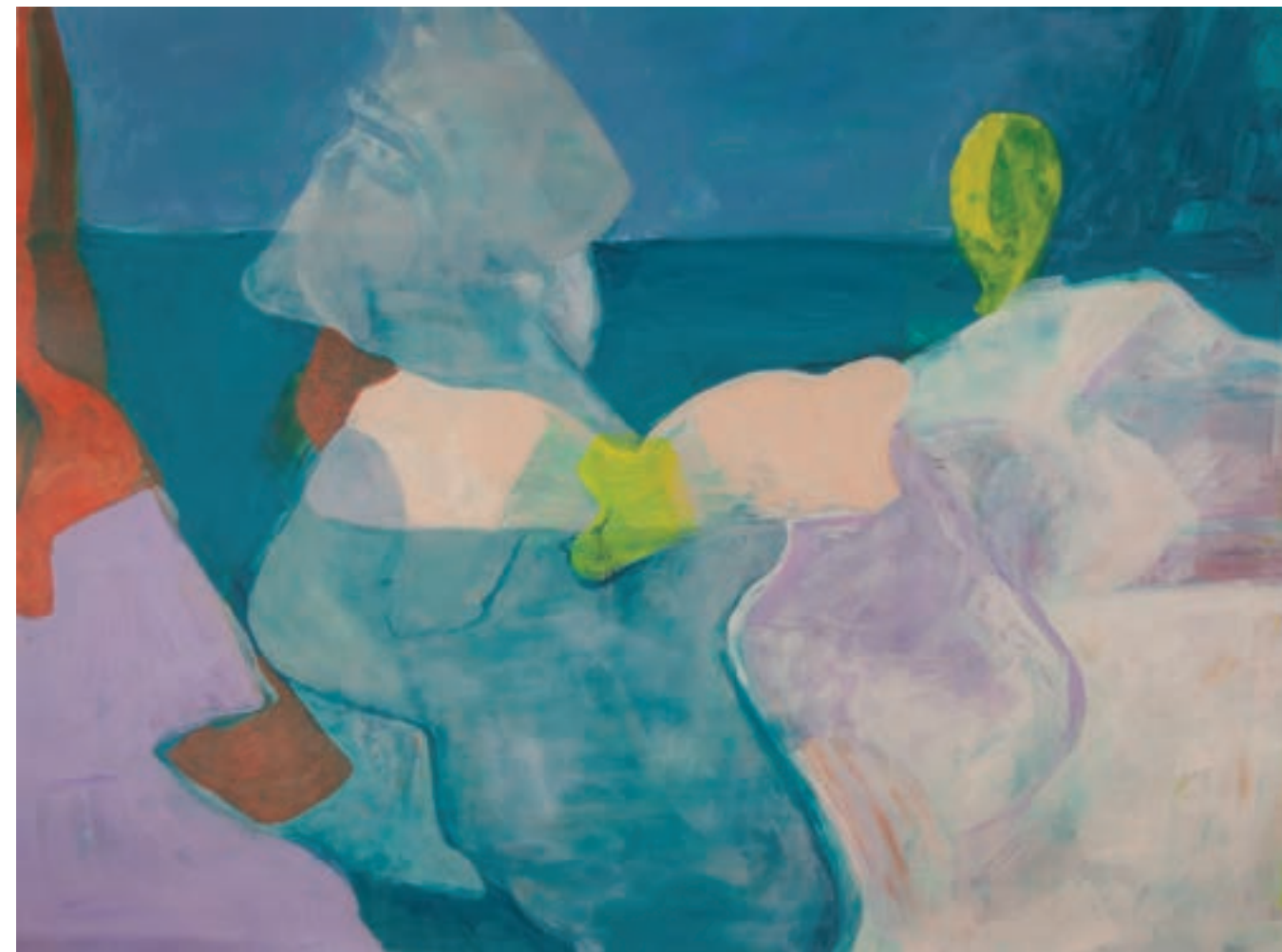
Dream Abstraction #37 , Acrylic on Arches cold press watercolor paper, 22x30 in, 2023