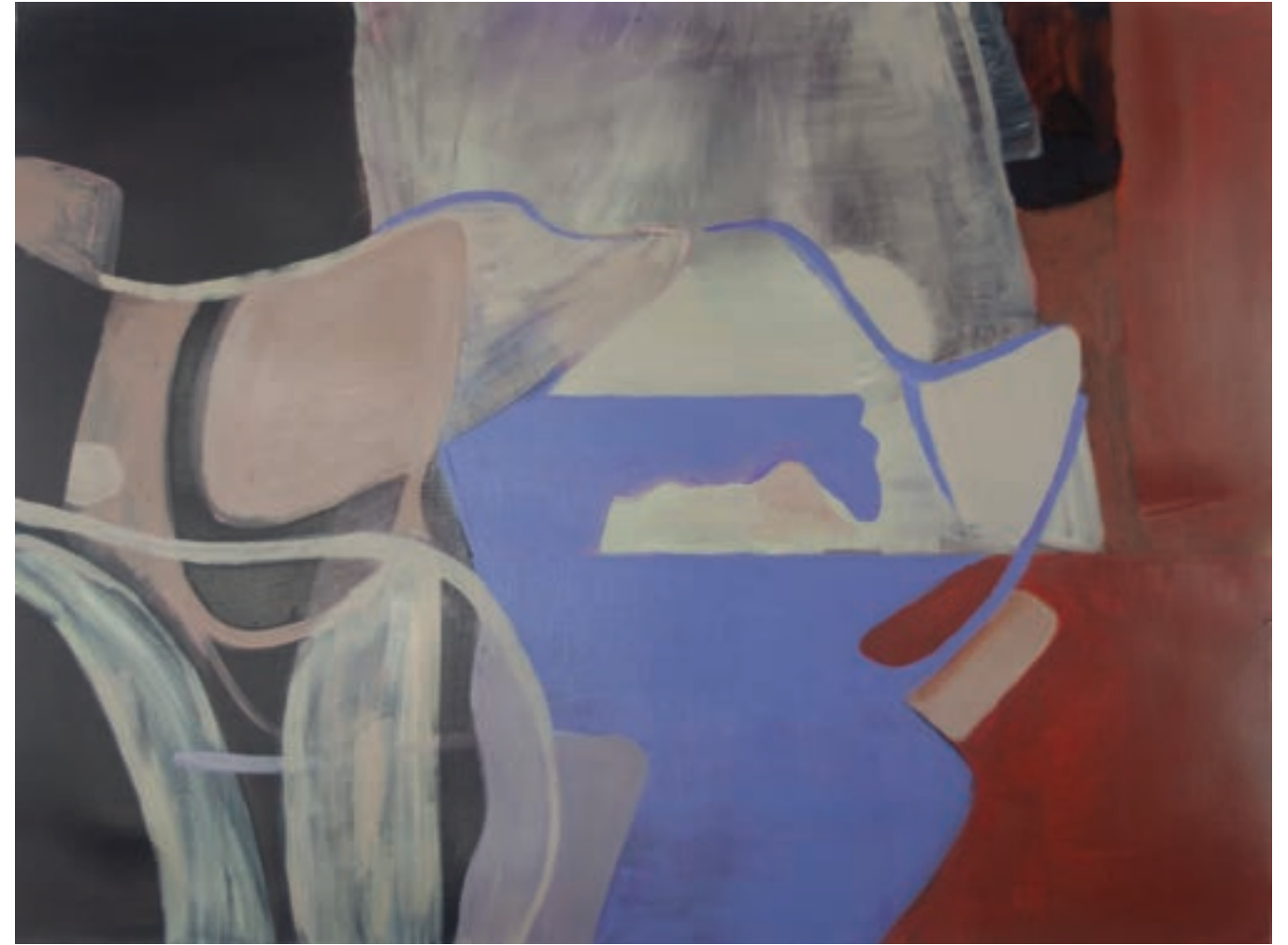
Dream Abstraction #63 , Acrylic on Arches cold press watercolor paper, 22x30 in, 2023