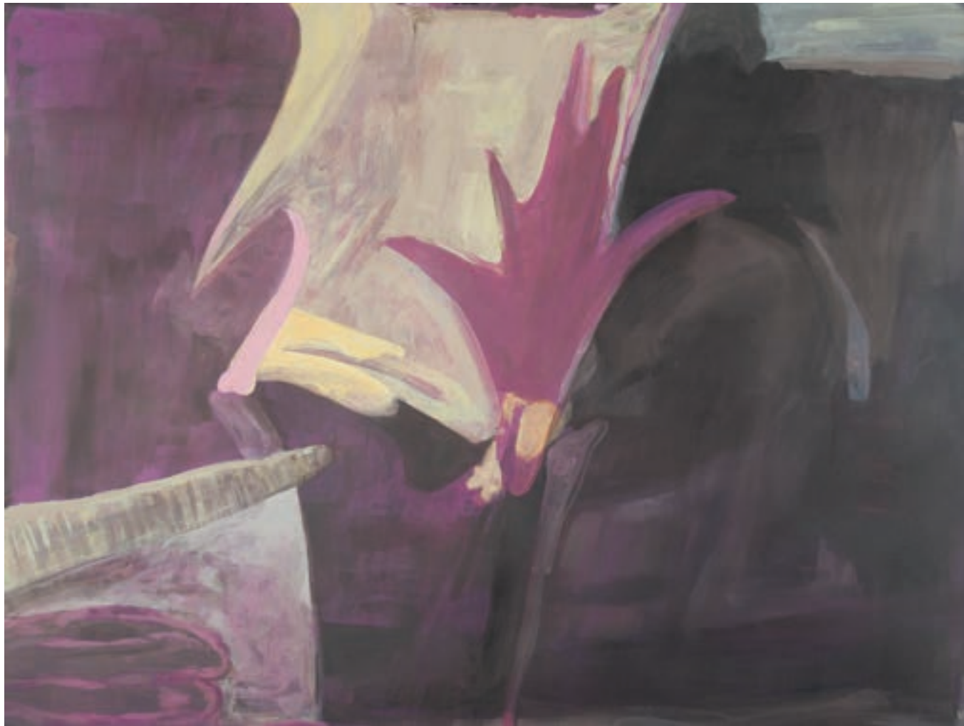
Dream Abstraction #4 , Acrylic on Arches cold press watercolor paper, 22x30 in, 2023