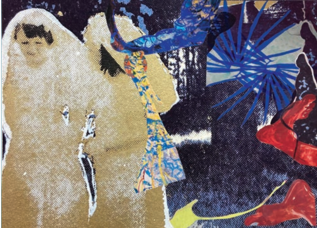
Proceeds of a processions #3 , Digital collage and inkjet print on Canson paper, 14.5x20.5 in, 2024