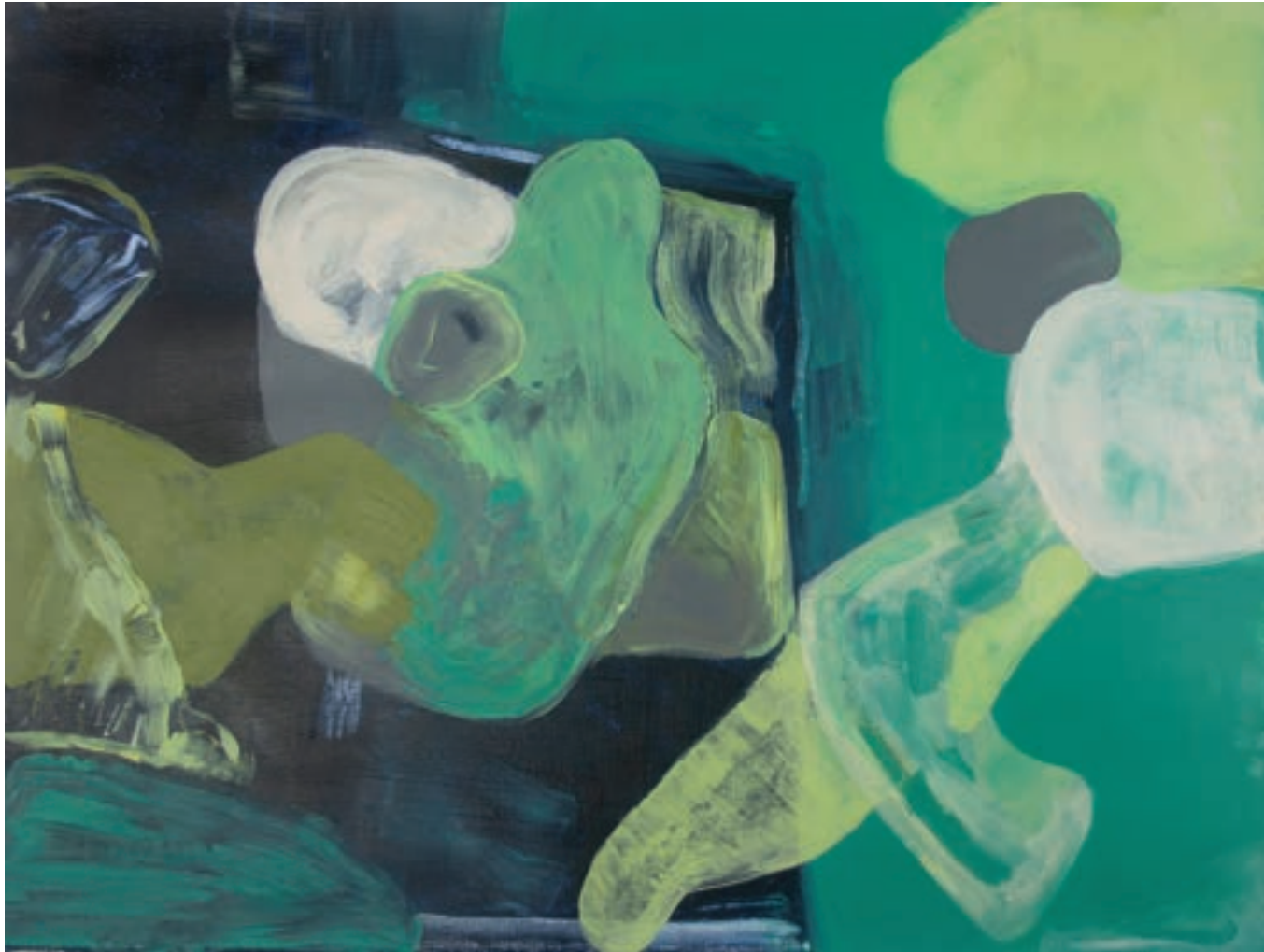
Dream Abstraction #62 , Acrylic on Arches cold press watercolor paper, 22x30 in, 2023