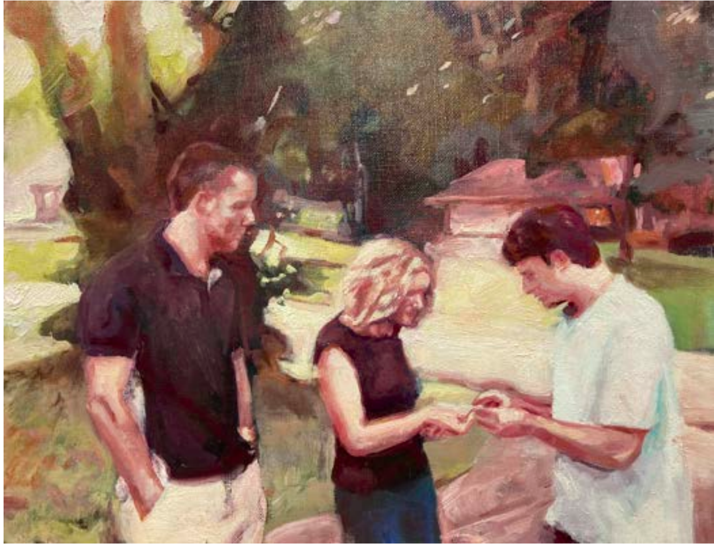
Embarkation # 4 , Oil on Linen, 11x14 in, 2008