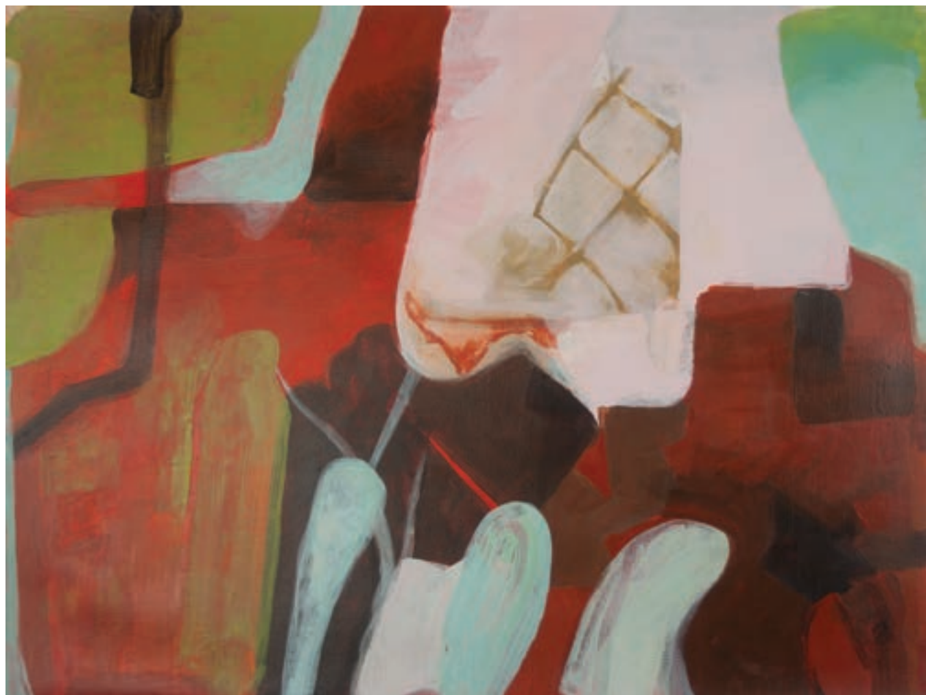
Dream Abstraction #48 , Acrylic on Arches cold press watercolor paper, 22x30 in, 2023