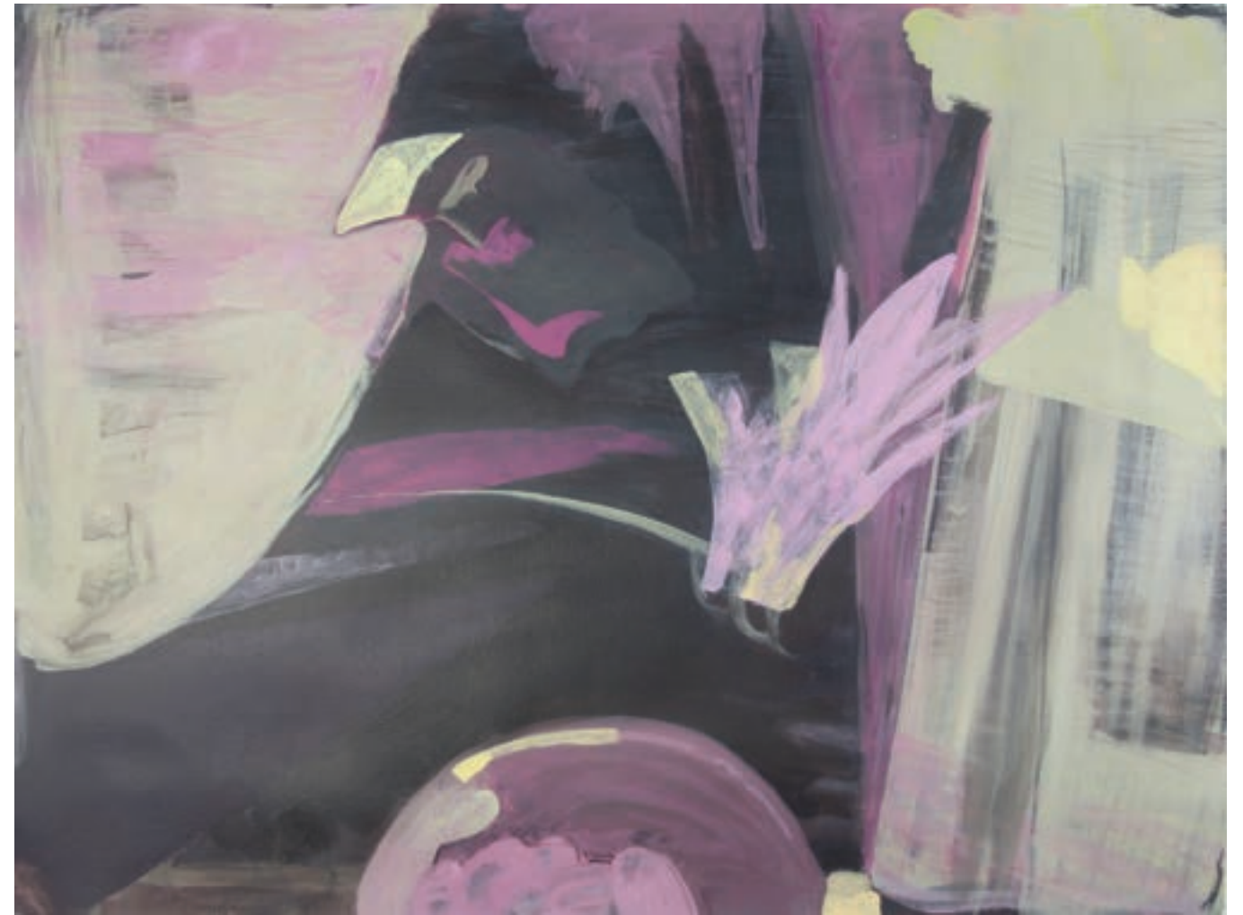
Dream Abstraction #3 , Acrylic on Arches cold press watercolor paper, 22x30 in, 2023