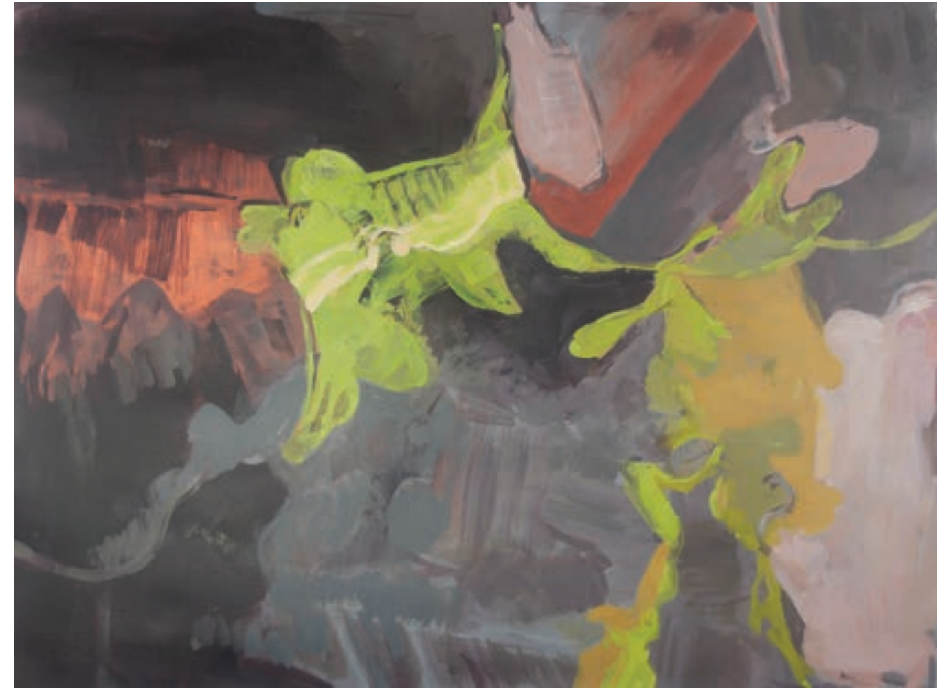
Dream Abstraction #14 , Acrylic on Arches cold press watercolor paper, 22x30 in, 2023