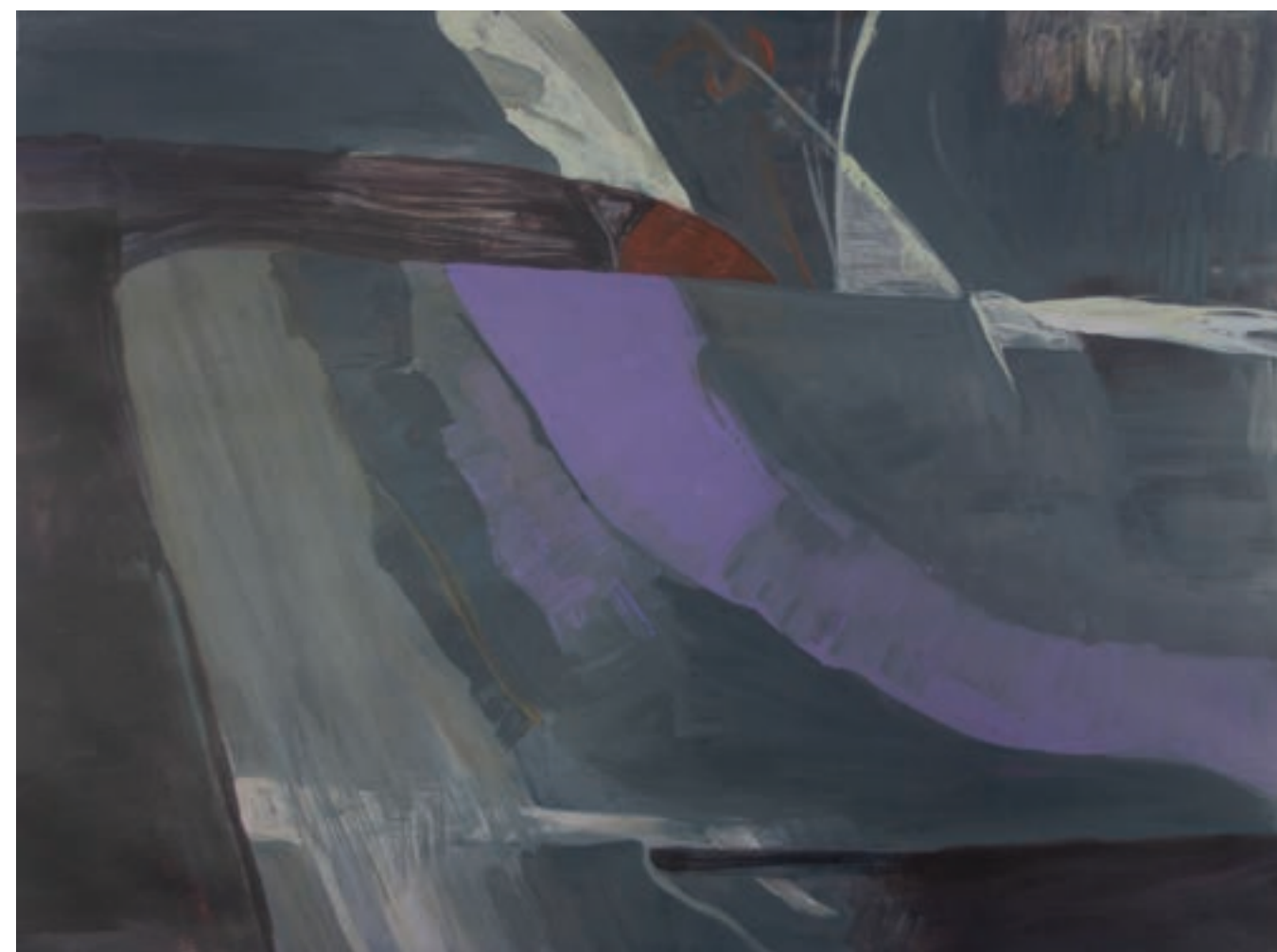
Dream Abstraction #40 , Acrylic on Arches cold press watercolor paper, 22x30 in, 2023