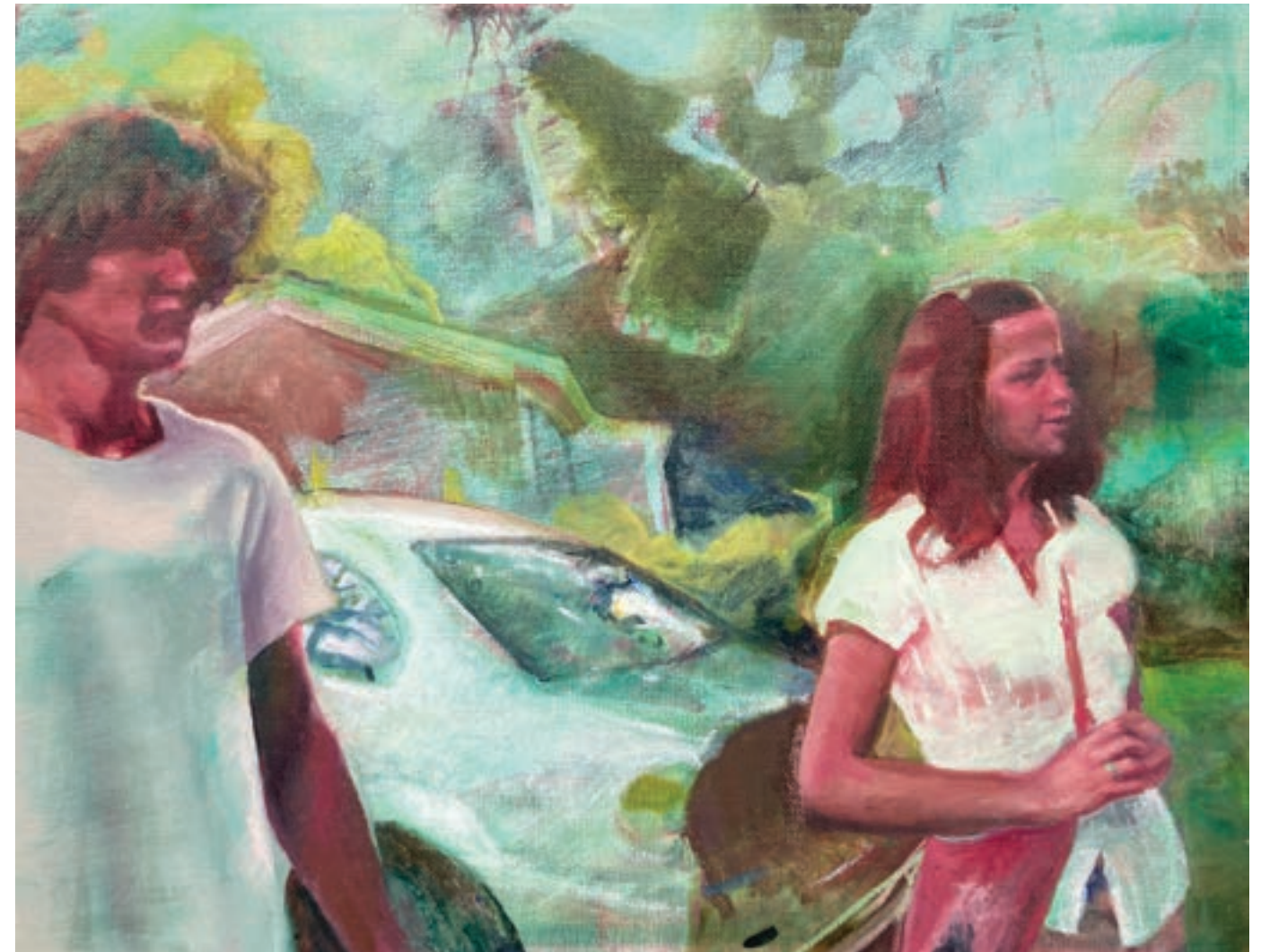
Embarkation # 3 , Oil on Linen, 11x14 in, 2008