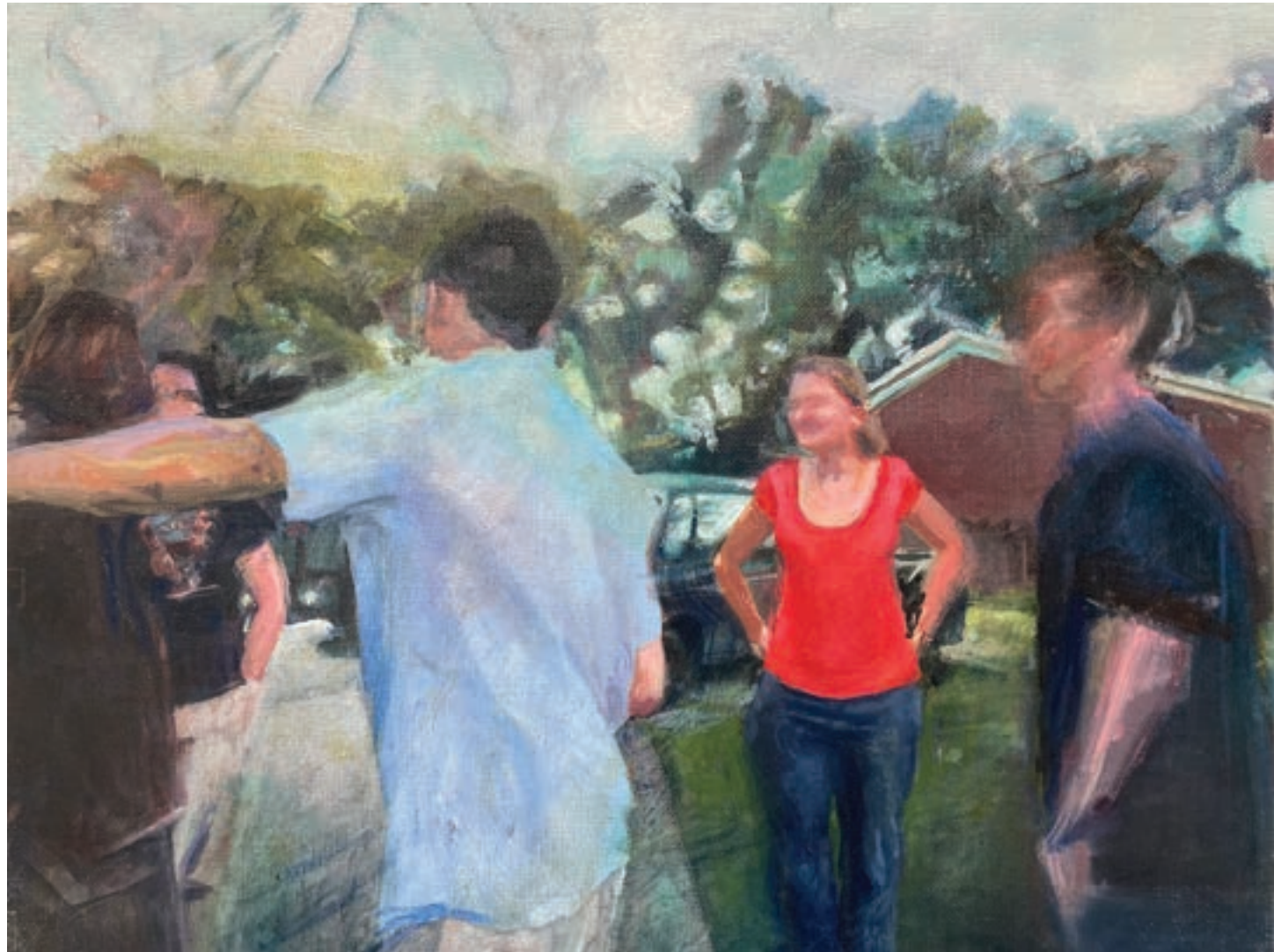
Embarkation # 2 , Oil on Linen, 11x14 in, 2008