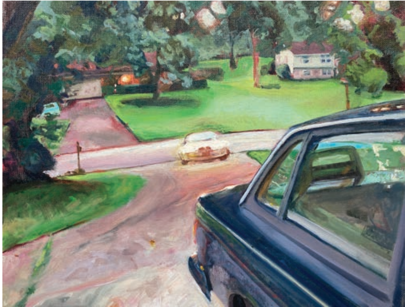
Embarkation # 6 , Oil on Linen, 11x14 in, 2008