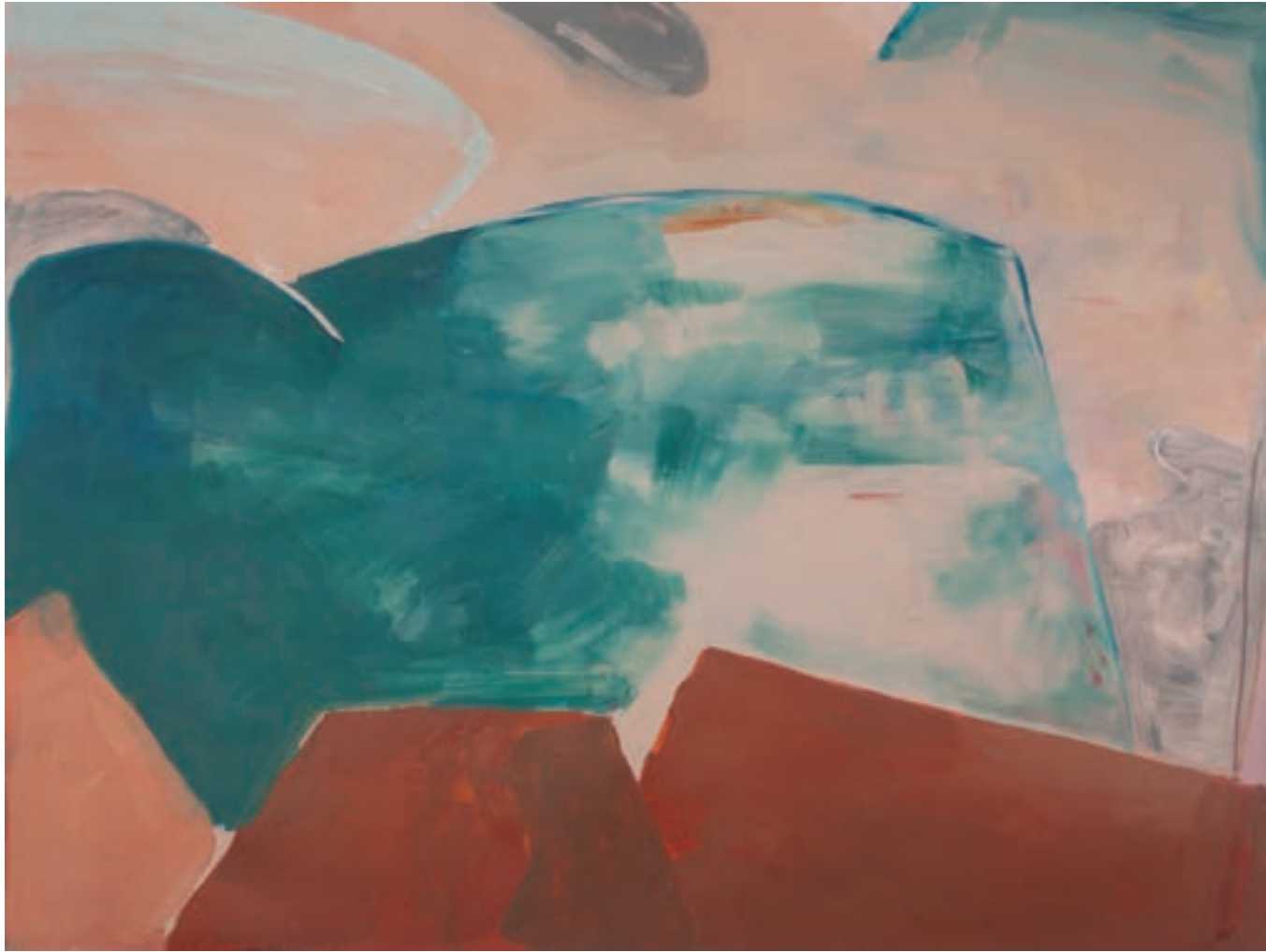
Dream Abstraction #27 , Acrylic on Arches cold press watercolor paper, 22x30 in, 2023