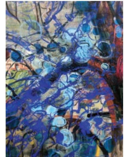
Through the Branches

She stopped work on the painting for several years until she arrived at a strategy for