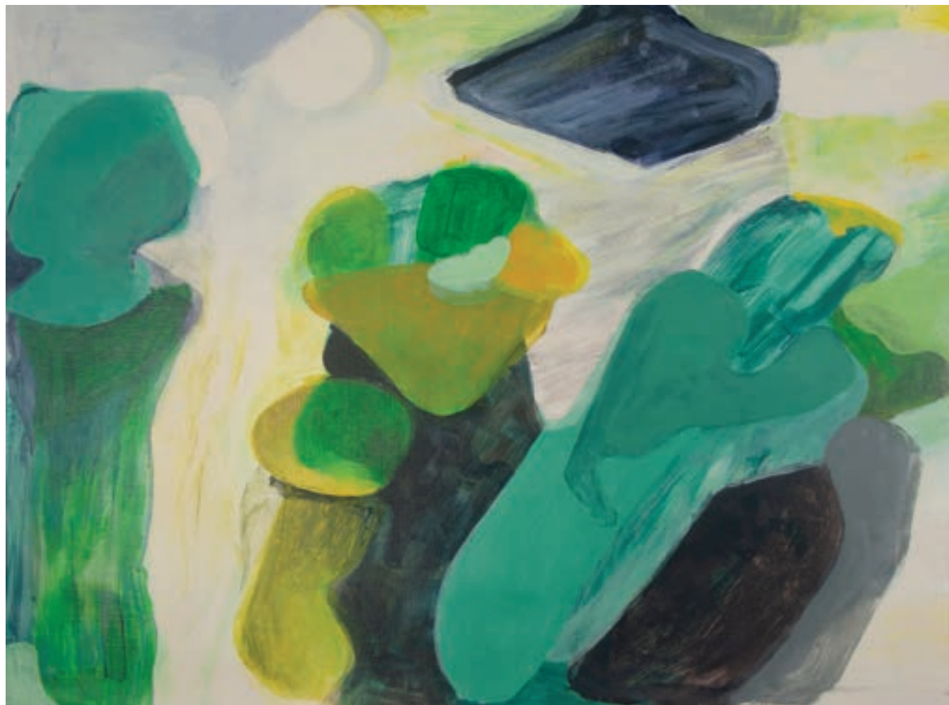
Dream Abstraction #6 , Acrylic on Arches cold press watercolor paper, 22x30 in, 2023