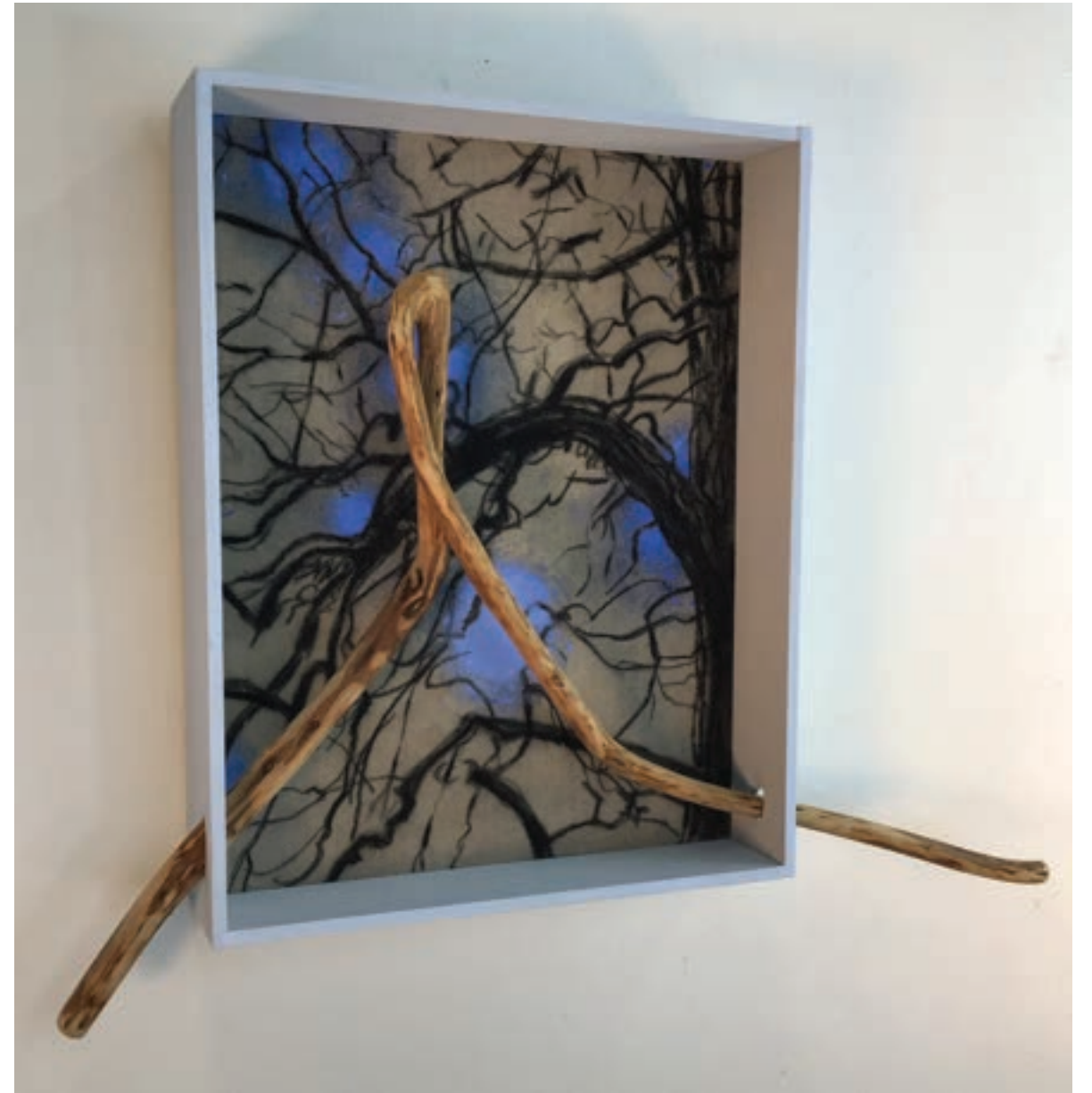
Positioning the Divine , Mixed-media/charcoal and acrylic on linen on panel, balsa wood, juniper root, 17x22x4 in, 2023