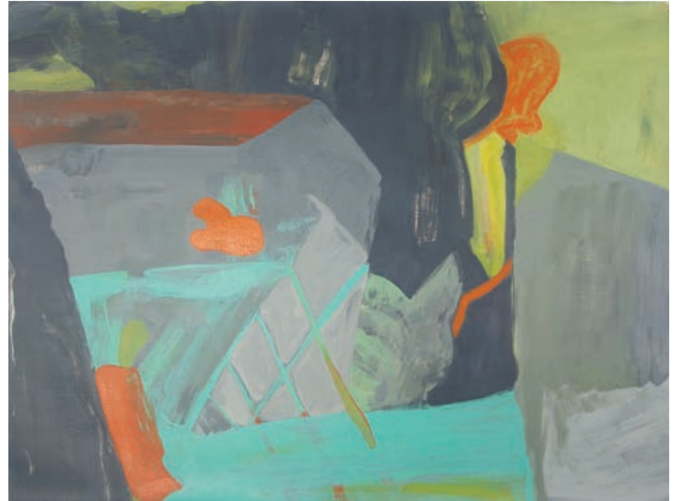
Dream Abstraction #47 , Acrylic on Arches cold press watercolor paper, 22x30 in, 2023