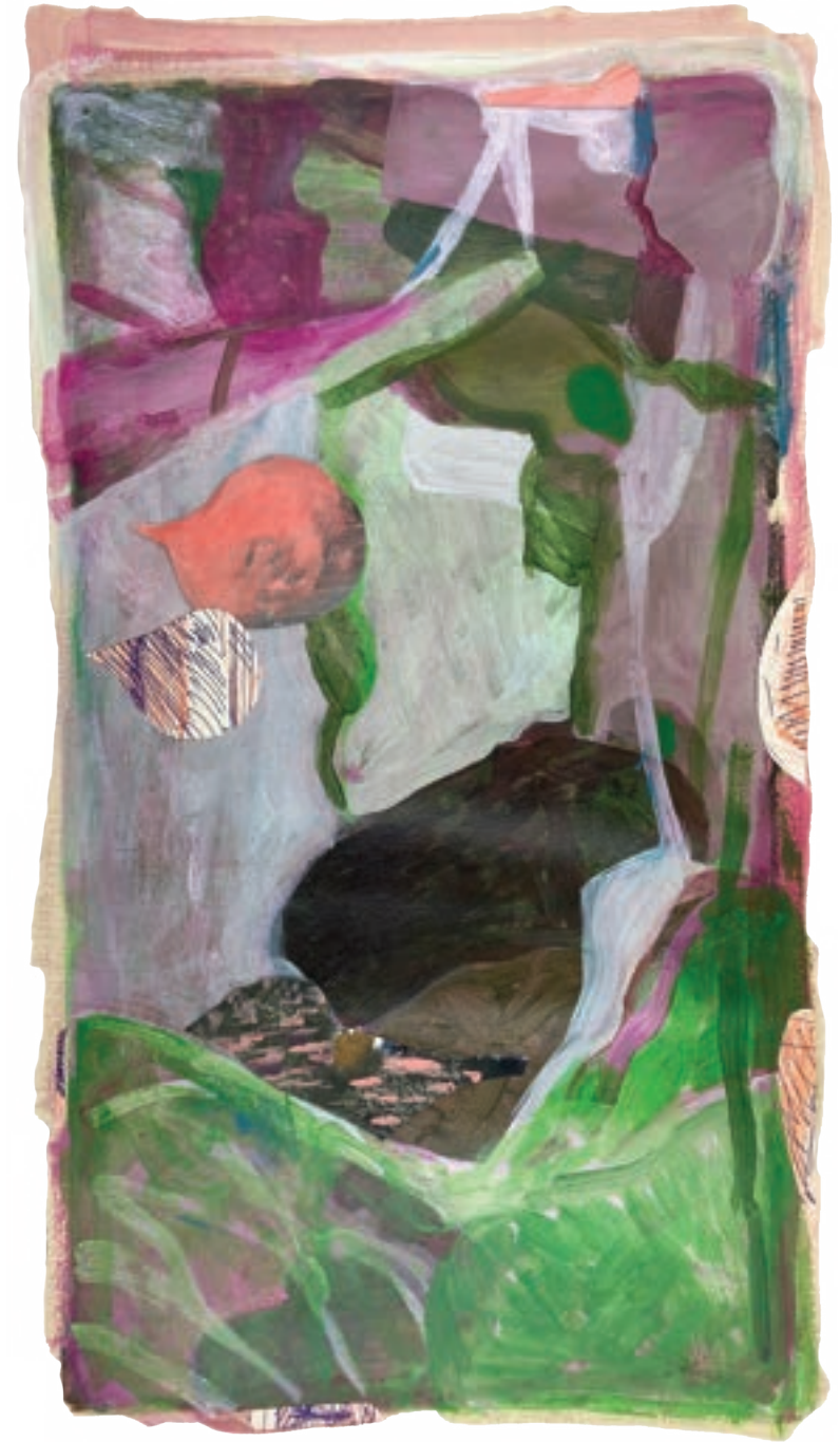
When daughters are away , Acrylic, inkjet print, paper collage, ballpoint pen, and chalk on printmaking paper, 18.25x10.25 in, 2024