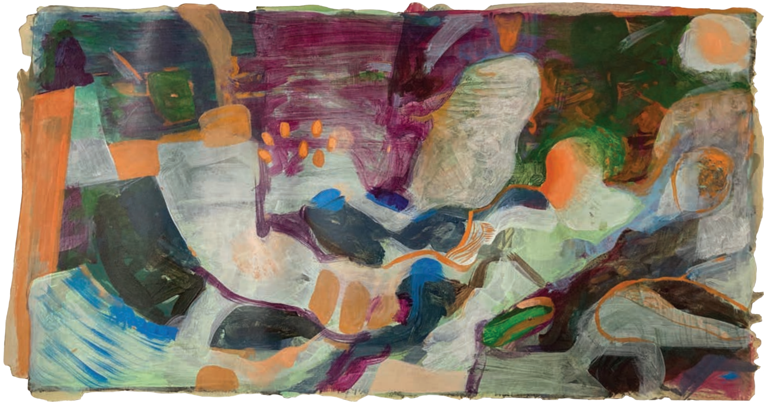
Something about leaving , Acrylic on printmaking paper, 9.5 x 17.75 in, 2024