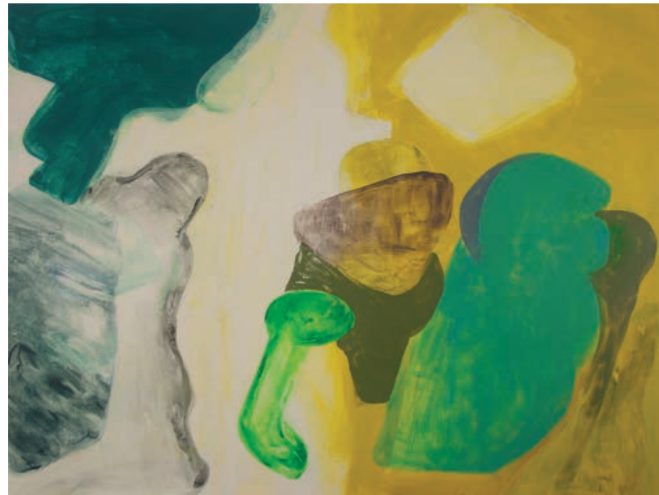
Dream Abstraction #59 , Acrylic on Arches cold press watercolor paper, 22x30 in, 2023