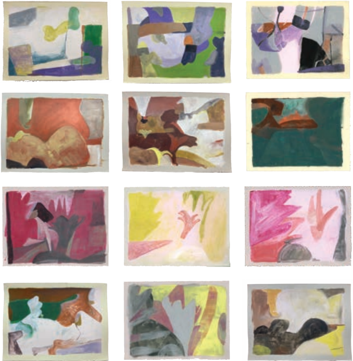
Abstract Variations , Acrylic on Stonehenge paper, 11x15 in, 2013.