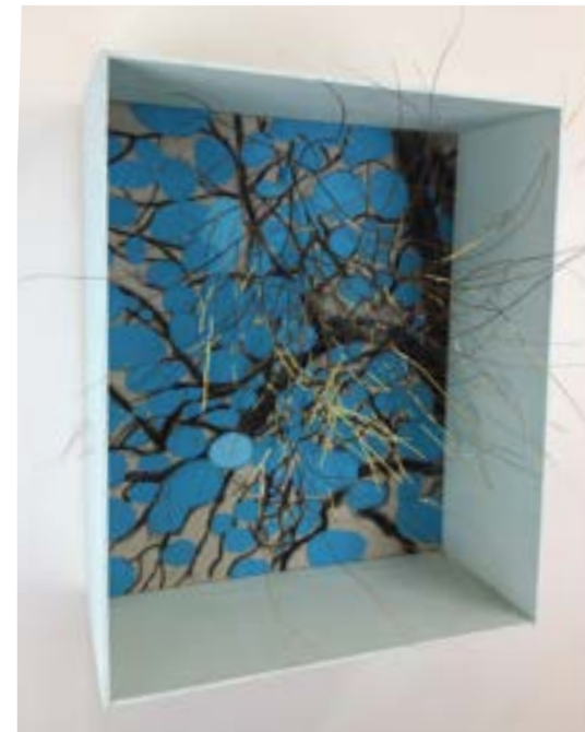
The Sky at the Wrong Side of the Branches