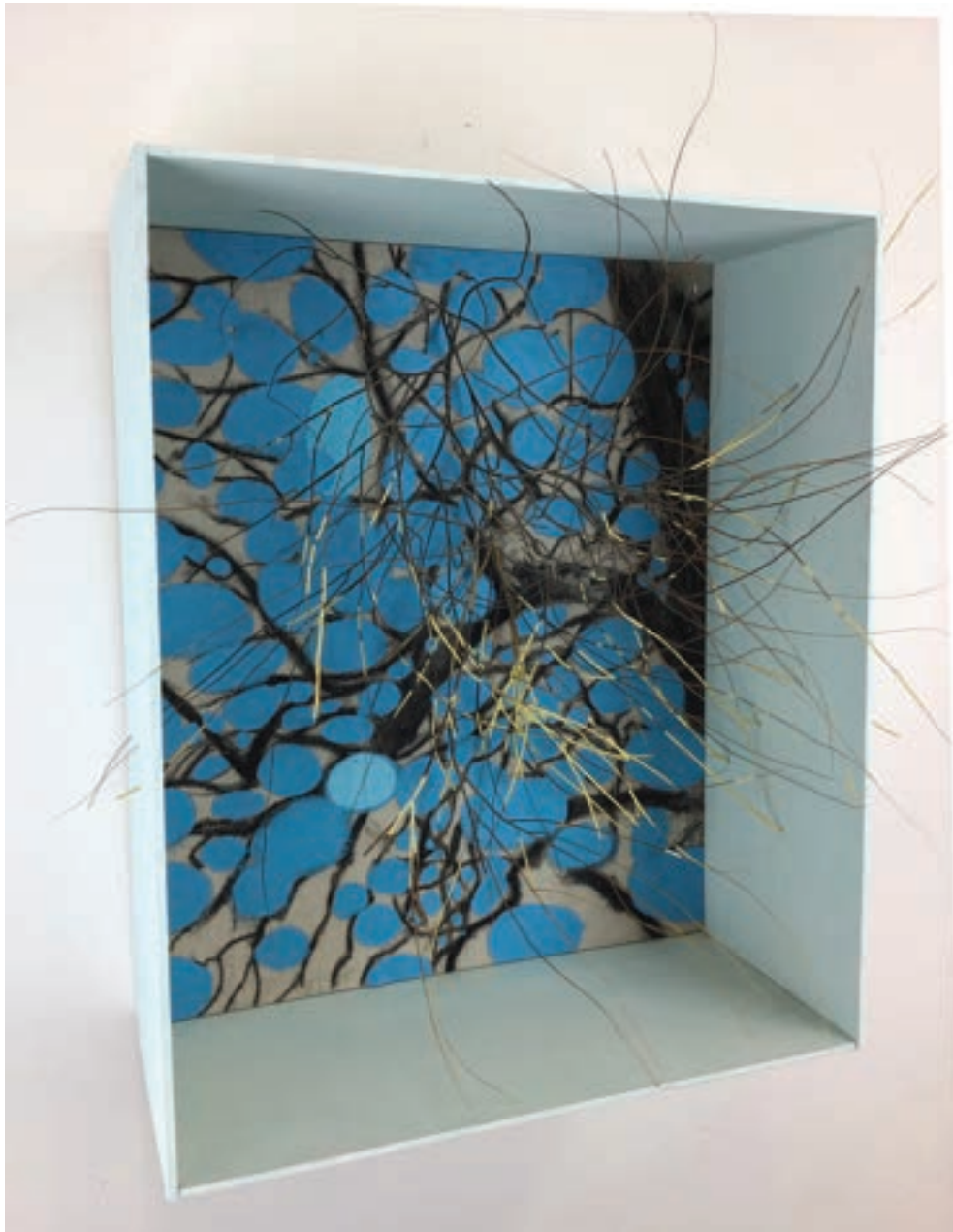
46 The sky is at the wrong side of the branches , Mixed-media/charcoal and acrylic on linen on panel, balsa wood, branch specimen, 17x22x4 in, 2023