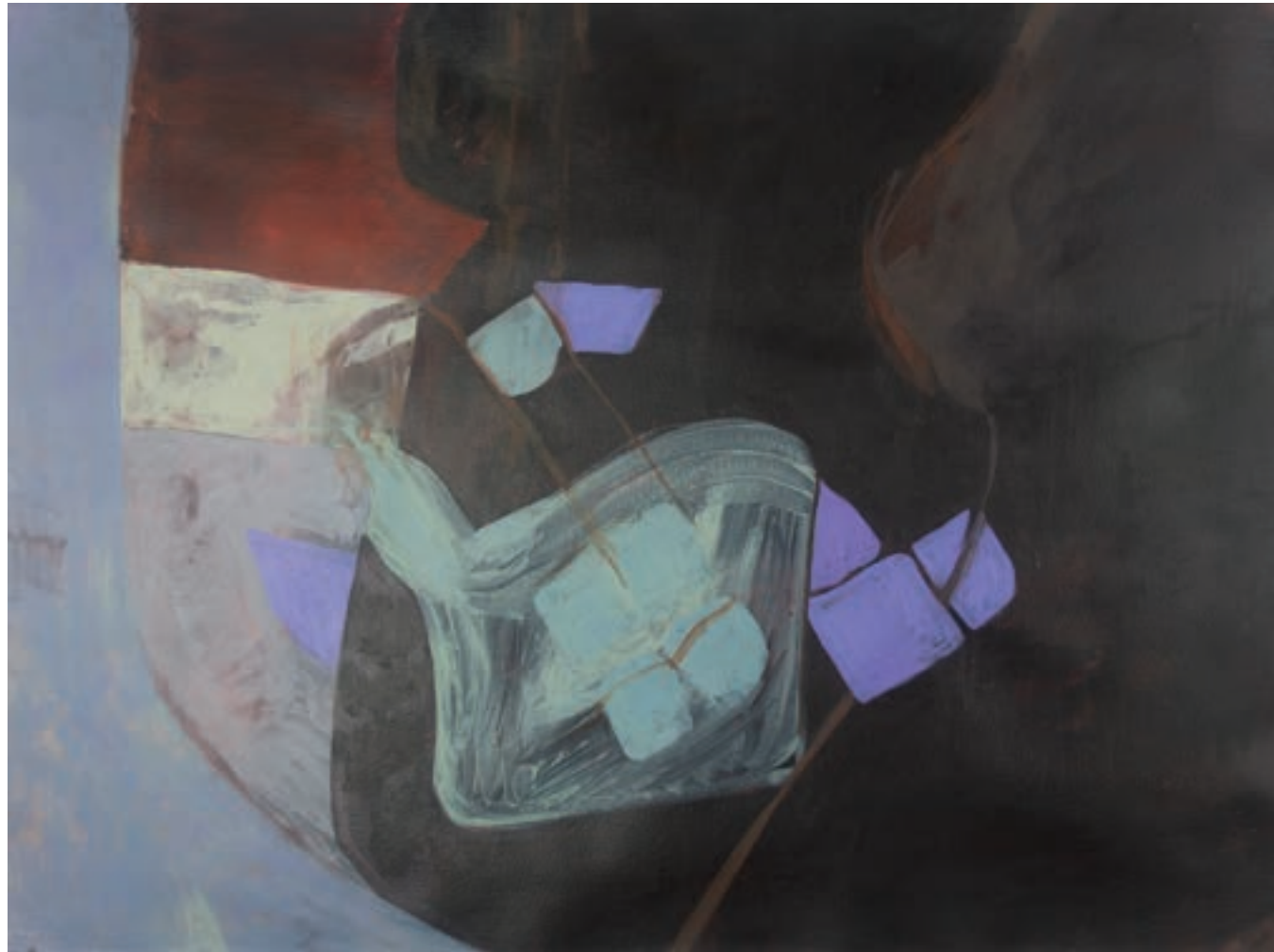
Dream Abstraction #64 , Acrylic on Arches cold press watercolor paper, 22x30 in, 2023