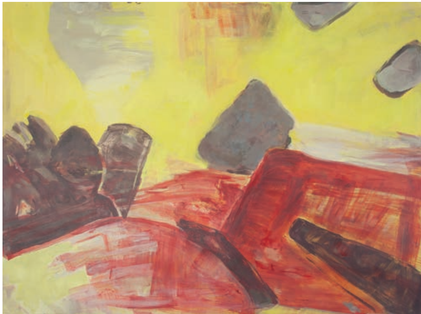
Dream Abstraction #11 , Acrylic on Arches cold press watercolor paper, 22x30 in, 2023