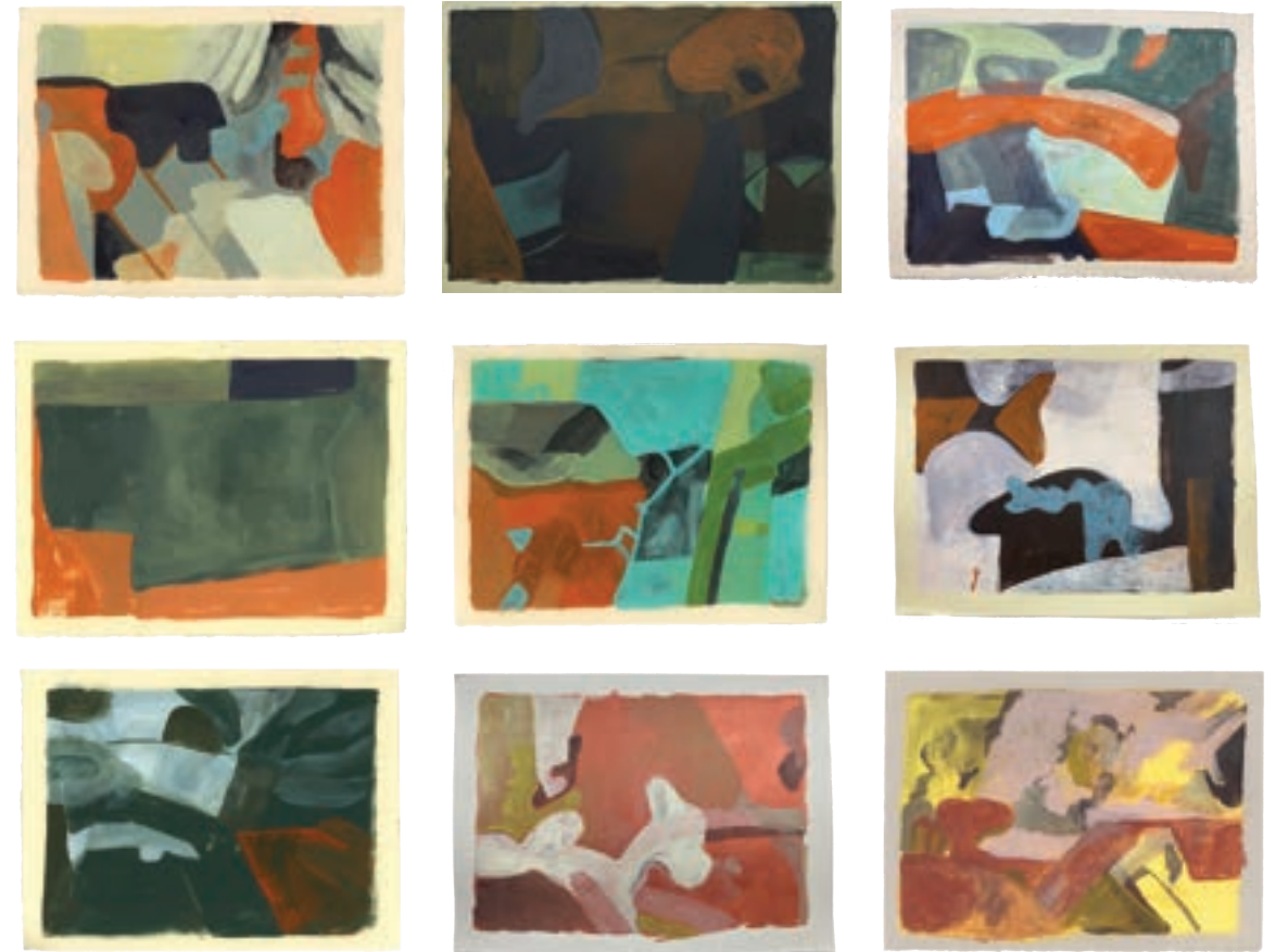
Abstract Variations , Acrylic on Stonehenge paper, 11x15 in, 2013.