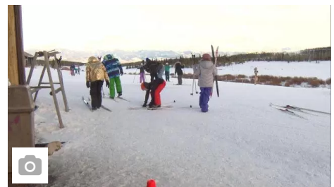
Snow Mountain Ranch