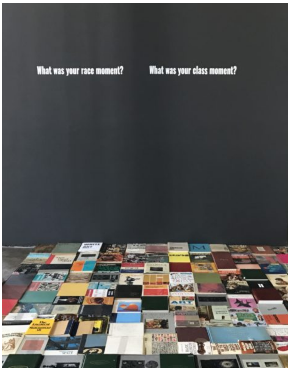
Unfinished Business: “What You Think Matters Too” Part III by jc lenochan.

Beneath the flags on the right side of the gallery among a number of other pieces lay a series of representational works, by artist Carina D. Maye, that feature the guise of classic classroom settings but after close consideration the insidious nature of standardized testing and literacy testing are revealed. Whether through slight or total disruption of the scene, Maye makes a point to show the fault in our education system.