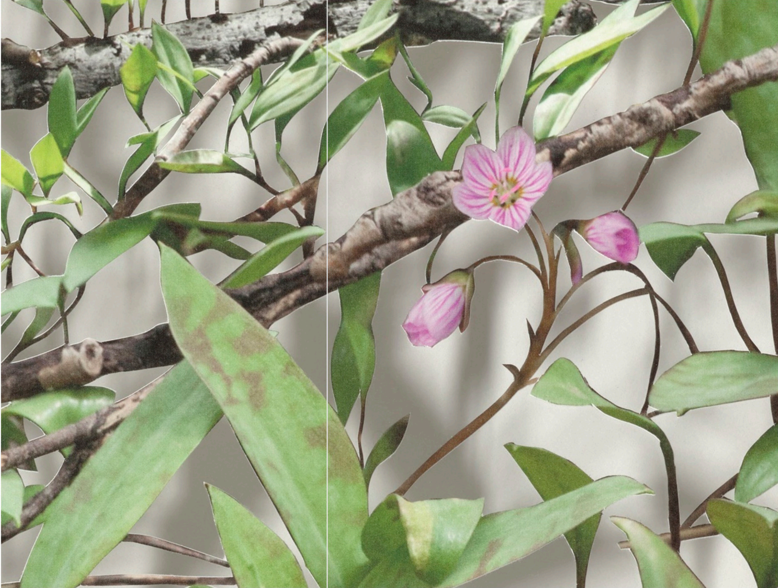
Detail of 'April' from the series 12 Seasons