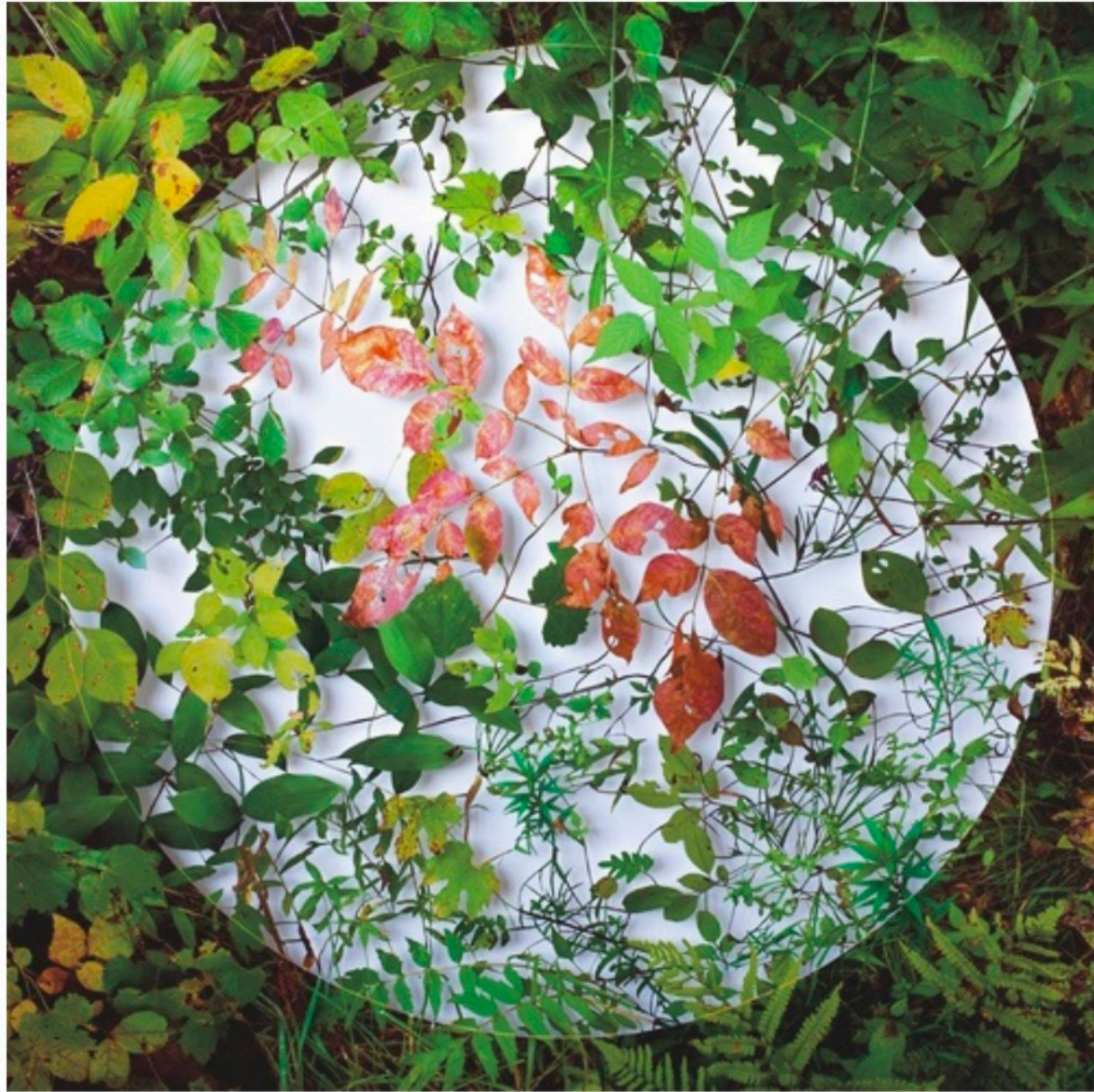
September Forest Floor from the series Woodlands Hand Cut Photographic Print 16x16" 2024