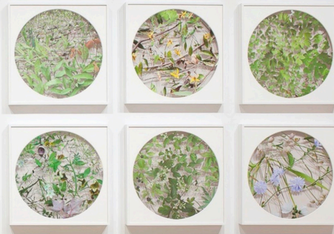
Installation View Of 12 Seasons - Tom Thomson Art Gallery 2022 - 12 x 22"x22" Hand Cut Photographic Prints