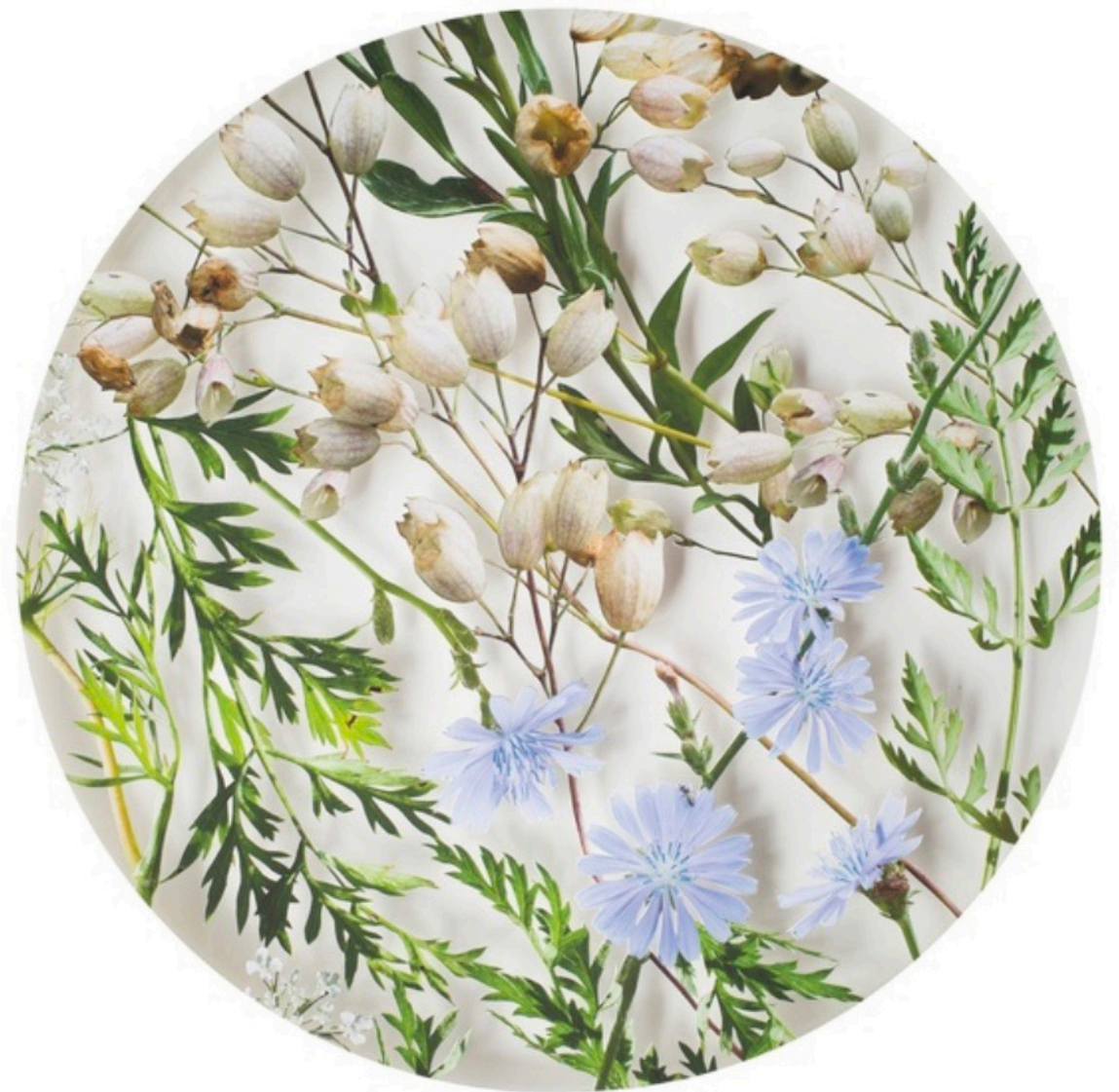
Chicory from the series Woodlands Hand Cut Photographic Print 16x16" 2023

These composition are made into large scale prints which I then physically cut out, separating negative space from positive space. This process reveals a cut paper study of the interconnected forms of the forest, emphasizing the cyclical nature of the seasonal forces of growth and decay. Creating these works is a meditation on the intricacies and majesty of the wild landscape.