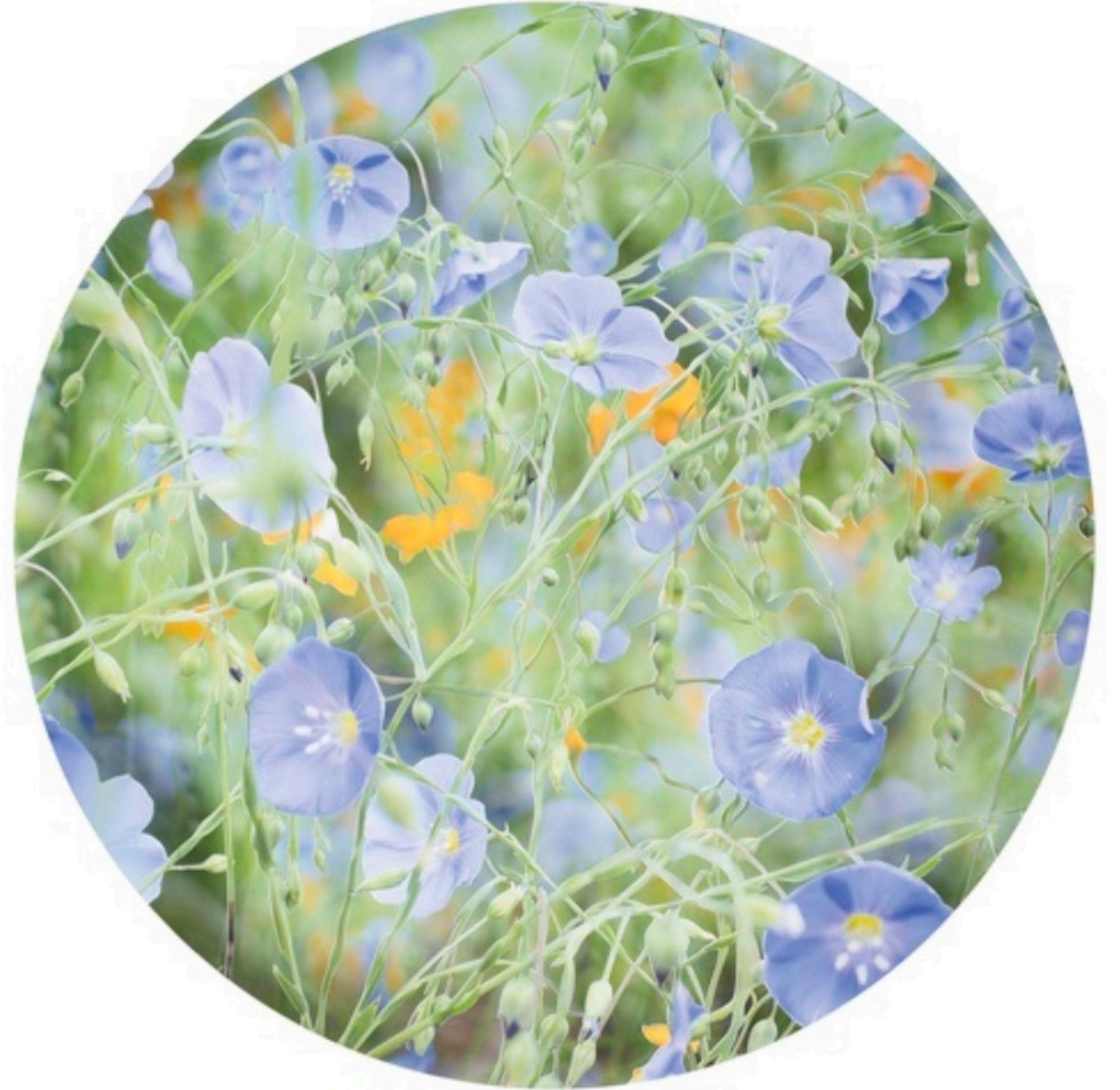
Flax from the series Woodlands Hand Cut Photographic Print 16x16" 2024