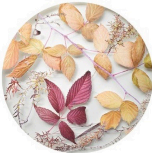
Various 16" works from the series Woodlands Hand Cut Photographic Prints 2023