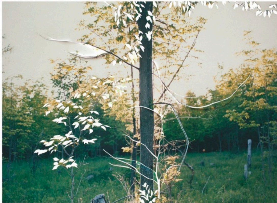
Lone Elm from the series The Woods Hand Cut Photographic Print 13x18" 2016