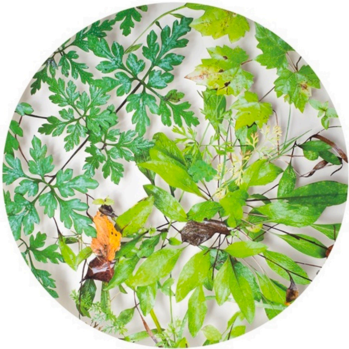
Devilsbit from the series Woodlands Hand Cut Photographic Print 16x16" 2023