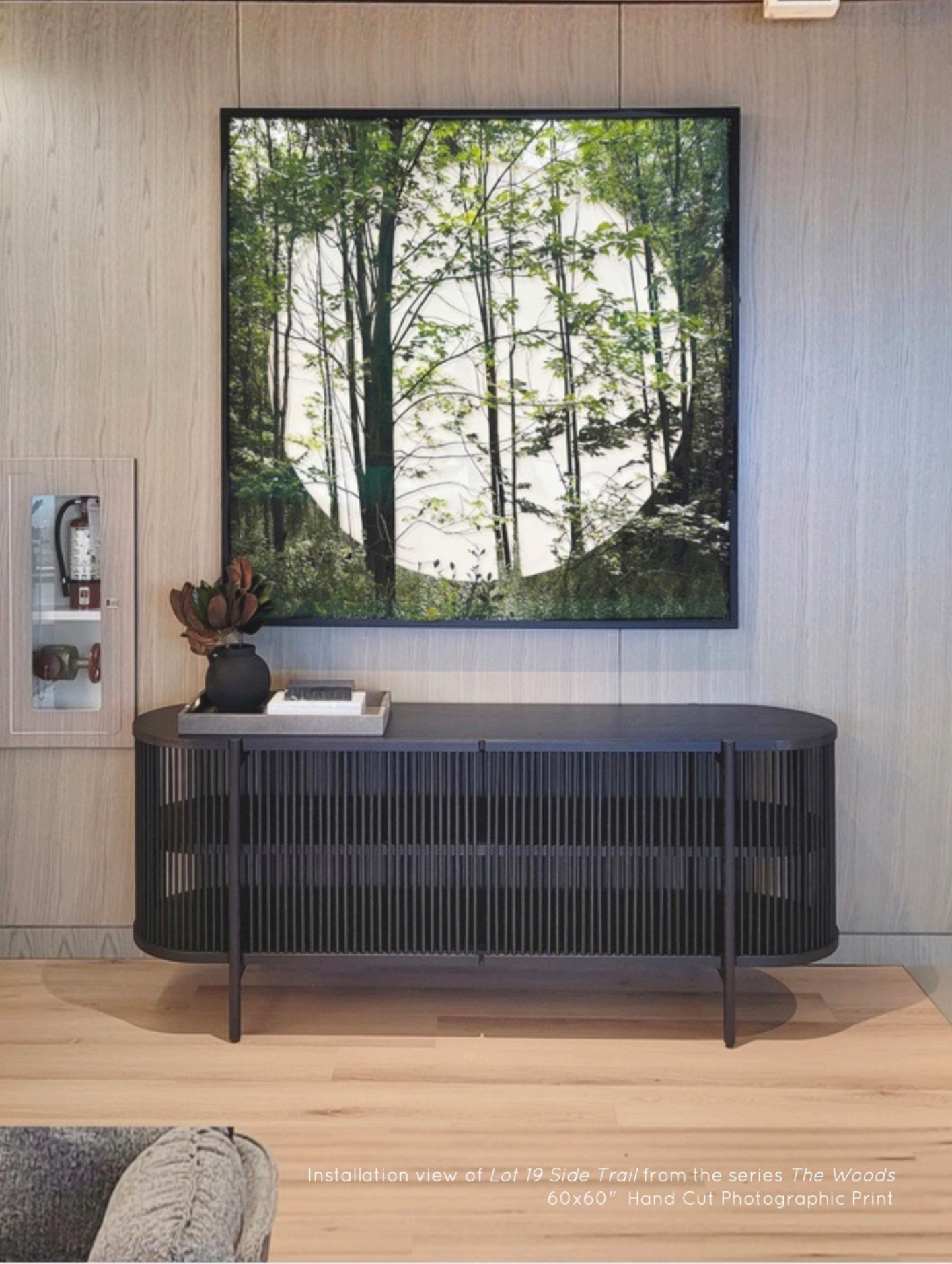
Installation view of Lot 19 Side Trail from the series The Woods 60x60" Hand Cut Photographic Print