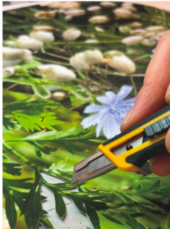
Above: in the studio Right Page: detail of February from the series 12 Seasons