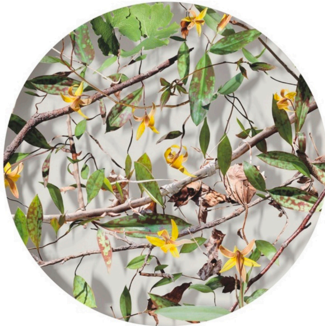
Trout Lily from the series Woodlands Hand Cut Photographic Print 22x22" 2020