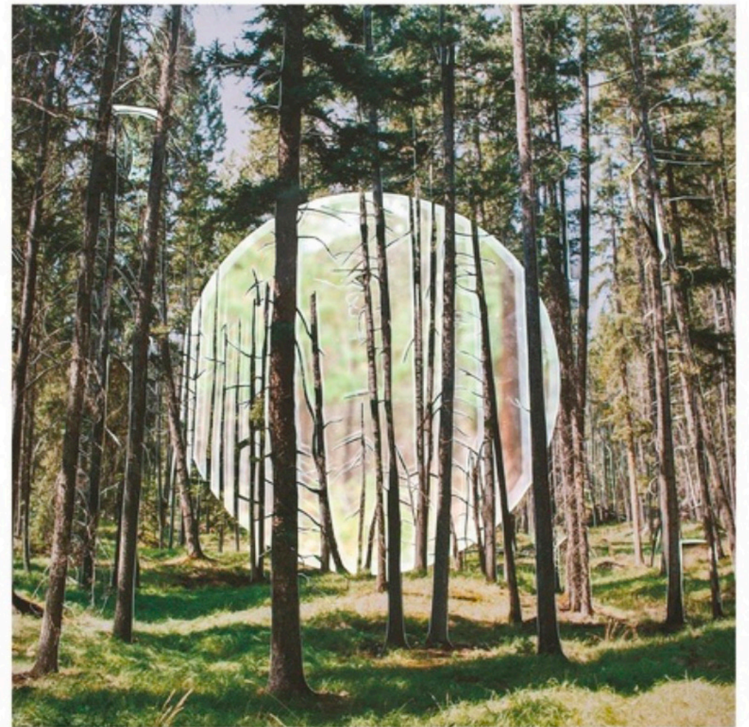
Forest Orb from the series The Woods Hand Cut Photographic Print 27x27" 2016