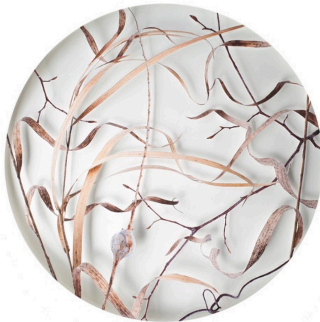
December from the series 12 Seasons Hand Cut Photographic Print 22x22" 2021