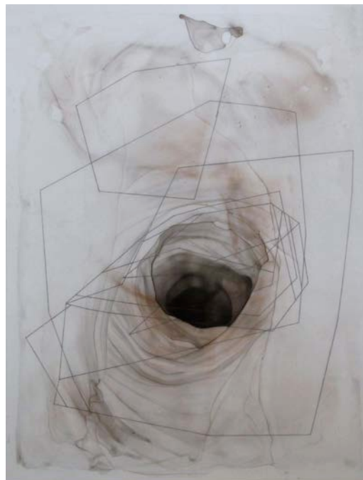
Jan Razauskas, still waiting , Pigments, metallics and graphite on Dura-lar, 30 x 40 inches

Exhibitions are always free and open to the public.