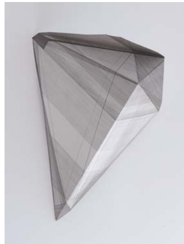
Renee van der Stelt, Score & Fold: Irregular 10/25/2012 , Graphite on paper, 25 x 17 x 12.5" (above)