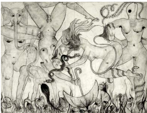
Amita Bhatt, A Fantastic Collision of The Three Worlds # II , 2009, Charcoal on canvas, 9 x 12 feet (left)