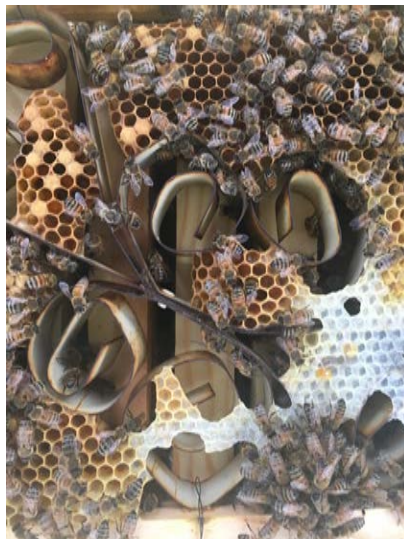
(left) Elsabé Dixon, Mise en Place (Bread Wall) , 2018, bread, honey, beeswax, 8 x 8 x 2 feet