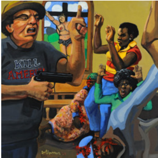
Joe Shannon, White Only – Kill America! , 2017, acrylic on masonite, 24 x 24 inches

For curator Judy A. Greenberg, Frank Hallam Day's photographs of the hulls of wrecked ships provoked a spiritual and contemplative reaction. Repetition and framing create perceptual shifts for the viewer between reality and abstraction, color field painting and documentary photography, life and death. "Day transforms the wreck headed for extinction into another space unto itself," states Greenberg.