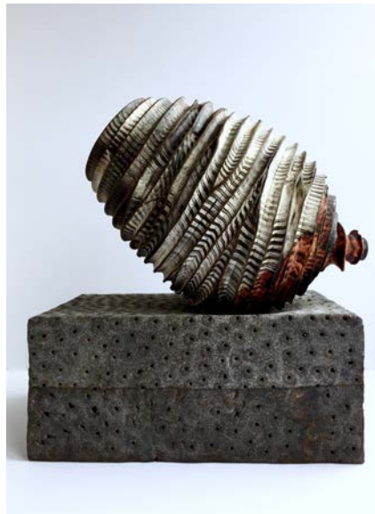
(left) Evan Reed, Honey Pot , 2015, Wood: reclaimed architectural molding and found branches, 37 H x 15 W x 42 D inches