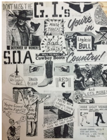
D.C. Flyer, 1981, from the archive of Dischord Records