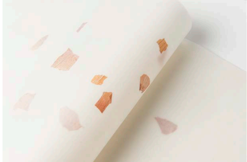
(left) Guy Miller , Giant Tarnation Can , 2017, found material, custom labeling, 32 H x 70 circumference inches (right) Ashley Culver , one in search of one , 2017, peels, paper, and thread, 12 x 12 inches (detail) Variable Edition of 4