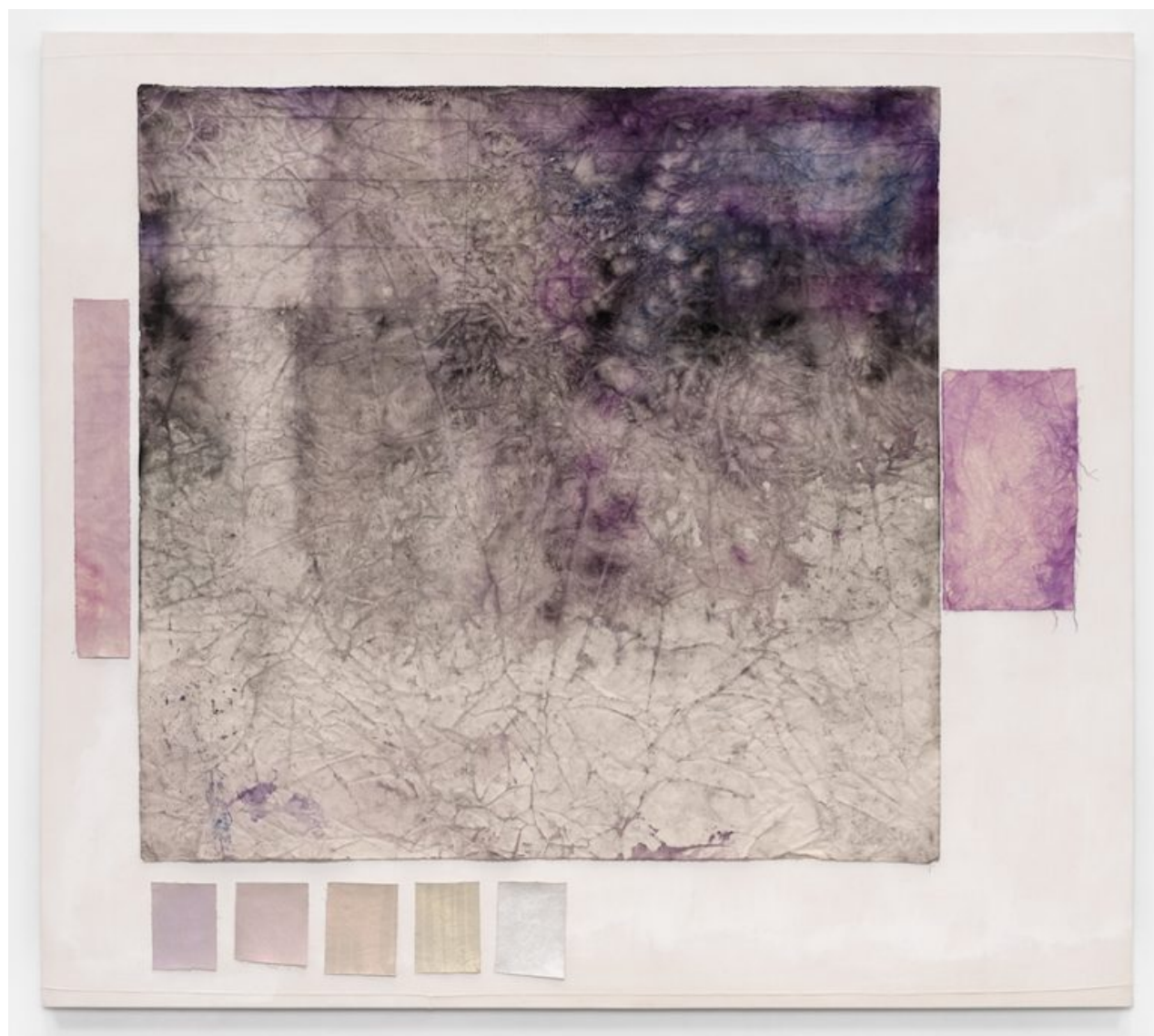
Sky Cathedral, Sally Ride, Metis and Déjà Vu, 2019, acrylic on canvas, stitched to constructed canvas, 86 x 96 inches.

Editor's note: This interview, condensed for length, was taken from a virtual exhibition walkthrough at Traywick Contemporary on April 2, 2020.