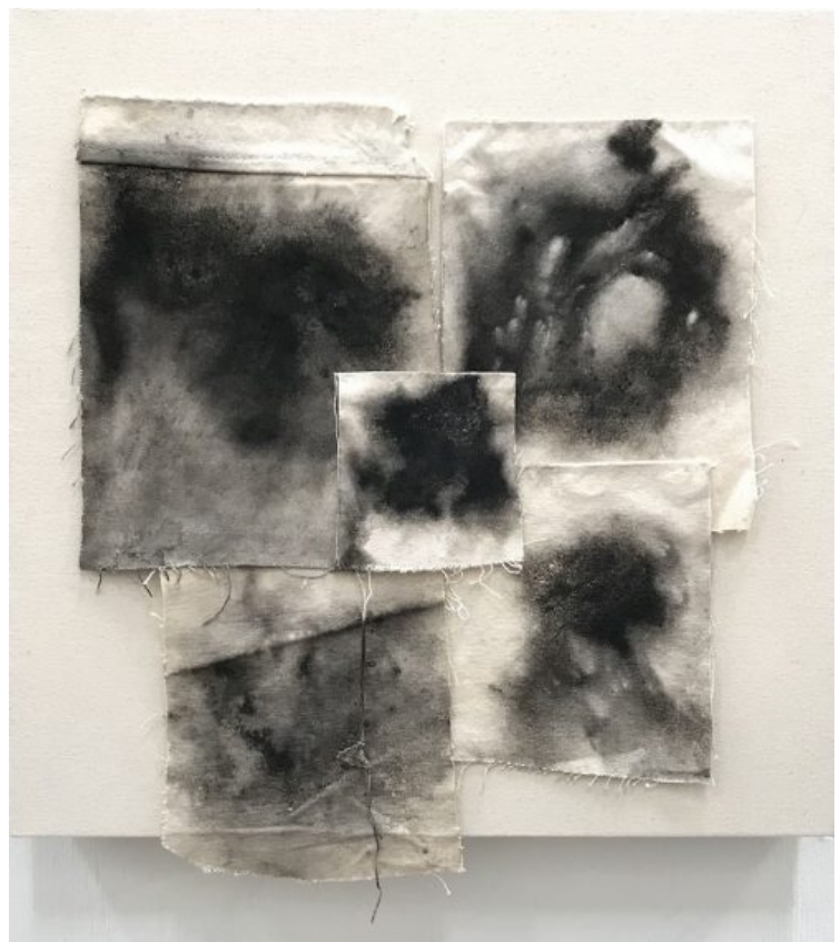
Persephone, 2020, acrylic and thread on canvas, 18.25 x 18.25 inches

SH: I was struck with this body of work as it reads much more as painting when you first see it, but once you get up to the surface you really see the structure of how it's made, the materiality with [sewn] collage and three-dimensional elements.