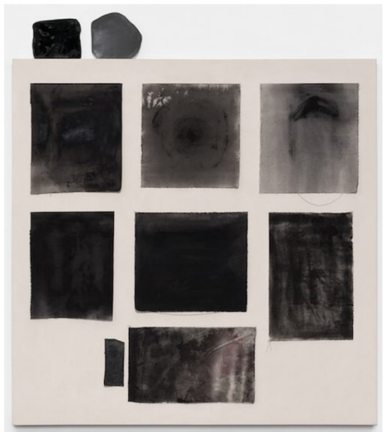
Eco Fem Zen Proto Punk Hippy, 2019, acrylic on canvas panels, stitched to canvas with ceramic objects, 68.5 x 60.25 inches

SH: Your work as a whole is complicated. There are lots of layers of material and meaning that are embedded.