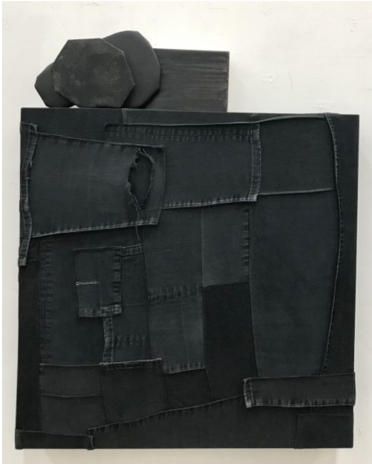
Uh Huh Her, 2020, denim, leather, canvas water color on wood, 31.5 x 25"

With this work, I'm really allowing materials to reveal themselves and for the construction to be its own thing – an accumulation or layering of experience and experimentation. I'm literally constructing the planes