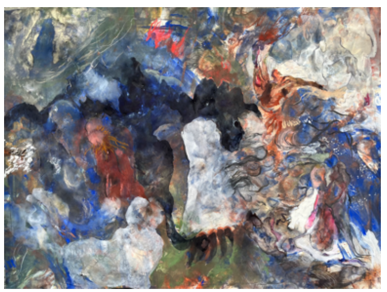
Fragrance of the Afterlife (#3 of 19), 2023 natural pigment, charcoal, graphite, and pastel on paper 21 \% \times 28 \% inches / 28 \times 35 \% inches (framed) $2600