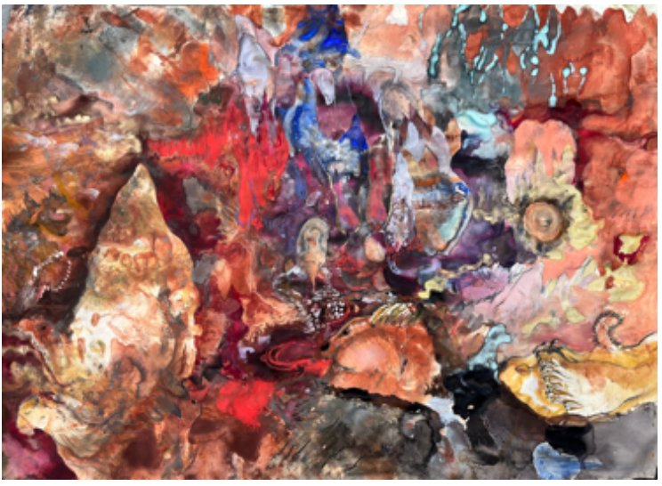
Cave (#11 of 19), 2023 natural pigment, charcoal, graphite, and pastel on paper 19 x 26 ½ inches / 26 ½ x 33 ½ inches (framed) $2600 (Sold)