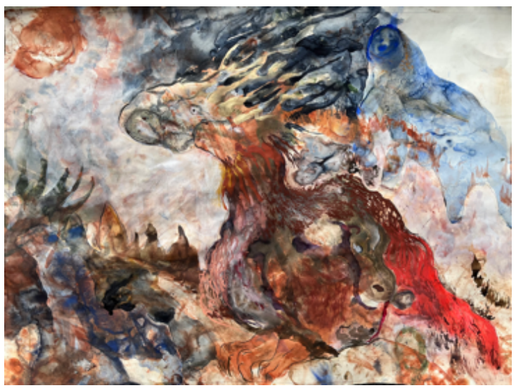
Dragon (#4 of 19), 2023 natural pigment, charcoal, graphite, and pastel on paper 21 x 29 inches / 28 ¼ x 35 ¾ inches (framed) $2600