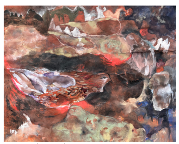
Bird Land (#2 of 19), 2023 natural pigment, charcoal, graphite, and pastel on paper 17 x 21 inches / 22 ¼ x 26 ½ inches (framed) $2100