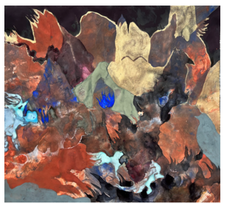
Blue Fire (#12 of 19), 2023 natural pigment, charcoal, graphite, and pastel on paper 15 ½ x 17 inches / 21 ½ x 23 inches (framed) $1800