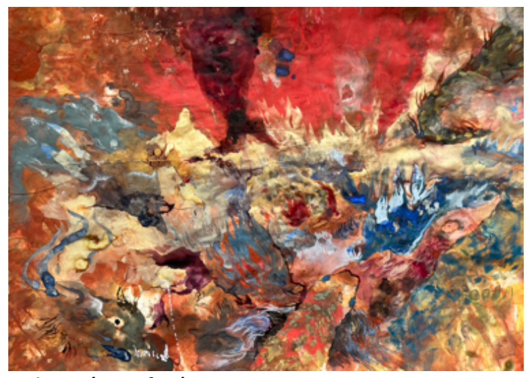
Volcano (#15 of 19), 2023 natural pigment, charcoal, graphite, and pastel on paper 21 \times 30 \% inches / 28 \% \times 30 \% inches (framed) $3400 (Sold)