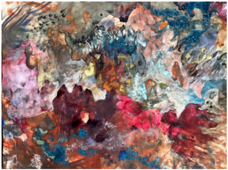
DragonLand (#10 of 19), 2023 natural pigment, charcoal, graphite, and pastel on paper 21 x 29 inches / 28 ¼ x 35 ¾ inches (framed) $3400