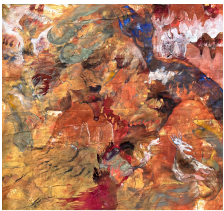
Map (#1 of 19), 2023 natural pigment, charcoal, graphite, and pastel on paper 20 x 26 inches / 30 x 31 5/8 inches (framed) $2600