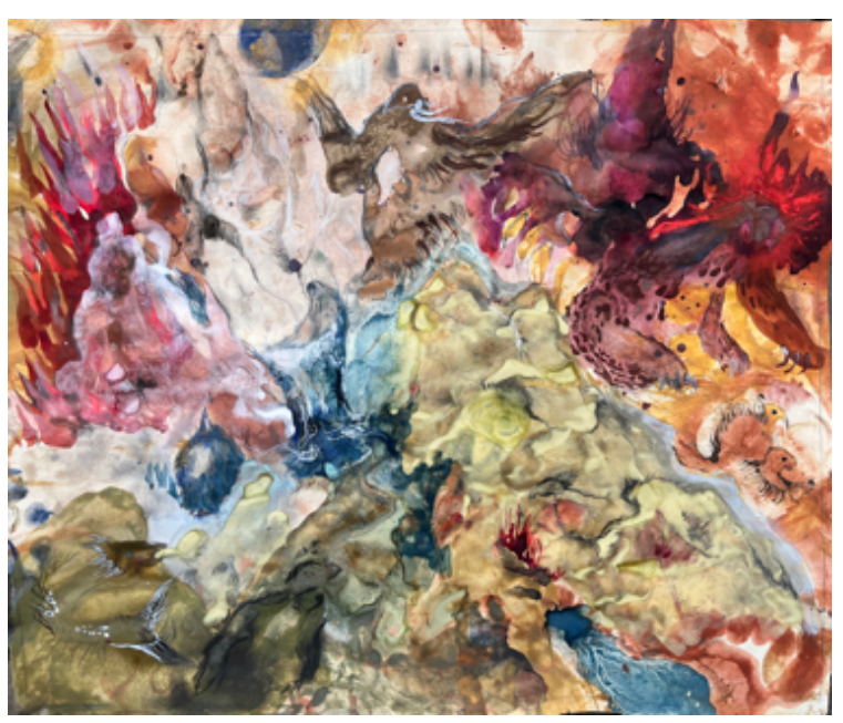
For the Bobcat (#7 of 19), 2023 natural pigment, charcoal, graphite, and pastel on paper 17 x 20 ½ inches / 24 x 27 ¼ inches (framed) $2400