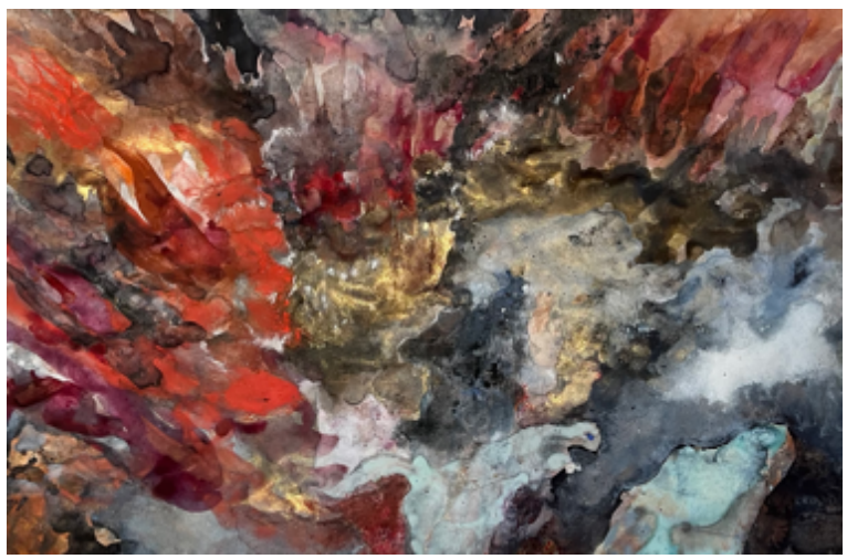
Cascade (#17 of 19), 2023 natural pigment, charcoal, graphite, and pastel on paper 13 x 19 ½ inches / 17 ½ x 24 ¼ inches (framed) $1800