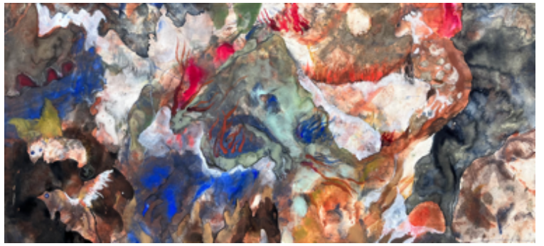
Green Dragon (#5 of 19), 2023 natural pigment, charcoal, graphite, and pastel on paper 10 ½ x 22 inches / 15 x 27 inches (framed) $1800