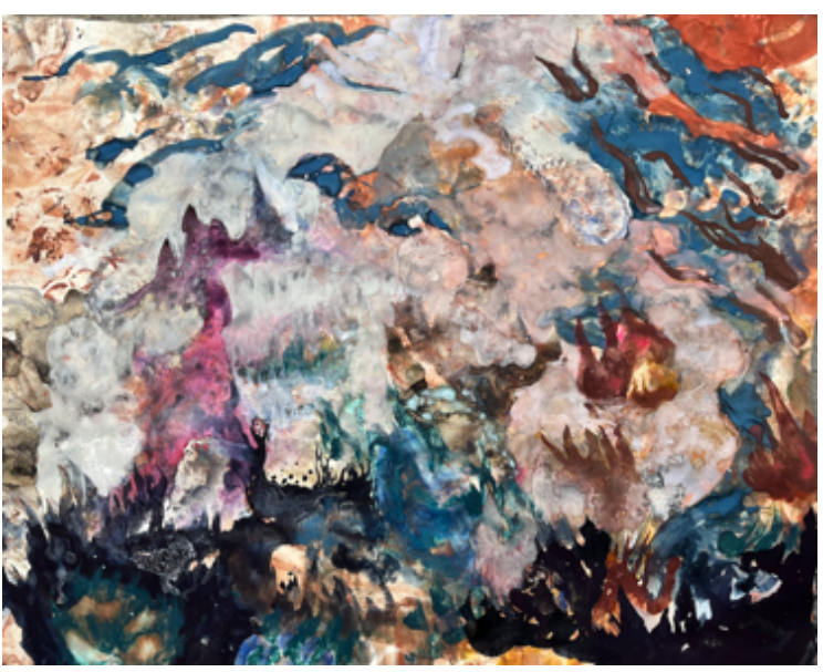
Mists (#13 of 19), 2023 natural pigment and graphite on paper 20 x 26 inches / 27 x 32 ½ inches (framed) $3200