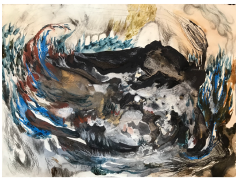
Sweep, 2022 natural pigment, watercolor, graphite, and wax pencil on paper 11 \times 15 inches / 15 \% \times 19 \% inches (framed) $1800