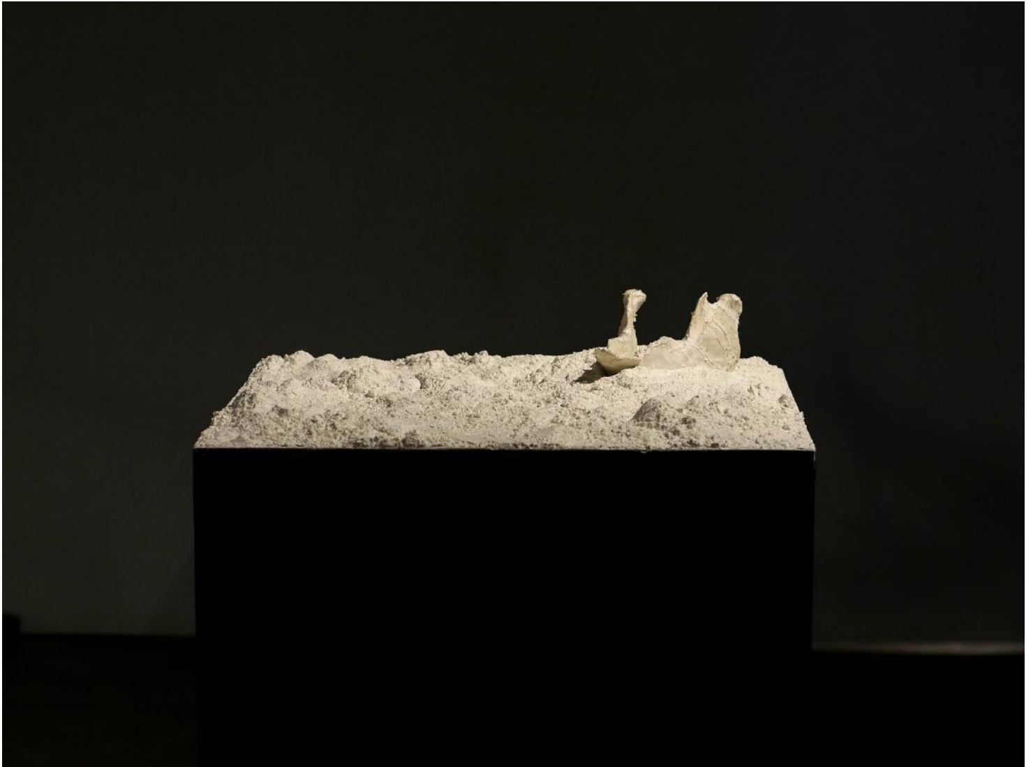
Unpeeled, I am not like a man Pig jaw from an abattoir, silk, bone ash used in the production of fine china 2019