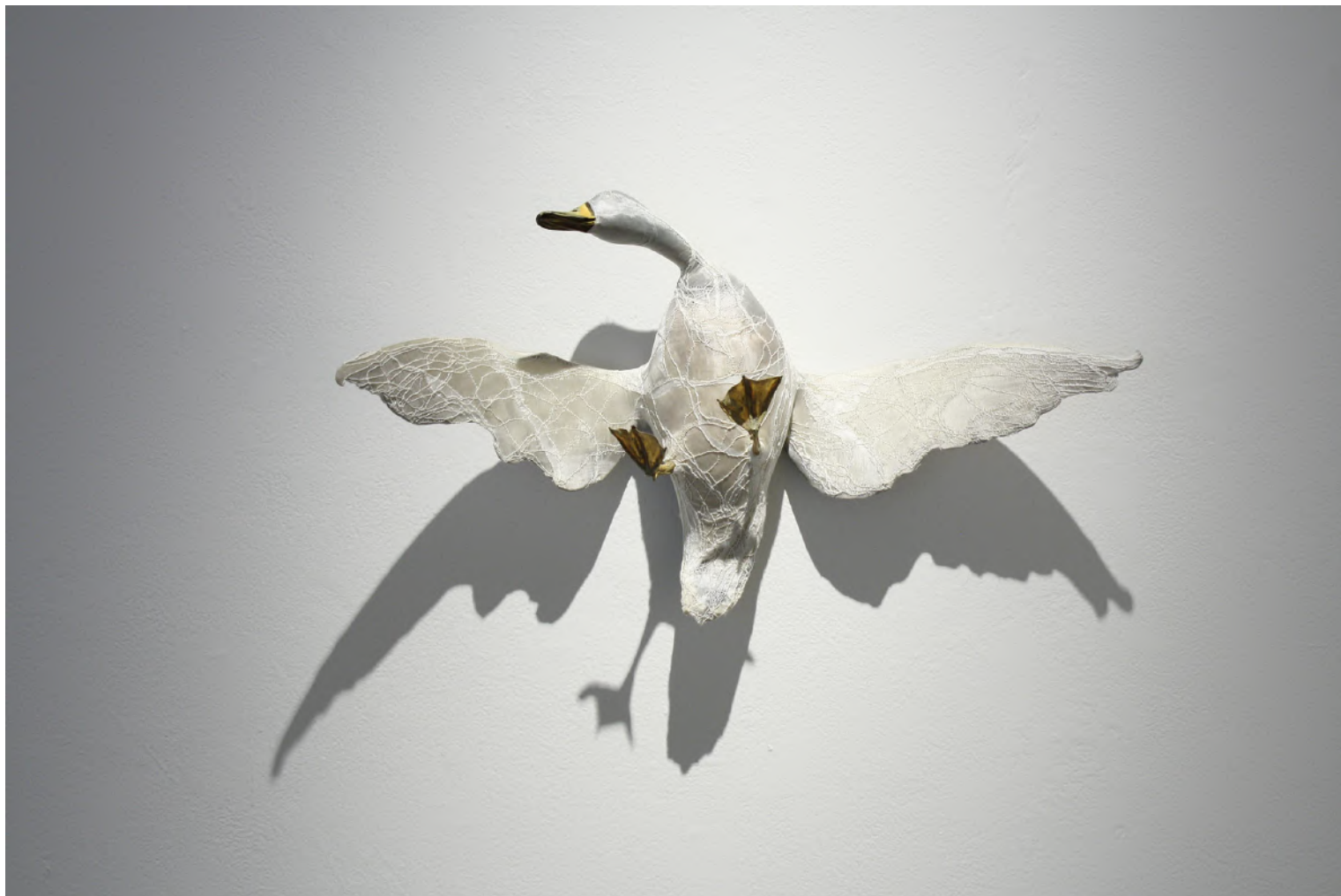
An Unpierced World V. Silk habotai, thread, antique mallard taxidermy mount 2020