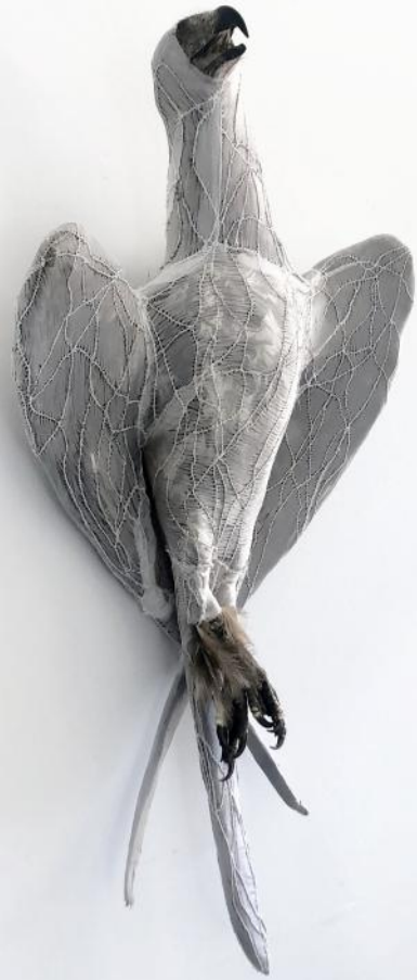
An Unpierced World VIII. Tanned kite skin, habotai silk, thread 2021