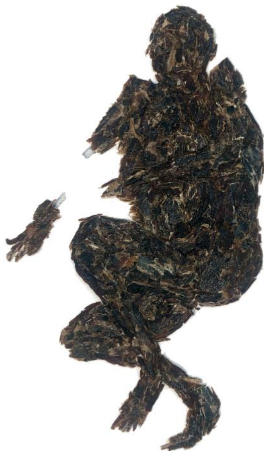
Distress Signal Print of mallard skin in raw ochre onto raw silk 2022