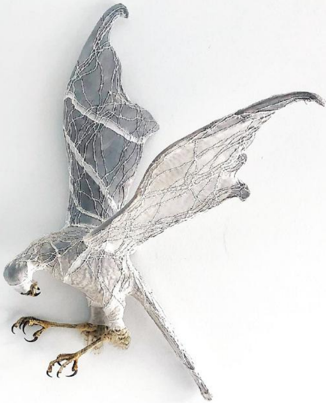
An Unpierced World VI. Sparrowhawk, habotai silk, thread 2020