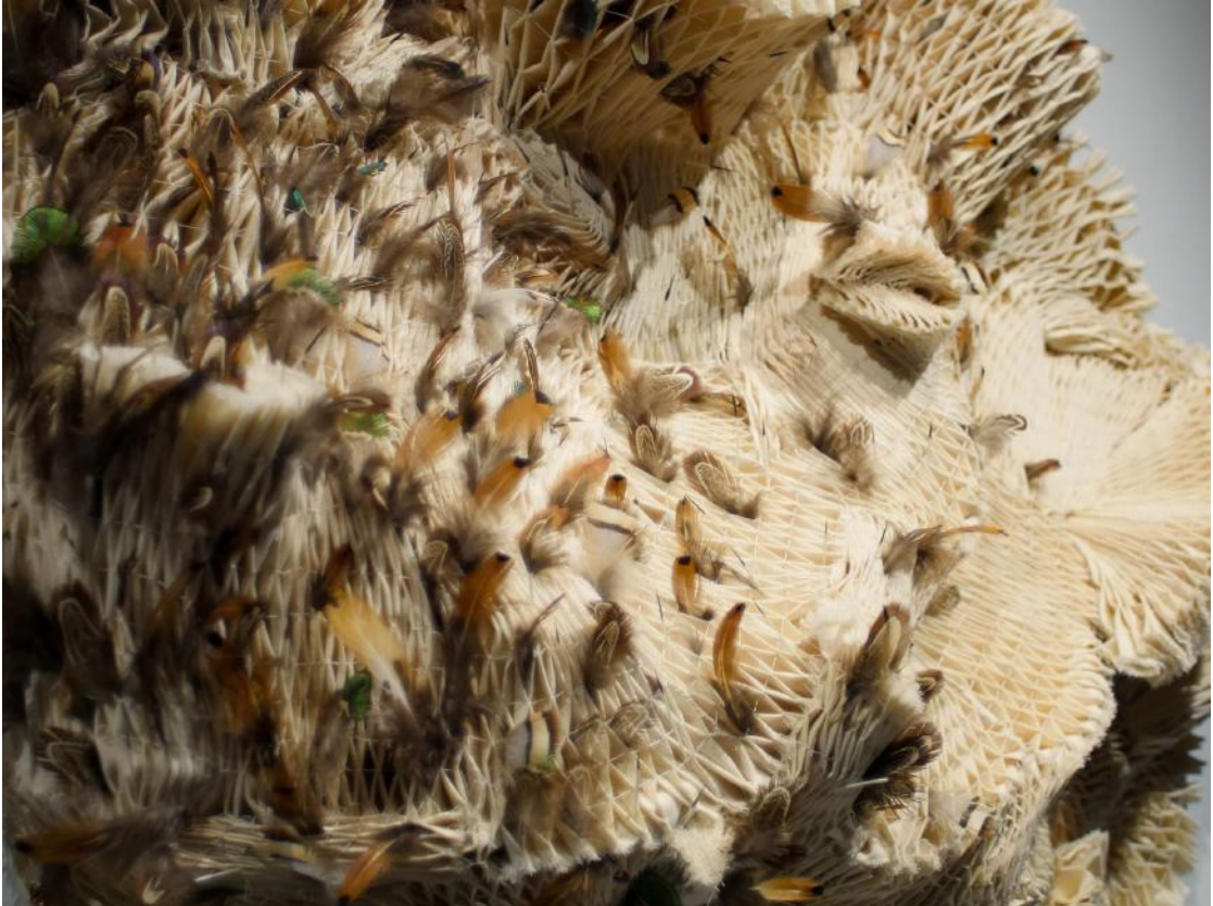
Cleaving/Enfolding (Patterns For New Animal Skins) Muslin used in pattern making, thread, porcupine quills, partridge feathers, chicken feathers 2019