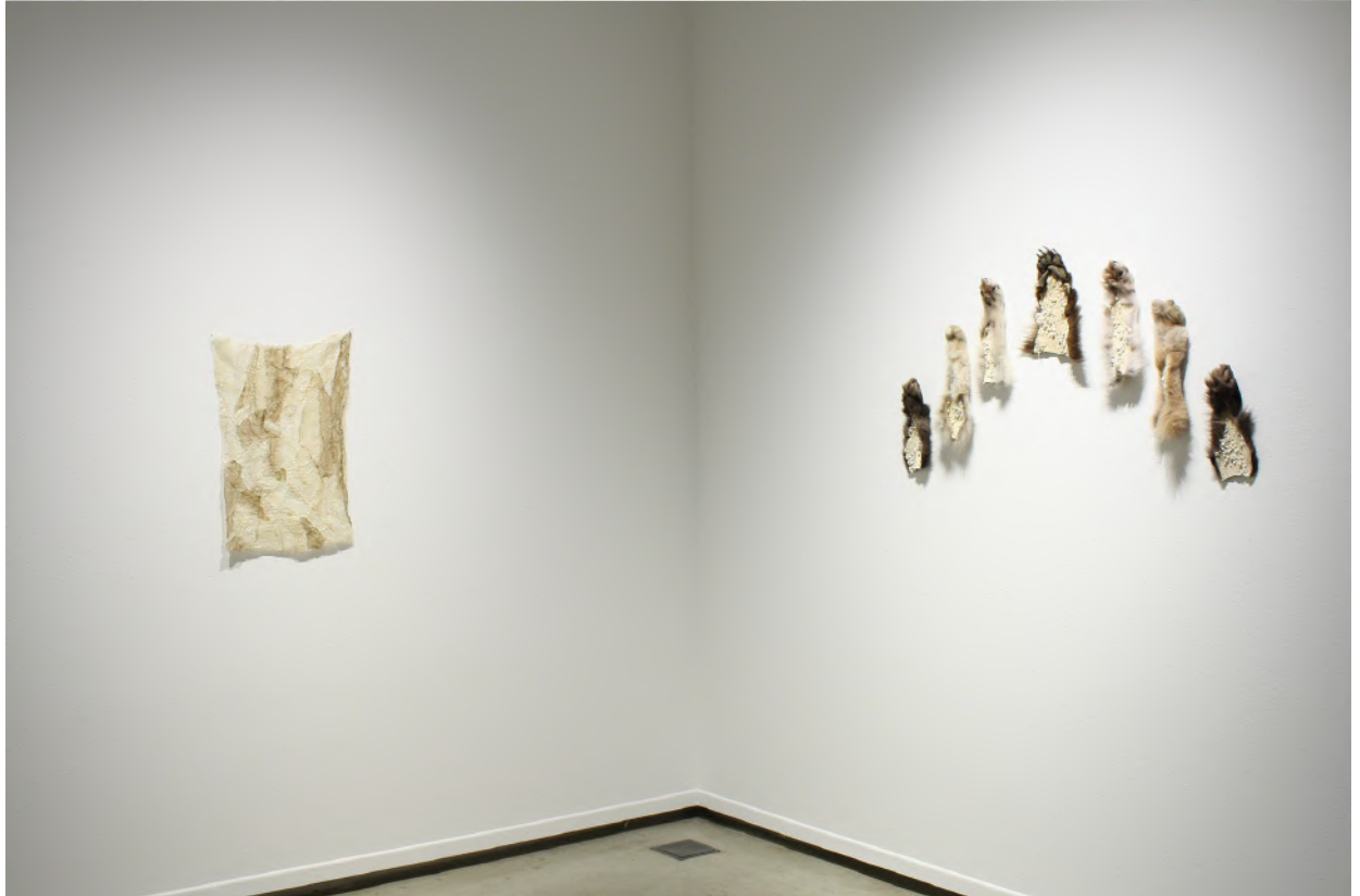
The shape of this wound existed before me- Freshwater pearls, tanned coyote, wolf, lynx, and bear feet 2021