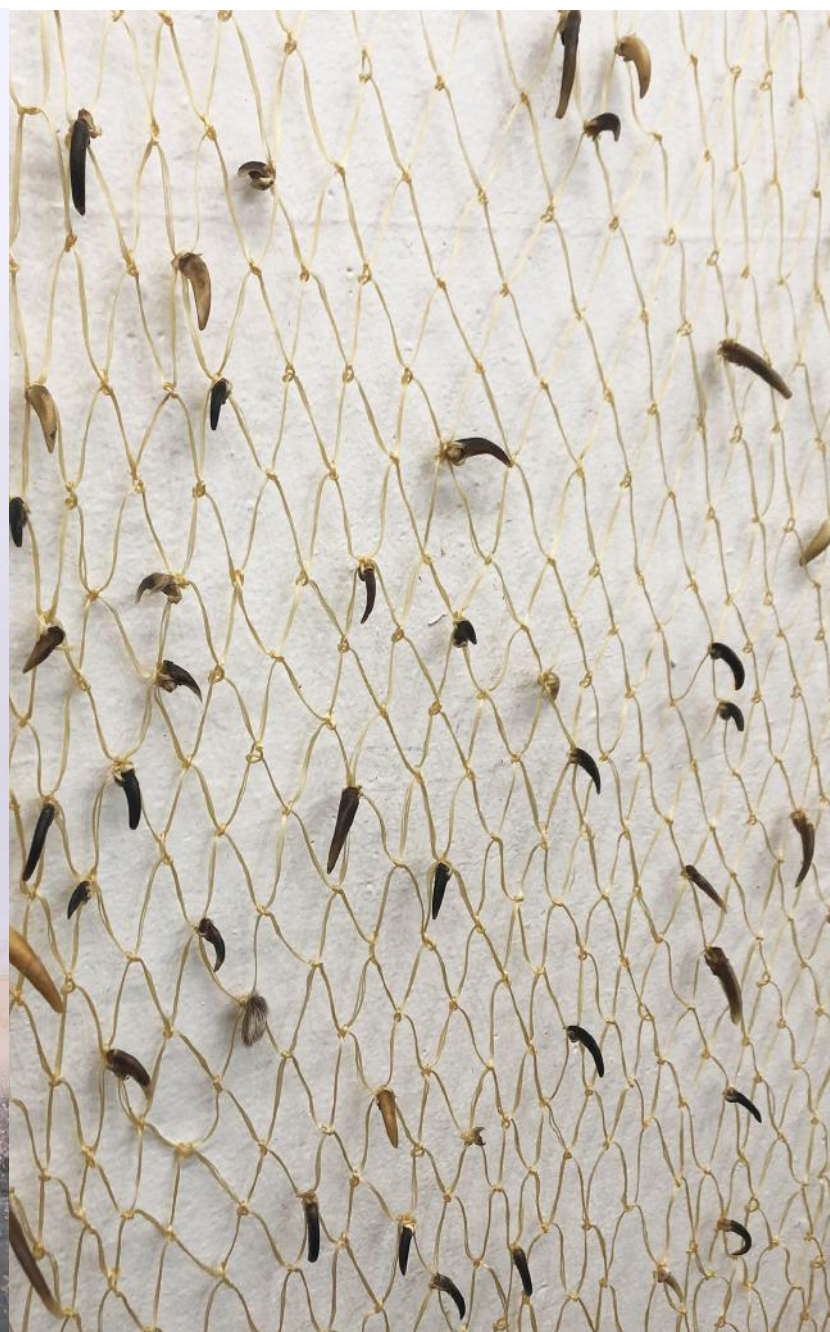
The Hair Shirt Artificial sinew, opossum claws, coyote claws, lynx claws, wolf claws, porcupine claws, turtle claws, badger claws, fisher claws, fox claws 2022