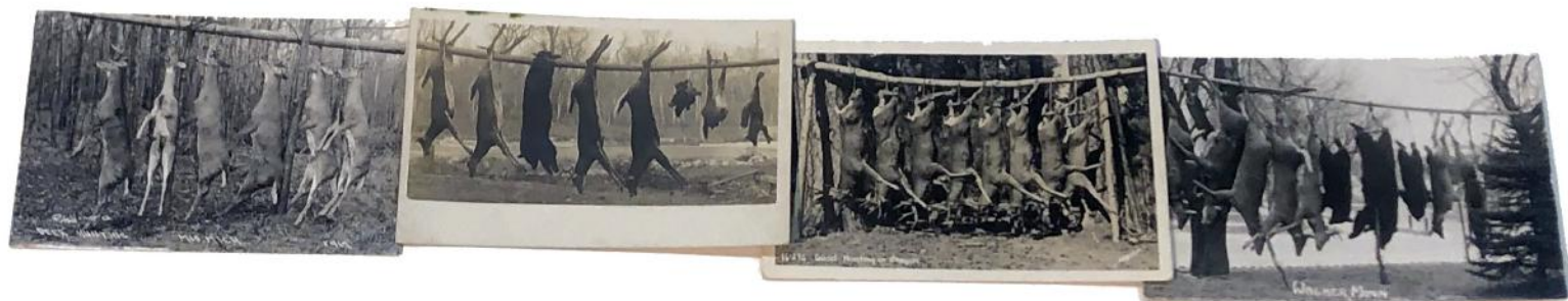
Harvest Antique photo postcards on rag paper 2022