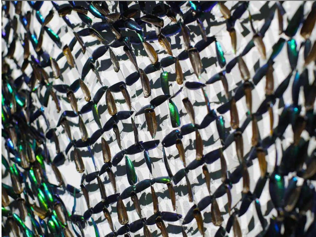
Godcatcher Approximately 3000 sustainably harvested beetle wing casings from Thailand, thread 2019