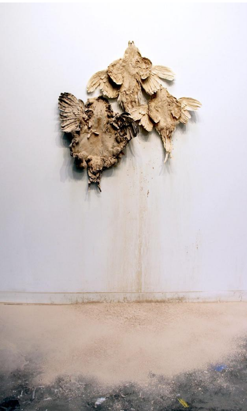
Ash as Evidence of Previous Disaster Tanned chicken pelts, cosmetic grade volcanic ash 2018