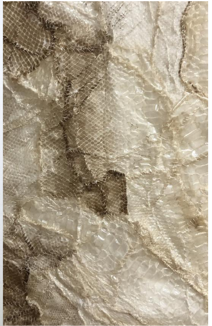
Veil of Veronica I. Shed skins from multiple snakes, thread, silk 2021