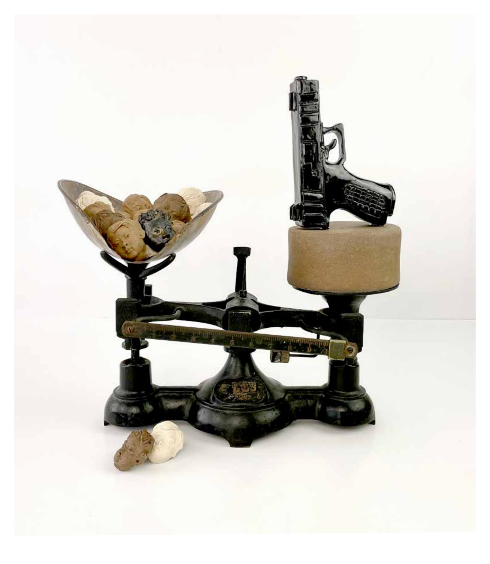
TRADE OFF, 2021, Vintage scale, ceramic

Gun violence is now the leading cause of death for all children and teens ages 1 - 19 (Nationwide). Car crashes were the previous leading cause. [childrensdefense.org] [PBS]