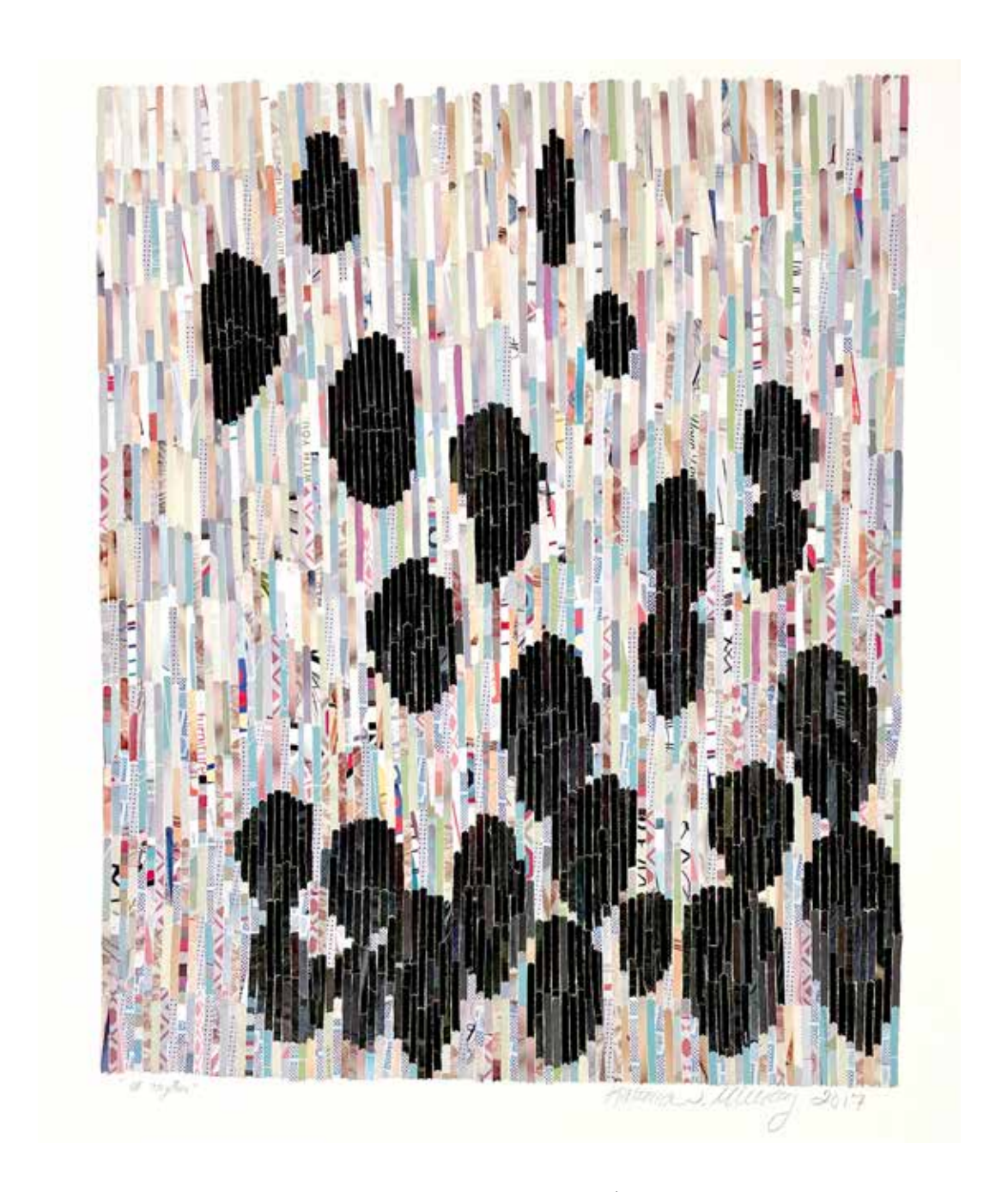
ALL TOGETHER, 2017, Paper, 20 in. w x 23 in. h

Made while in recovery from a mild traumatic brain injury (MTBI). In the making of this piece, and others like it, the artist began relearning and unlearning. The black oval shapes represent voids in memory.