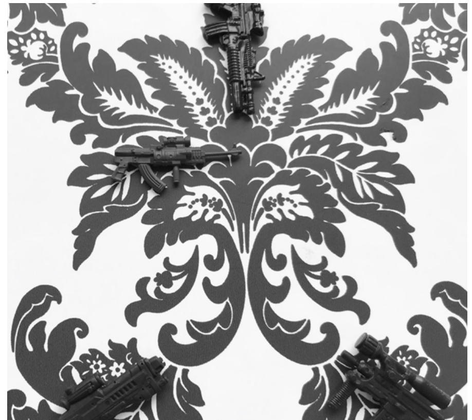
Traci Talasco, False Sense of Security , 2017, dimensions variable, graphite, wallpaper; 1:12 scale toy guns, 8x8 inch wood panels, hardware. (Detail shot)

“Artists-in-the-Market-Place,” The Bronx Museum of Art, summer 2003.