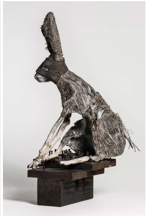
Tomboy, 2016, wire mesh, wire, telephone line connector, Claystone, watercolor, India Ink, gouache, wood, nails, H24" x W12" x D10"