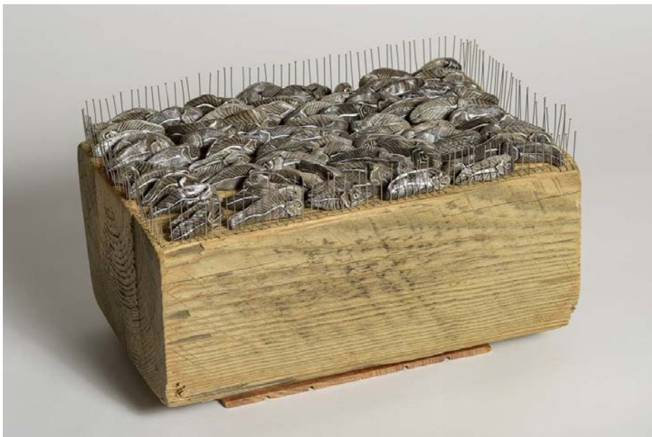
Looking for a way out, 2013, Claystone, India Ink, gouache, wood, straight pins, H7" x W12" x D8" PTP