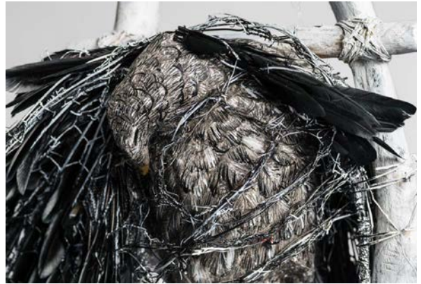
Ever Lovely, Evergreen, 2019, wood, chicken wire, mesh, plaster wrap, wire wire hangers, Paperclay, twine, watercolor, gouache, feathers, H69" x W38" x D24"