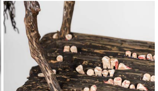
Let go and let God, 2016, wood, window chain, chicken wire, wire mesh, Paper Clay, gouache, wire, twine, H43" x W25" x D14" PTP