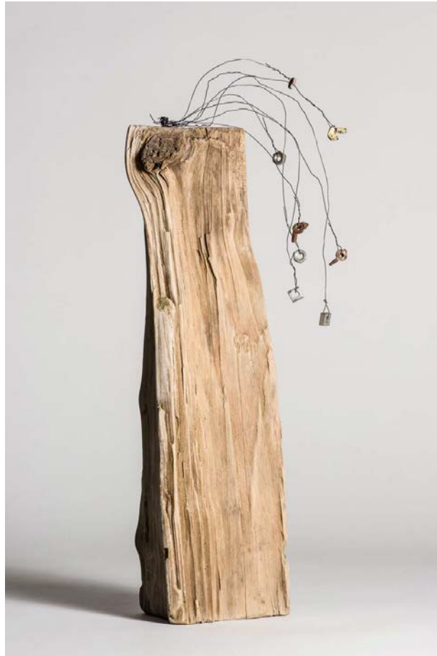
Dad's Nuts and Bolts, 2015, wood, wire, wingnuts, H17" x W5" x D5" PTP