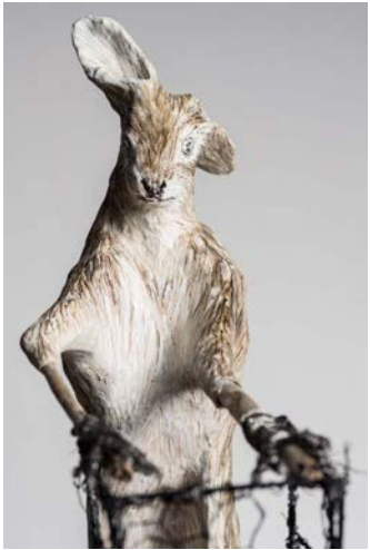
A Beautiful Nightmare, 2019, wire, wire hangers, wood, chicken wire, wire mesh, plaster wrap, Paper-clay, watercolor, gouache, nails, screws, aluminum cans, H24.25" x W14" x L31"