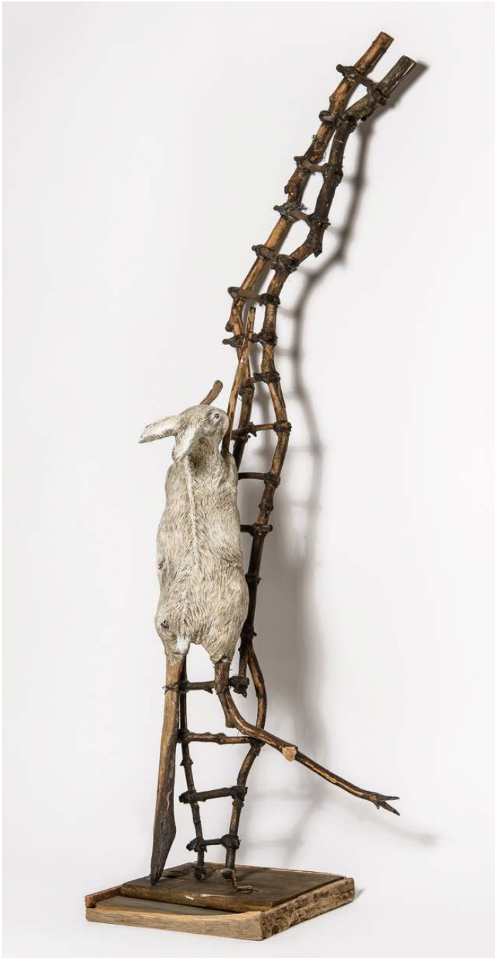
Talking about hard things, 2014, wood, wire, joint compound, plaster, watercolor, twine, wire, India Ink, gouache, H52" x W13" x W13" PTP