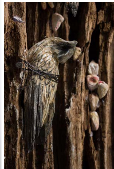
The Argonne Forest, 2019, wood, wire, Paperclay, watercolor, gouache, H18" x W11" x D7" PTP