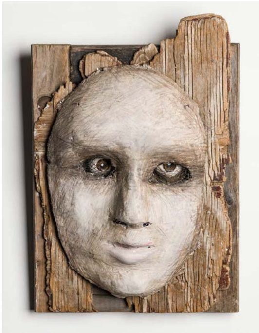
Les Yeux sans Visage, 2018, wood, Paperclay, watercolor, gouache, mesh, wire, H11.5" x W8" x D4"