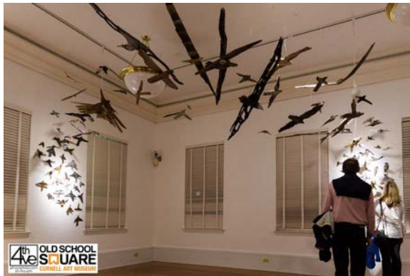
The Lives of Birds, 2007 - 2016 (ongoing), Installation at The Cornell Museum of Art, Old School Square, Delray Beach FL, H10' x W20' x L 25', mixed media