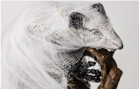
Possum Kingdom, 2019, wood, truck parts, chicken wire, plaster wrap, Paperclay, watercolor, gouache, cheesecloth, telephone cable, H13" x W9" x D10" PTP