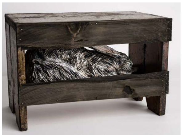
A night without stars, 2019, wood, wire. wire mesh, chicken wire, plaster wrap, Paperclay, watercolor, gouache, cedar shingles, H10.75" x L15.875" x D9.5"