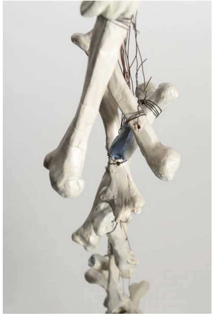
Morgan's Bones: the past is always present, 2012, Claystone, enamel, H108' x W8"