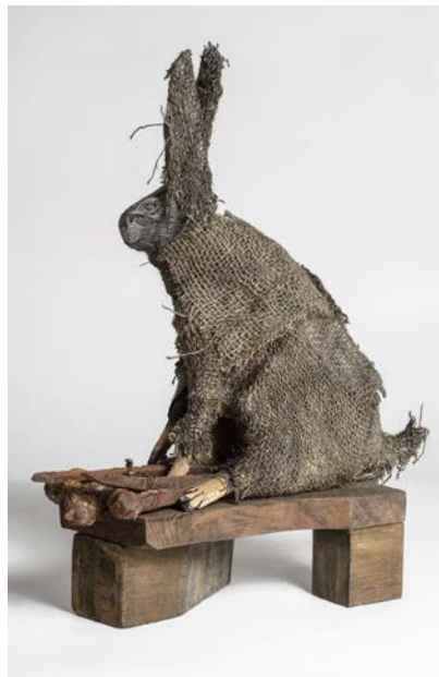
Dark Forest, 2014, wood, spikes, wire, burlap, Claystone, India Ink, gouache, L13" x W6" x H18"