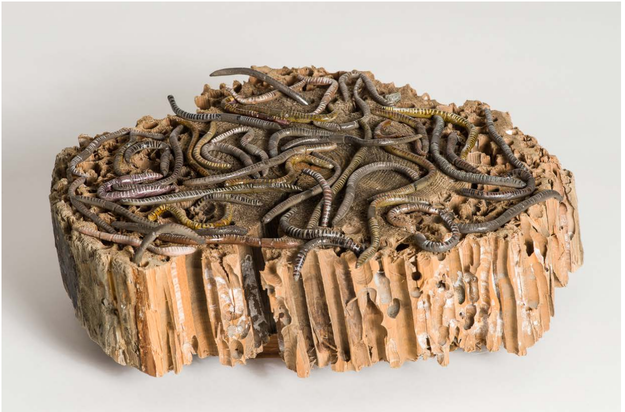
Summer of Worms, 2015, wood, Claystone, watercolor, India Ink, gouache, H5" x L14" x W11" PTP