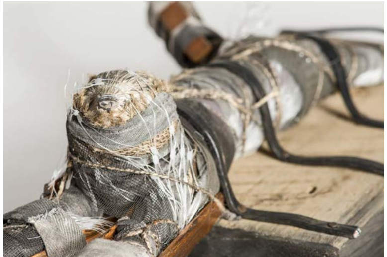
Welcome to the Human Race, 2015, wood, Paper Clay, watercolor, twill tape, wire, netting, screen, telephone wire, L37" x W13" x H10"