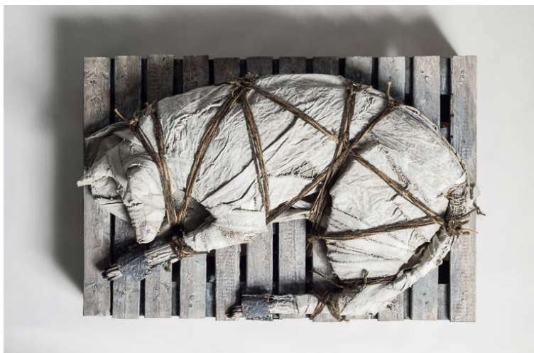
Speak to me, 2016, wood, latex paint, canvas, wire hangers, wire, twine, Paper Clay, burlap, chicken wire, W36" x H24" x D10" PTP