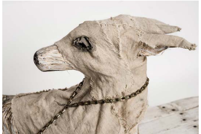
Philosophy of the world, 2019, wood, fence pickets, chicken wire, wire mesh, Paperclay, plaster wrap, wire hangers, canvas, gouache, watercolor, window chain, L70" x W24" x H19"