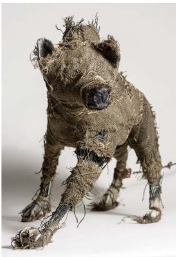
The Queen's Beast, 2014, wire, hangers, chicken wire, Claystone, Paper Clay, watercolor, gouache, India Ink, umbrella fabric, burlap, hemp, L42" x W11" x H22", window chain (L97") PTP