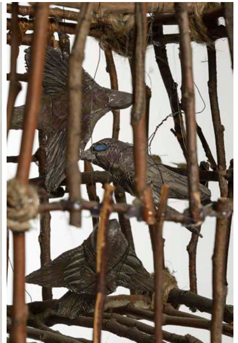
Susie's Finches, 2012, wood, twine, wire, Claystone, watercolor, H22" x D11" x W11" PTP