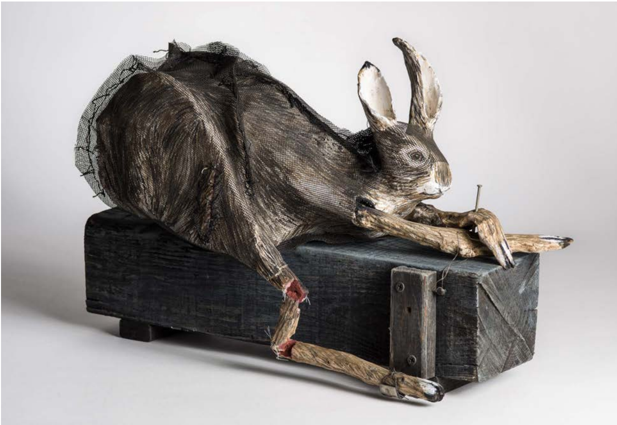
Imitation of Life, 2017, wood, wire, mesh, plaster, Paperclay, watercolor, screen, H12" x L16" x W9" PTP