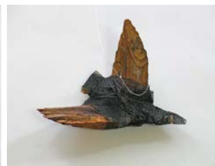
Lives of Birds, details PTP