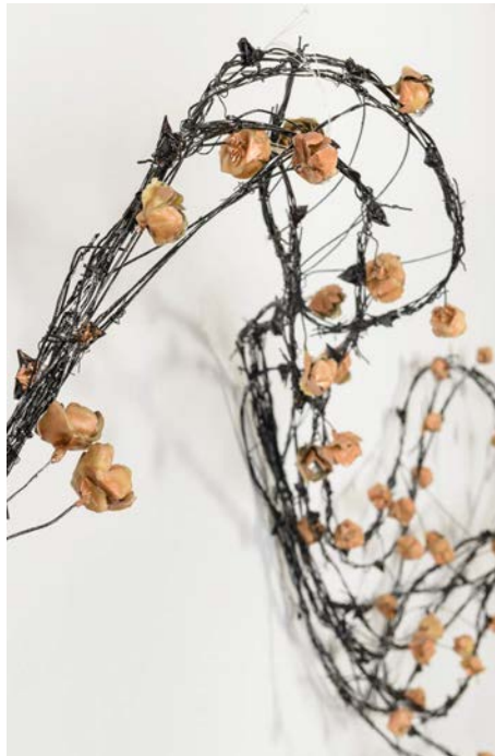
Carnival of Souls, 2013, wire hangers, wire, foil, beeswax, enamel, L120" x D22" x W48" PTP