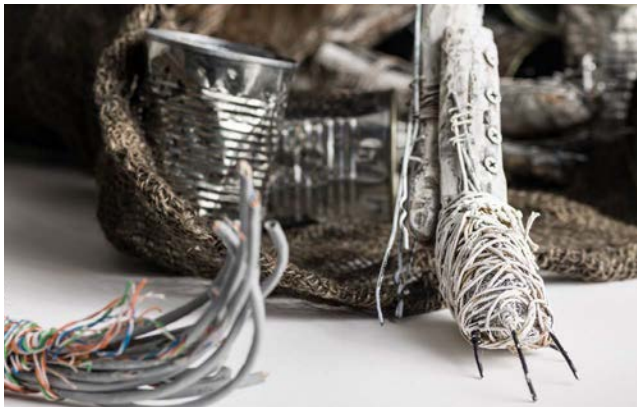
Romulus and Remus, 2018, wood, wire hangers, chicken wire, mesh, plaster wrap, Paperclay, burlap, India Ink, watercolor, gouache, aluminum cans, H24" x W38" x D33"