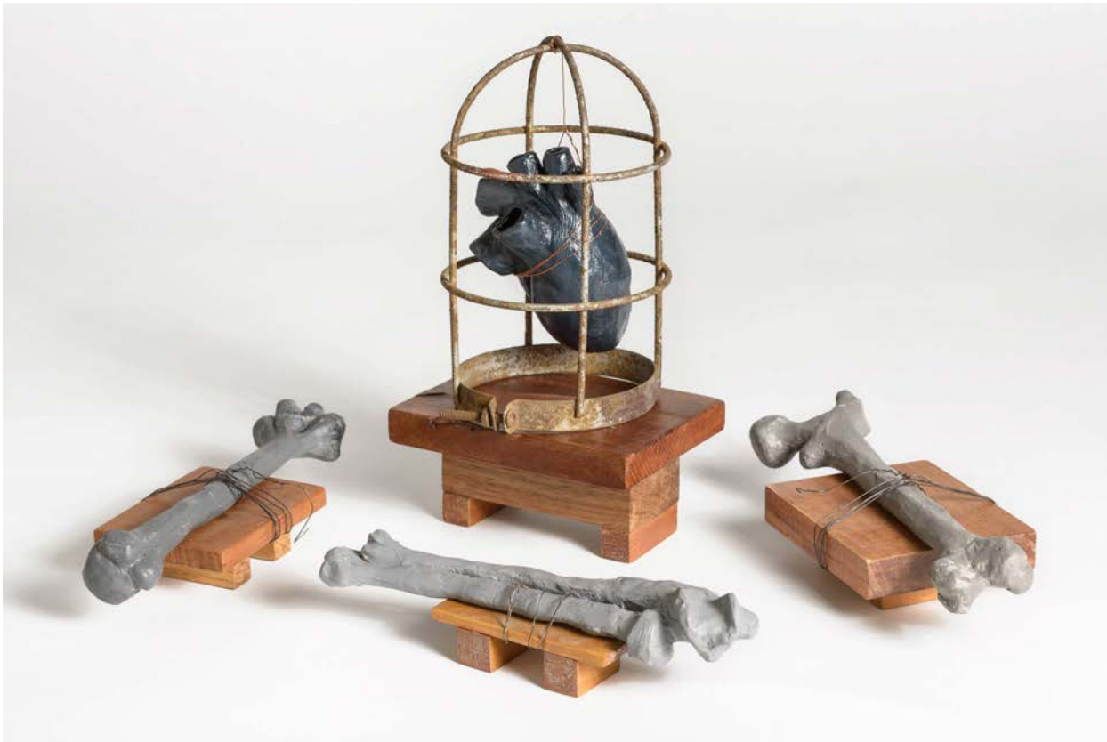
God's Last Small Mercy, 2004, ladder H72" x W2", wood, Clay- stone, wire, L40.5" x D7" x H10"