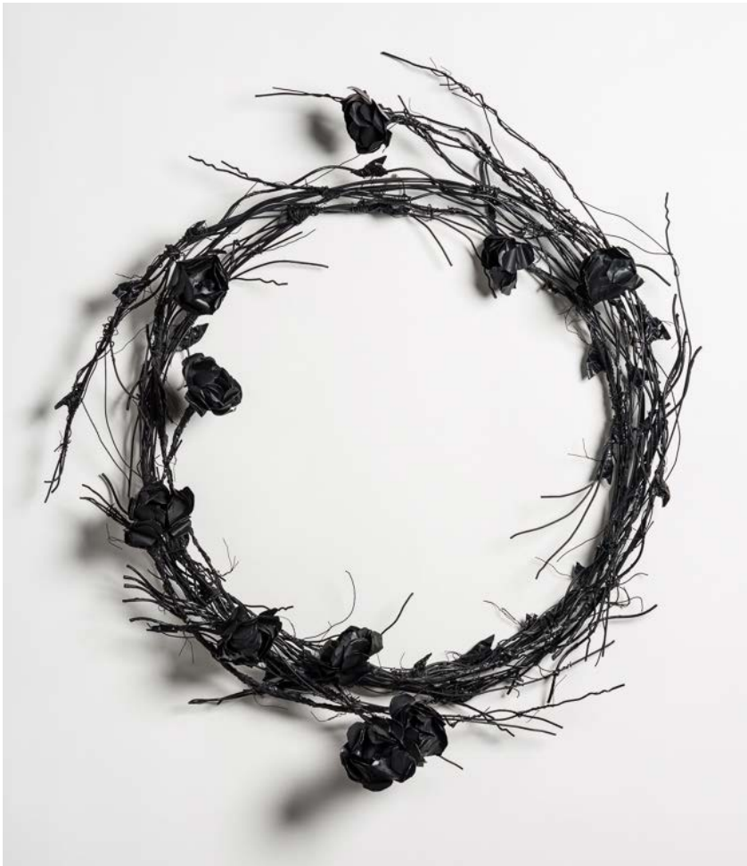
Mourning Wreath, 2016, wire hangers, foil, Cinefoil, wire, enamel, Diameter 27" x D4" PTP