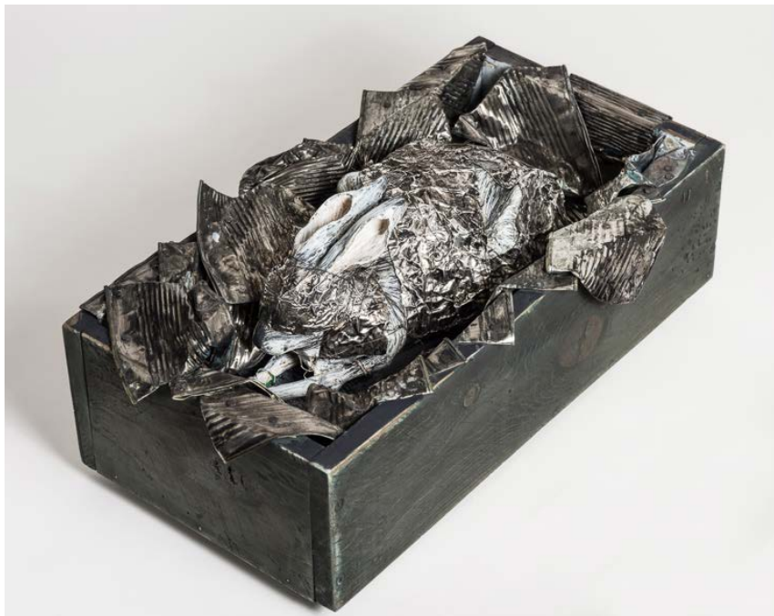
What makes a god weep, 2016, wire mesh, Paper Clay, gouache, wood, wire, cans, foil, L20" X W10.5" X D9" PTP