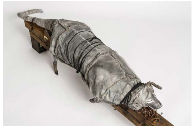
Beyond the door, 2018, wood, wire mesh, chicken wire, plaster wrap, Paperclay, canvas, India Ink, watercolor, nails, twine, H14" x W12" x L62"