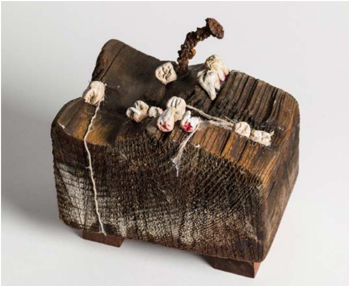
I Surrender, 2018, wood, Paperclay, watercolor, gouache, nail, string, H5.5" x W5" x D3"