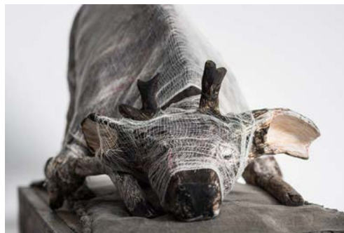
Prepare Thyself to Follow Me, 2019, wood, cloth, chicken wire, wire mesh, plaster wrap, Paperclay, watercolor, gouache, cheesecloth, H19" x W12.75" x L38.5" PTP