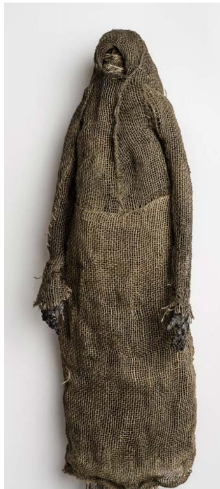
Baby ghost, 2019, chicken wire, wire, wire mesh, plaster wrap, Paperclay, watercolor, gouache, burlap, twine, H89' x W11" x D7" PTP