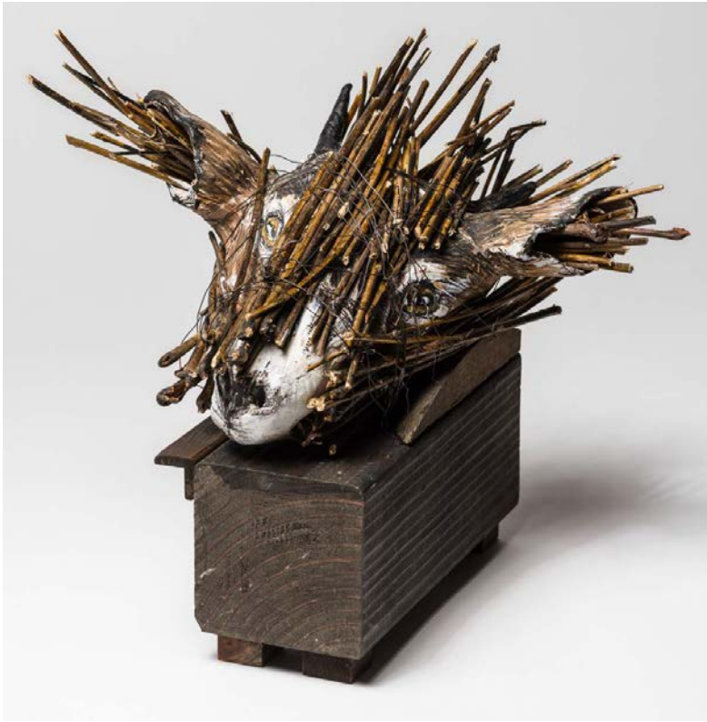
Jersey Devil I, 2016, wire mesh, Paper Clay, gouache, reeds, wood, wire, H12" x W12" x D9" PTP