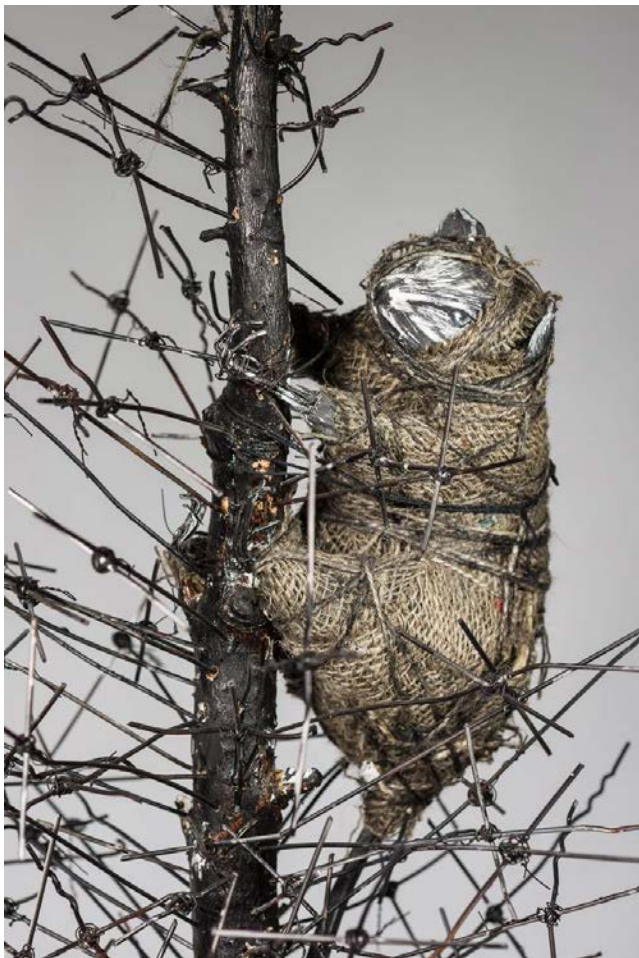
O Tannenbaum, 2015, hangers, wire mesh, wire, Christmas tree, burlap, Paper Clay, India Ink, gouache, Christmas tree stand, H78" x W18" x D18"