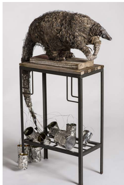
A Grim Fairy Tale, 2016, chicken wire, Claystone, twine, burlap, plaster, joint compound, India Ink, watercolor, gouache, wood, wire, cans, aquarium stand, H45" x W12" x L30"