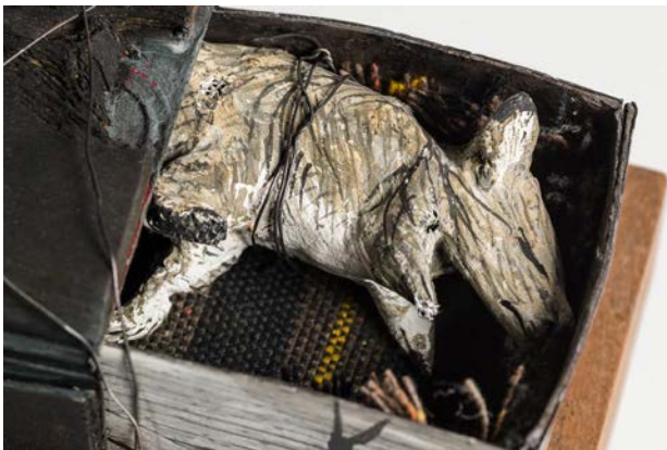
Prophecy, 2012, matchbox, wire, cedar shingles, Paperclay, watercolor, H5" x L7.5" x W4" PTP