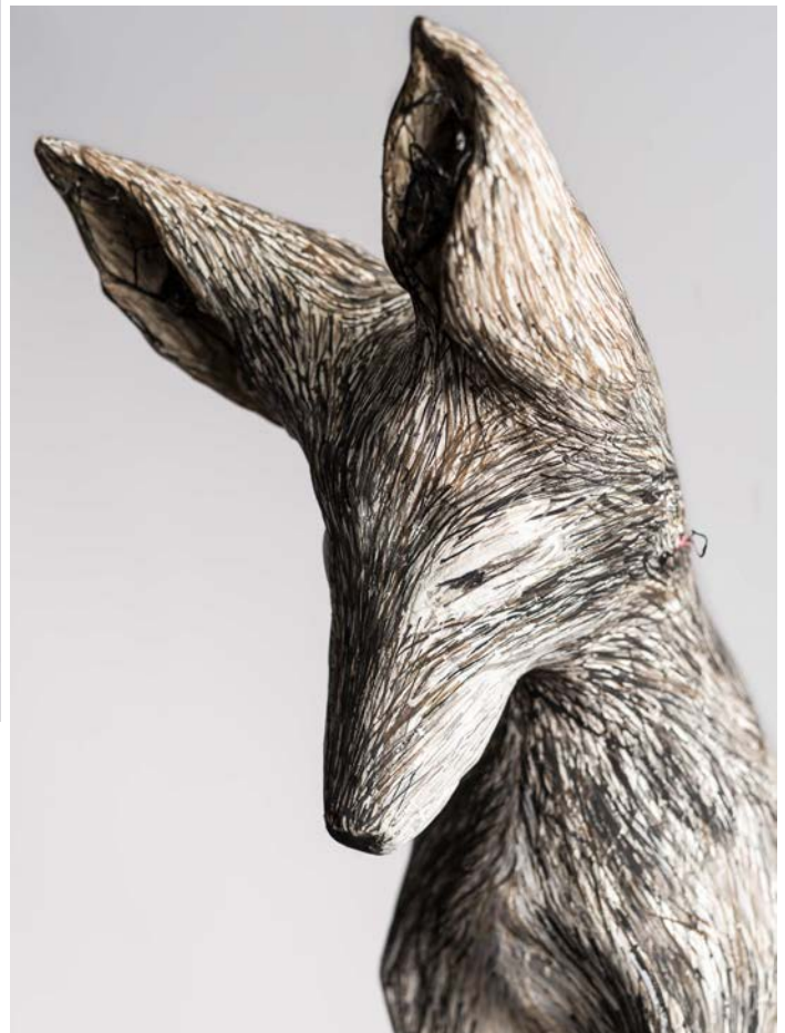
Gate Valve, 2019, chicken wire, wood, wire, mesh, wire hangers, plaster wrap, Paperclay, watercolor, gouache, cable wire, faucet, H28" x W11.5" x D20" (tail 36") Private Collection