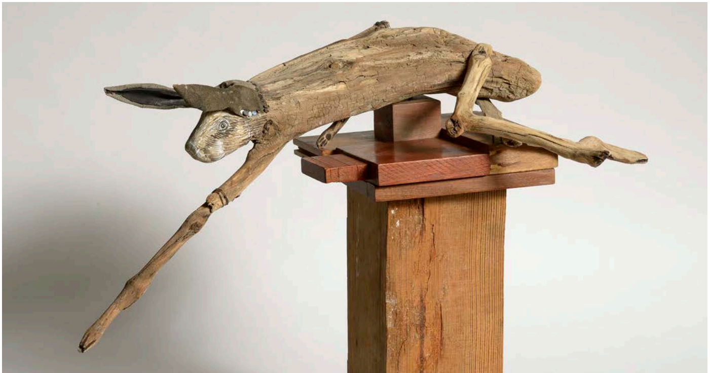
Their Fates were Intertwined, 2012, wood, plaster, watercolor, leather, wire, L26" x W15" x H7"