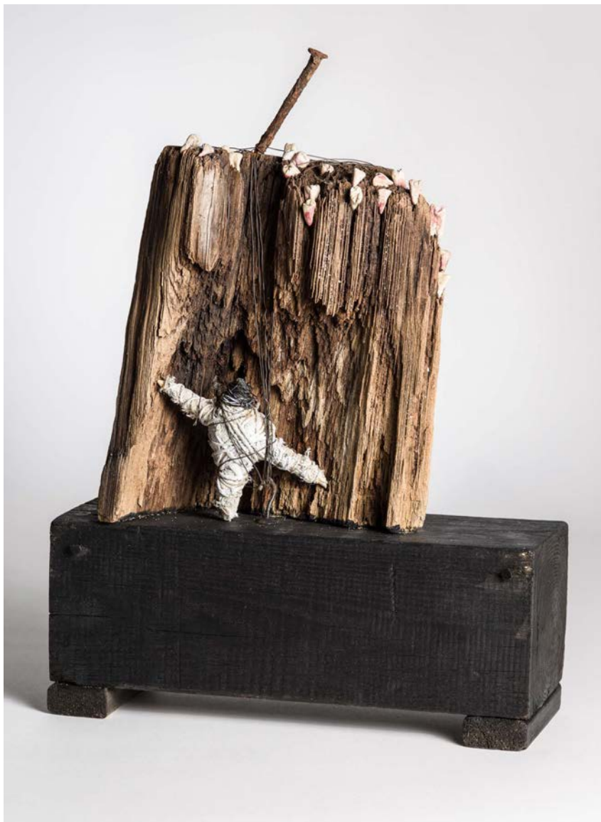
Grotto, 2017, wood, hardware, canvas, twine, Claystone, H16" x L11" x W5" PTP