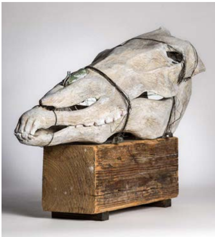
I want to be close to heaven, 2017, wood, wire, chicken wire, mesh, Paperclay, watercolor, gouache, H16" x L23" x W12"