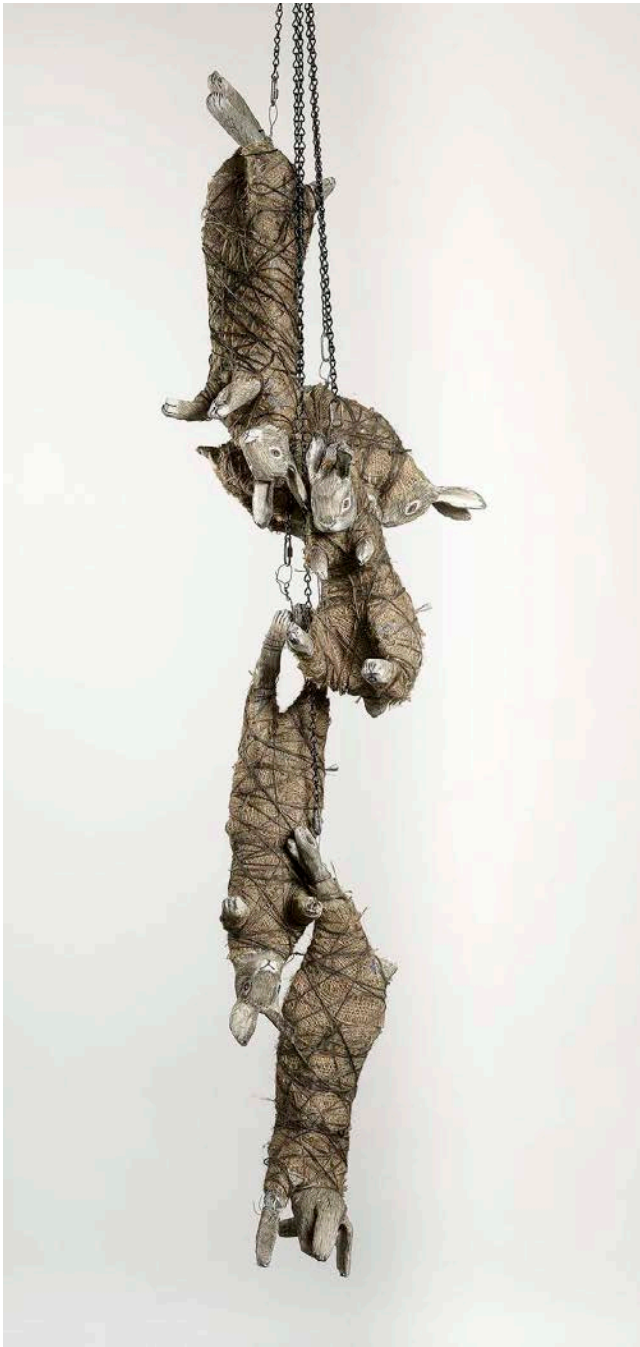
The Moon Gazing Hare, 2013, wire mesh, plaster, joint compound, watercolor, India Ink, burlap, twine, chains; H93" x D12" x W10" PTP