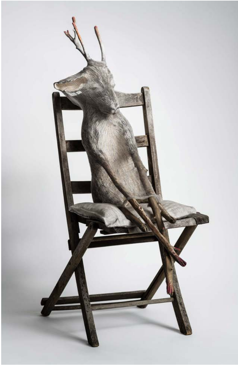
Jersey Devil III, 2019, wood, chair, cloth, chicken wire, wire mesh, plaster wrap, Paperclay, watercolor, gouache, cheesecloth, H44.5" x W17" x D34" PTP