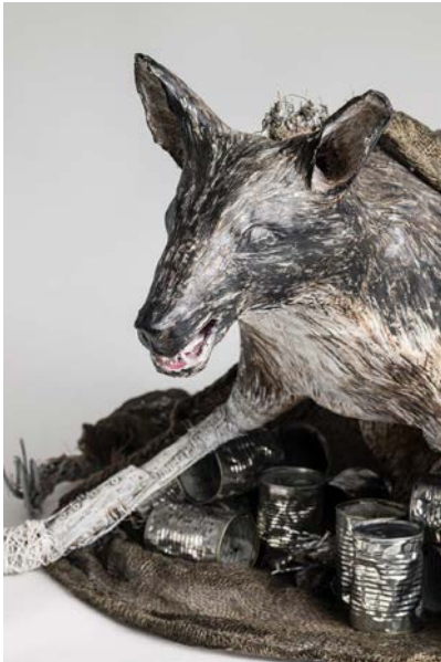
Romulus and Remus, 2018, wood, wire hangers, chicken wire, mesh, plaster wrap, Paperclay, burlap, India Ink, watercolor, gouache, aluminum cans, H24" x W38" x D33" PTP