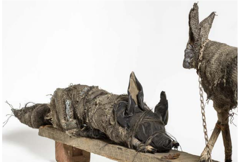
Sisters, 2014, wood, wire, mesh, leather, burlap, twine, Claystone, India ink, gouache, L58" x D8" x H20"