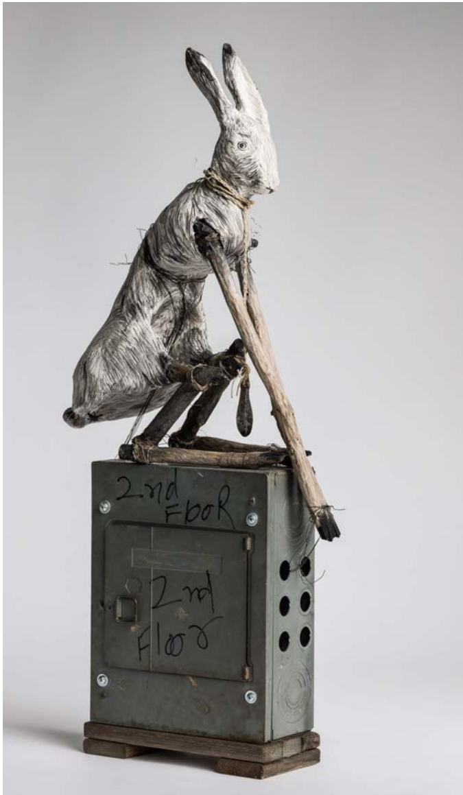
Federal Pacific, 2018, wood, wire, mesh, plaster wrap, Paperclay, watercolor, lead sinker, electrical panel box, H30" x W5" x D14"