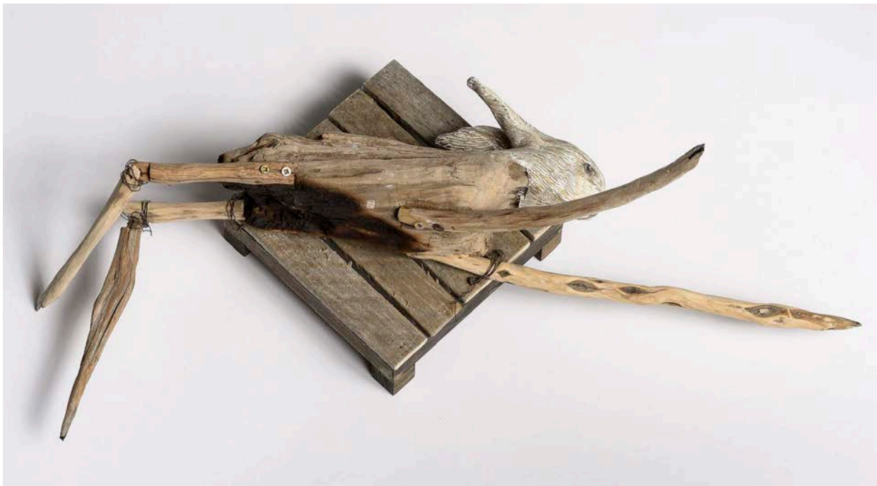
Sorry for your lost, 2013, wood, plaster, watercolor, wire, H13" x L30" x W10" PTP