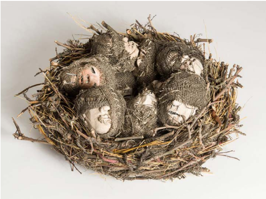
Men, Women and Children, 2015, Paper Clay, burlap, hemp twine, wood, straw, Diameter 20" x H8" PTP