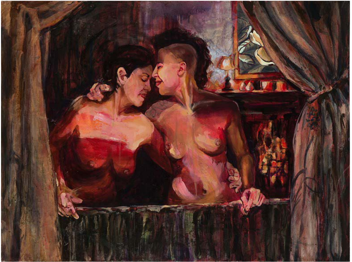
The Proposal, Part Three