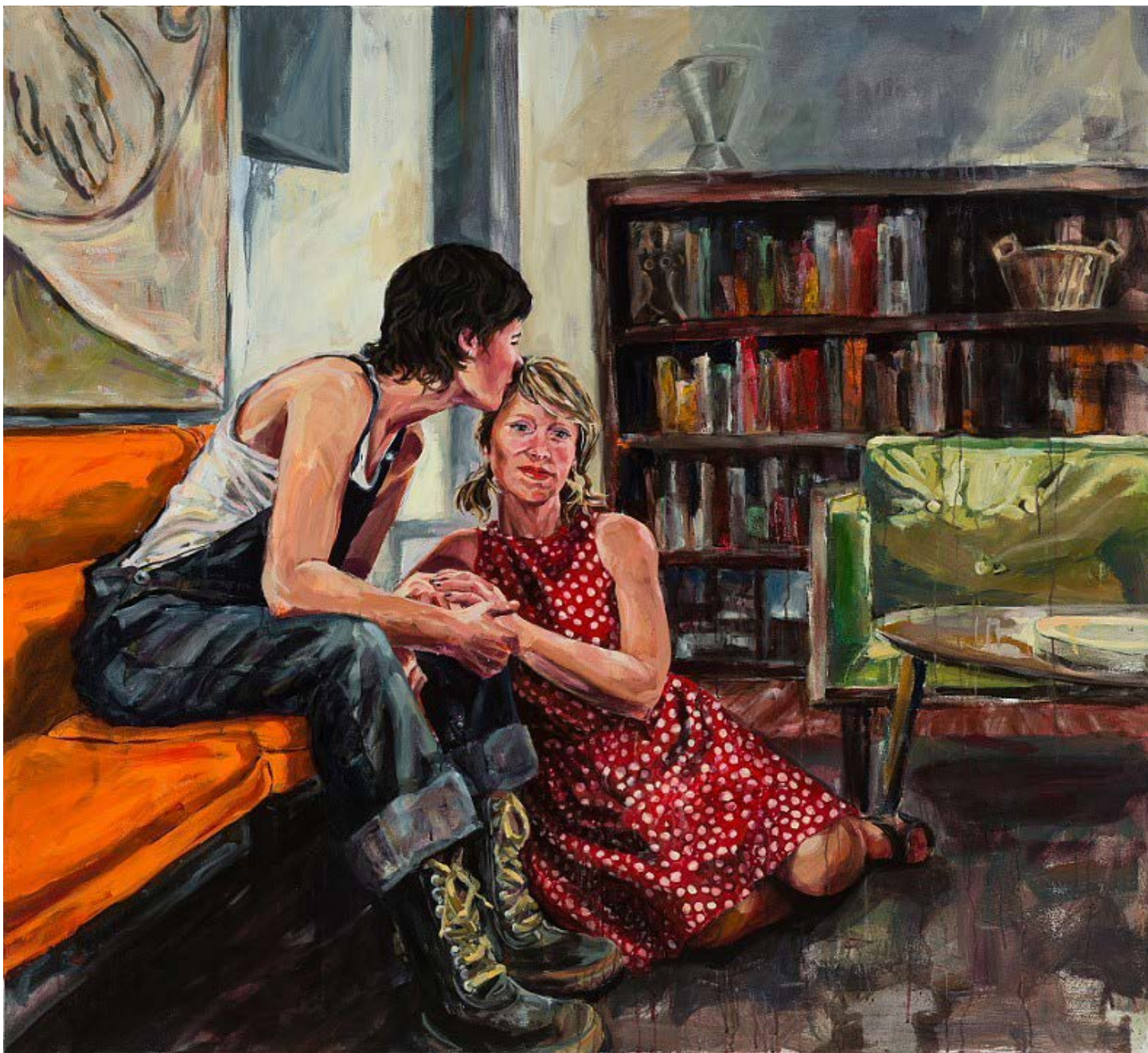
Love is Everything They Said it Would Be