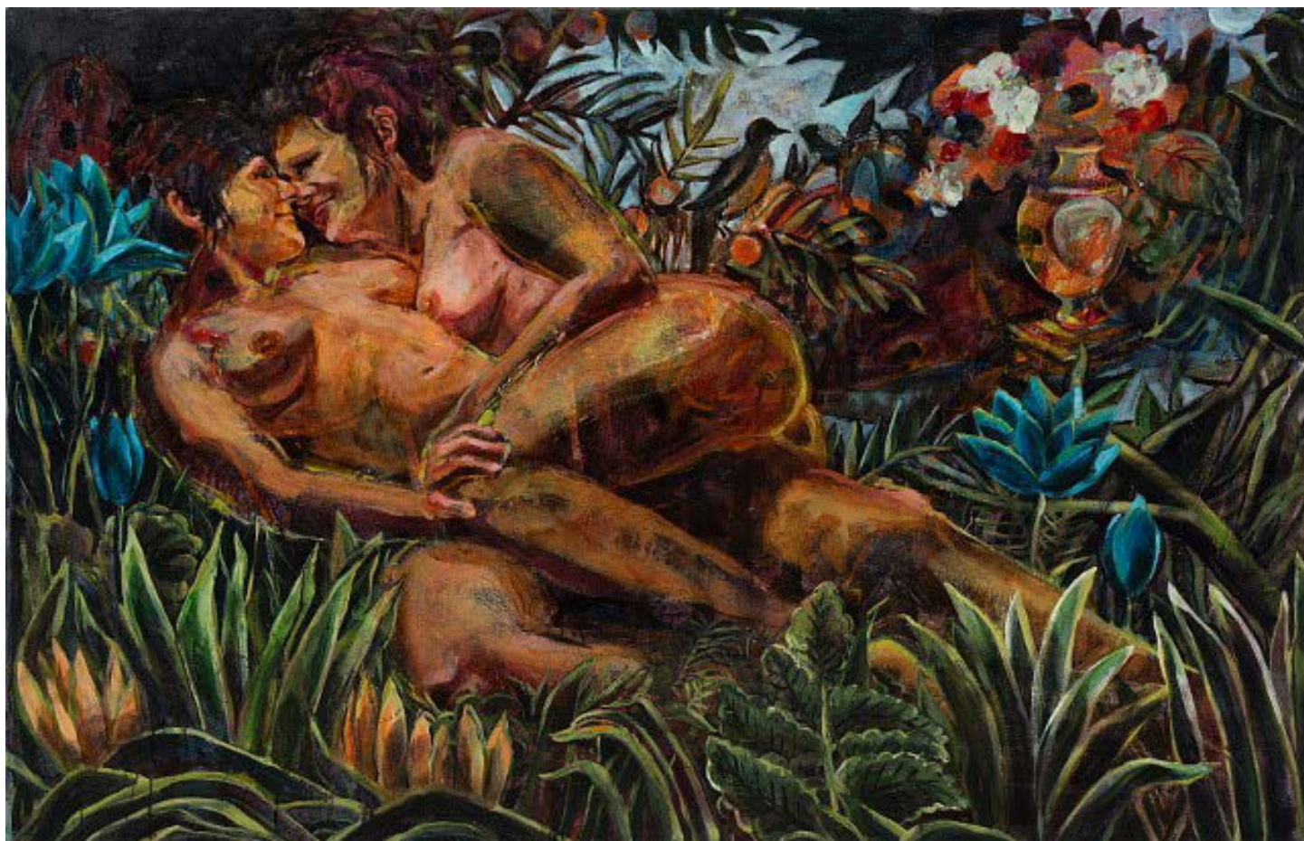
Our Dream Oil on canvas 62" x 42 2013 $6,500