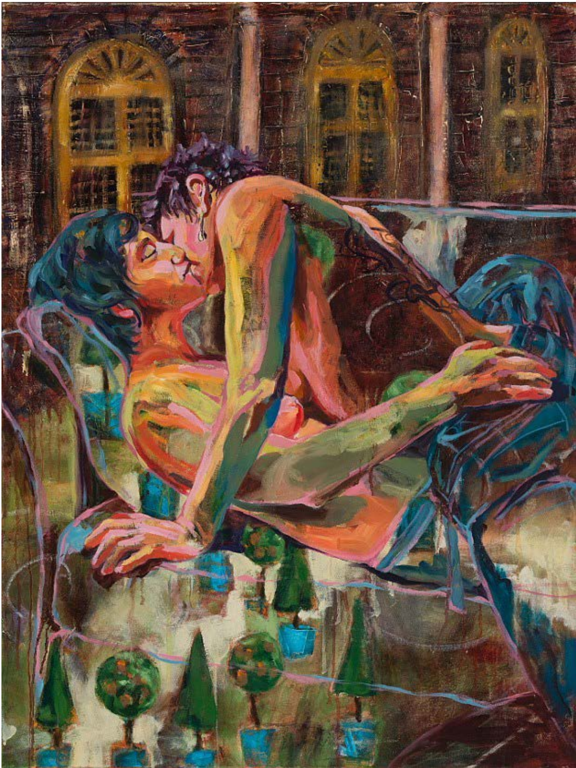
Lovers at L'Orangerie