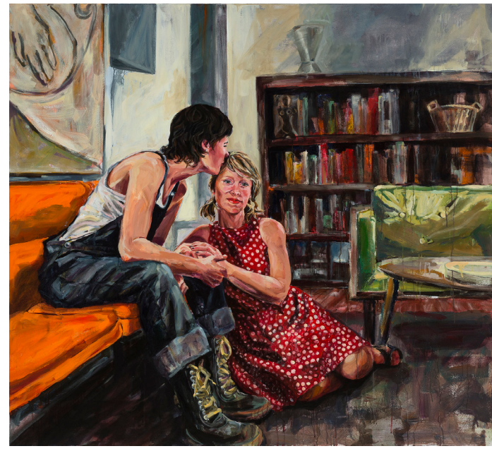
The Spectrum of You (El Espectro de Ti), 2022 Oil pastel, marker, ink, acrylic, varnish, and resin 34 \times 26 \ 1/2 \times 1/10 in 86.4 \times 67.3 \times 0.3 cm