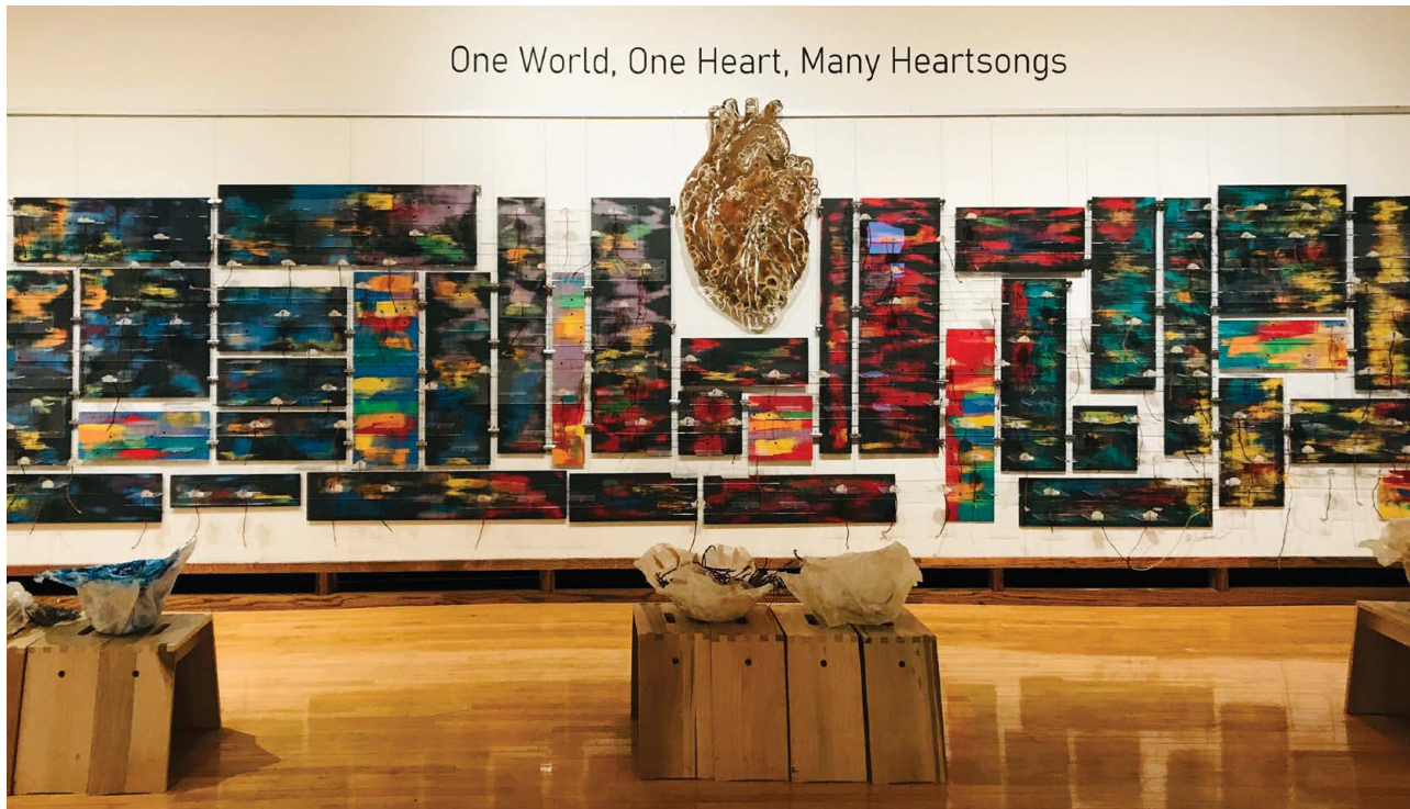
One World, One Heart, Many Heartsongs