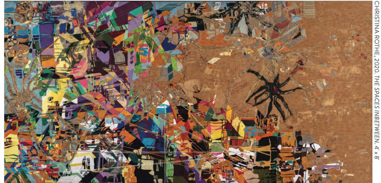
CHRISTINA ROTHE, 2020. THE SPACES INBETWEEN. 4' x 8'

OCTOBER 2, 2020 THROUGH FEBRUARY 12, 2021