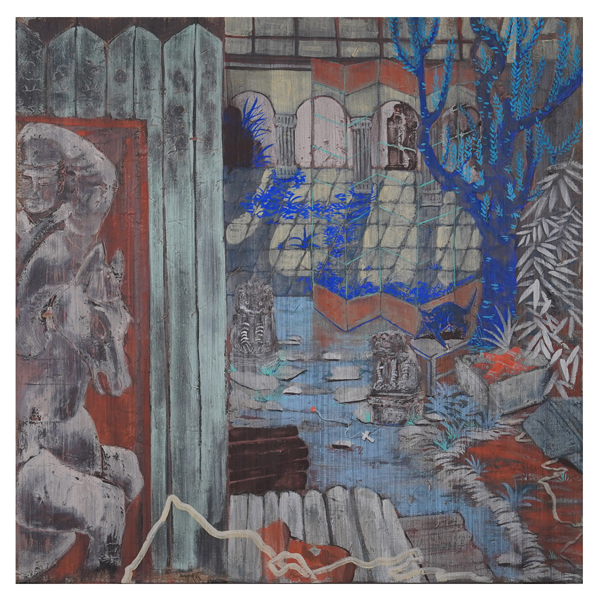
Sacred doorways, 2023 Ink, water-based colour, colour pigments and clay on canvas 31 1/2 x 31 1/2 in.

processes employed. Wong creates natural pigments from clay bodies found in the Dung Huang riverbed and uses ancient mural techniques to build faded yet rich layers that evoke a sense of reverence. Combining the old with the new, Wong invites the viewer in a liminal space that feels both familiar and otherworldly. The stylized environments in Wong's paintings serve as a record of time passedvessels for memories and the traces we leave behind."