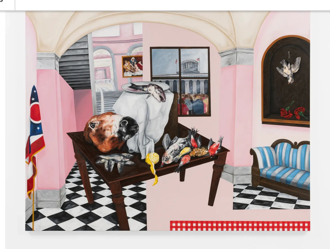
State of the State, 2023 Oil and acrylic on canvas 66 x 84 in.