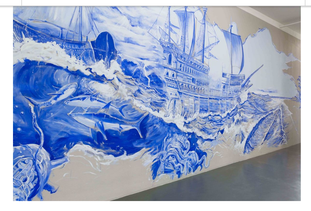
Era una noche lluviosa, pero no era de noche ni estaba lloviendo (t was a rainy night, but it wasn't night and it wasn't raining), 2020 Exhibition view

Witte de With Center for Contemporary Art, Rotterdam