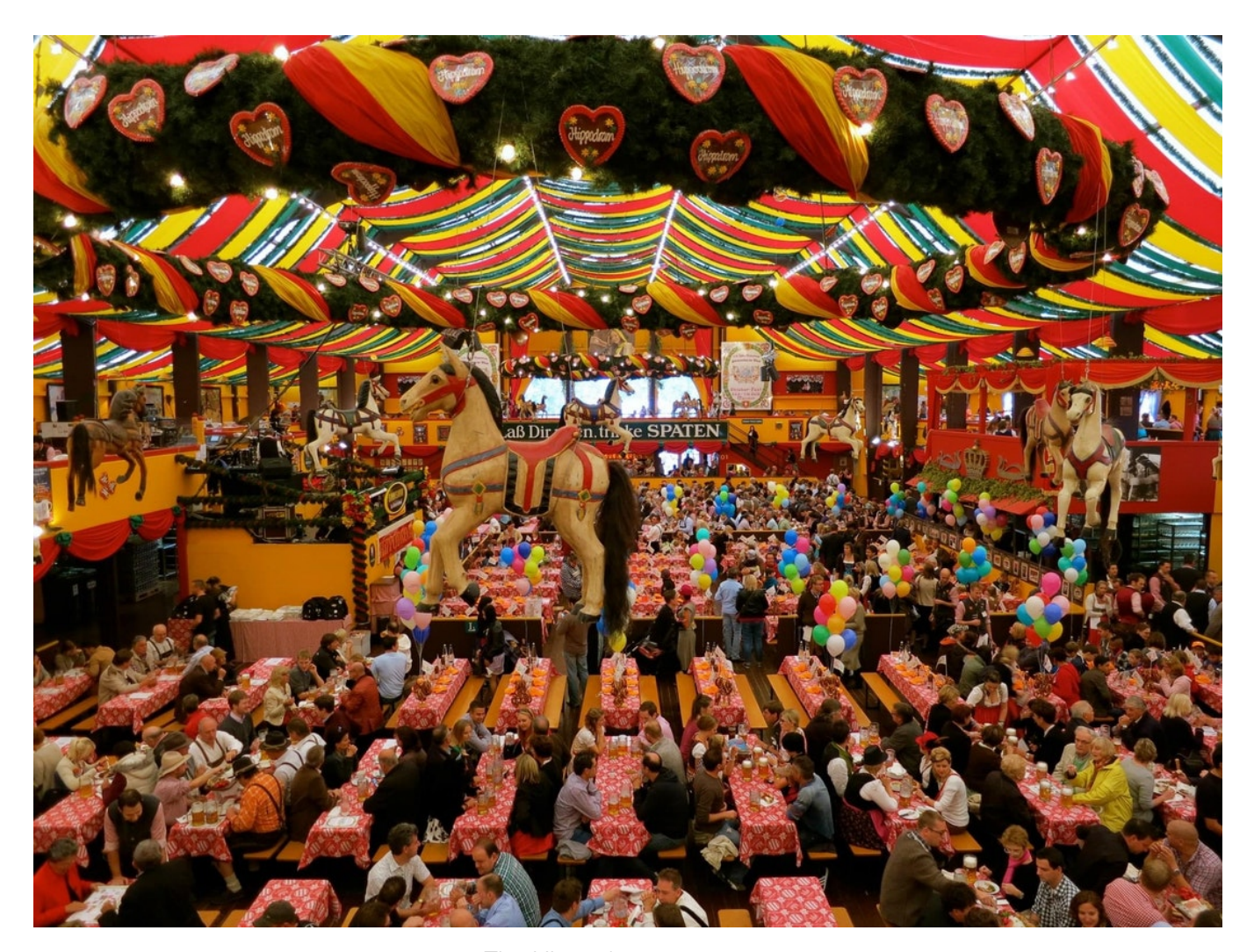
The Hippodrom tent, 2012

businesspeople sit down to banquets of cold cuts, pretzels, and radishes with butter and brown bread.