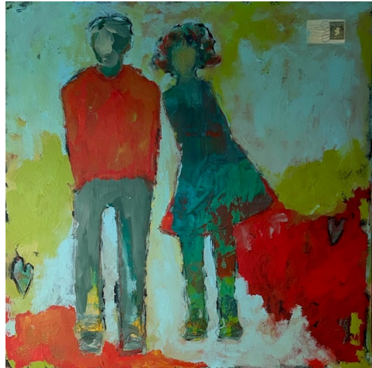
I'm a Stargazer and He Believes in Longing

All proceeds go to The Thriving Initiative at UCSB