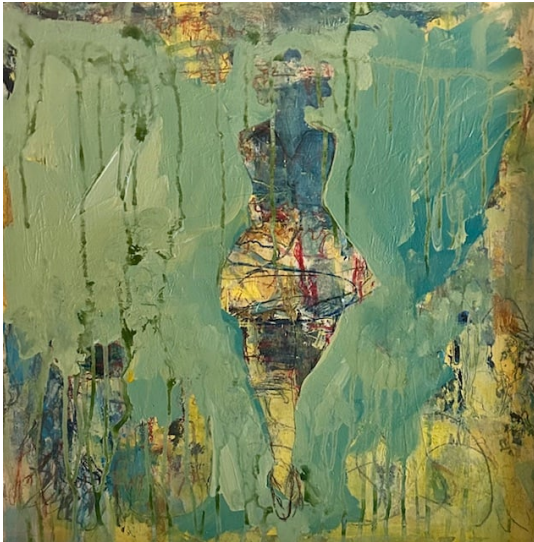
Reach for What's Been Calling Acrylic & Mixed Media on Paper Pine Box Frame