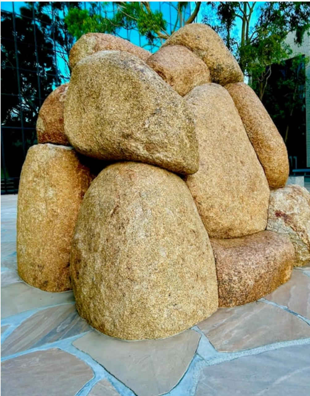
Isamu Noguchi California Scenario Garden

(if you see message clipped at the bottom of the newsletter please click on view entire message ; otherwise, you will not be able to see the whole newsletter)