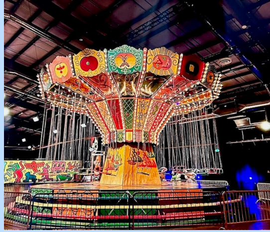
Kenny Scharf Painted Chair Swing Ride