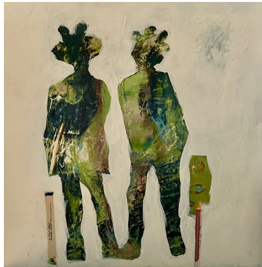
Butterfly Stroke and Sudden Quietness

All proceeds go to The Thriving Initiative at UCSB