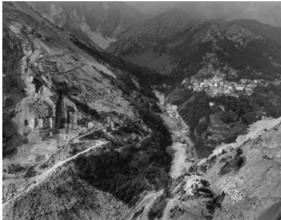
VIEW OF COLONNATA — 1987

"Venturing further into the great hall, I climbed an iron ladder onto a block of stone. From this vantage point, 20 feet above the floor, I found my picture: two men at work squaring another block with an electric diamond-wire saw. One of the men, astride the block, stood between me and the lamp they were using. I set up my tripod, stepped under the dark-cloth, and saw the most sublime vision on the ground glass. The man on the block was silhouetted before the opal light from another chamber, embraced by a luminous halo."