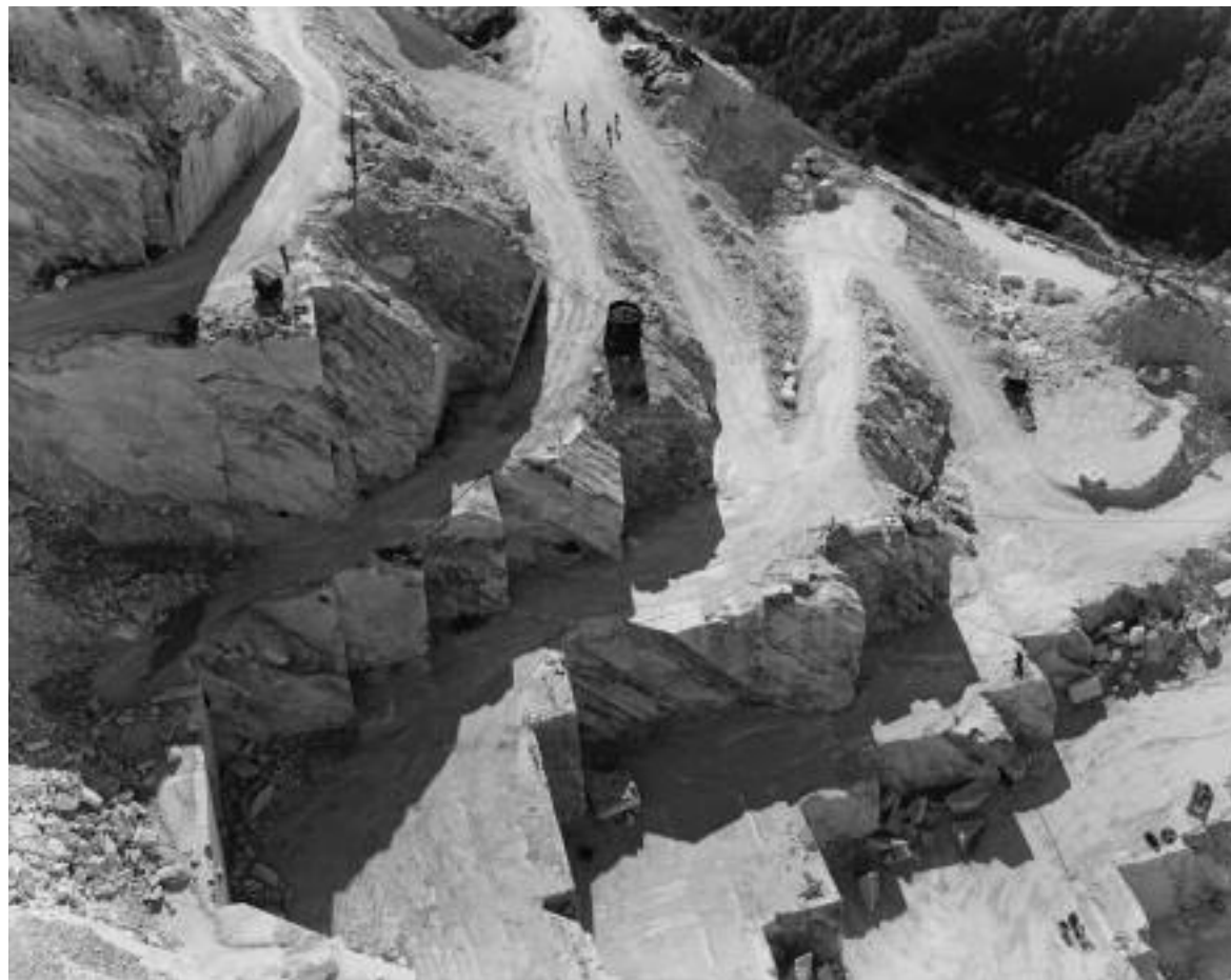
VIEW INTO GIOIA QUARRY—1989