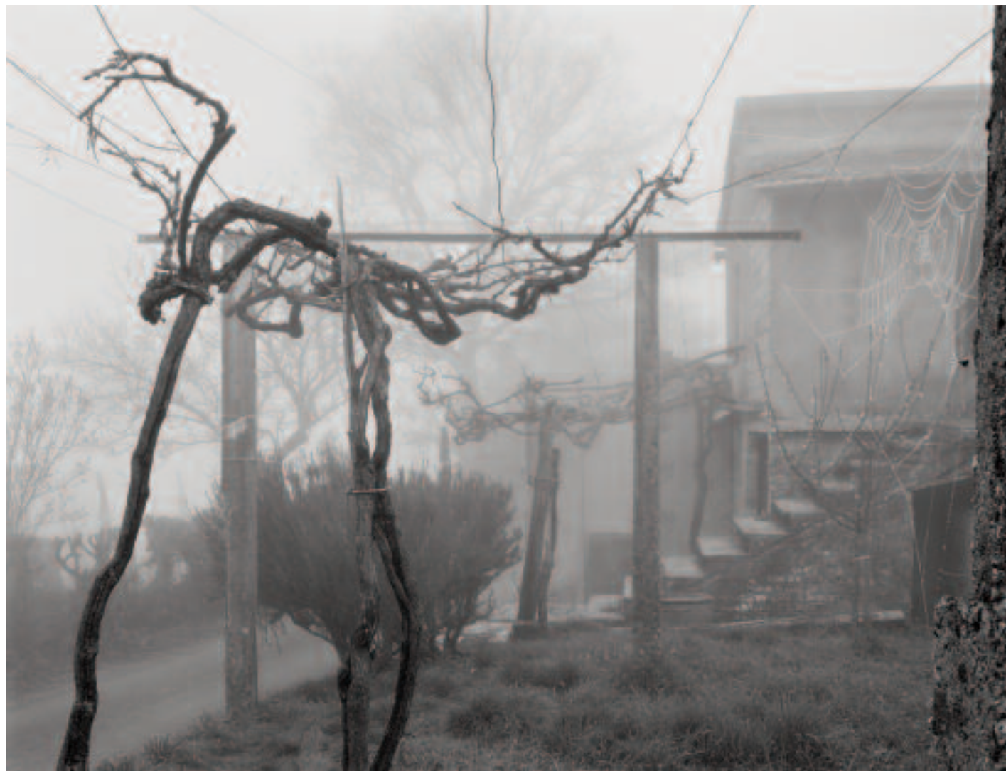
SPIDER WEB — 2006

Over the last 20 years, Leivick has pursued a variety of situations and works under the loose title of The Garden Project. In these photographs of landscapes in both Italy and Northern California, the often severe contrasts in the Carrara and Matera work become much more mediated and subject to a more tender regard. What was earlier depicted as a clash between primal nature and cultured forms becomes a more interwoven and imaginative accommodation. The portrayal of the practically imperial onslaught of the mines, their cavernous quarries and the detritus-covered mountainsides is replaced by a larger, often intimate investigation of landscapes, towns and oceansides. Inevitably, the work also becomes a visual meditation on the character of time and the physical record with which it shapes the present.