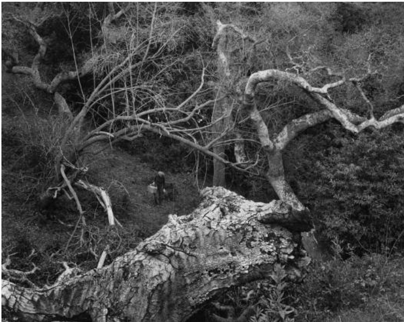
TERRY HUNTING MUSHROOMS — 1982

If “Lost Boat” conjures the inevitable death of forms or human artifacts, “Terry Hunting Mushrooms” (1982) may be interpreted as a wintry resurrection. Formally, the picture is built around a spiral in which a sweater-wearing, blond, thick-haired woman appears to rise from within a cone of darkness on the forest floor below. The combination of her hair, her bare white hands, the weight of the soft colored basket and the lean of her step suggest not only the news that her mushroom harvest has been good, but a resurrection of light as well. The cone or “arcade” through which she will arise is a carefully framed series of splayed branches and tree trunks, including the large and robust rotted one in the foreground. Its age and the richly lit, sedate texture of its rippled, dead skin provide a counterpoint to the animated gesture of the young mushroom hunter. The way in which Leivick captures such a scene embraces both the beauty of disintegration and the rush and emergence of life in the same frame.