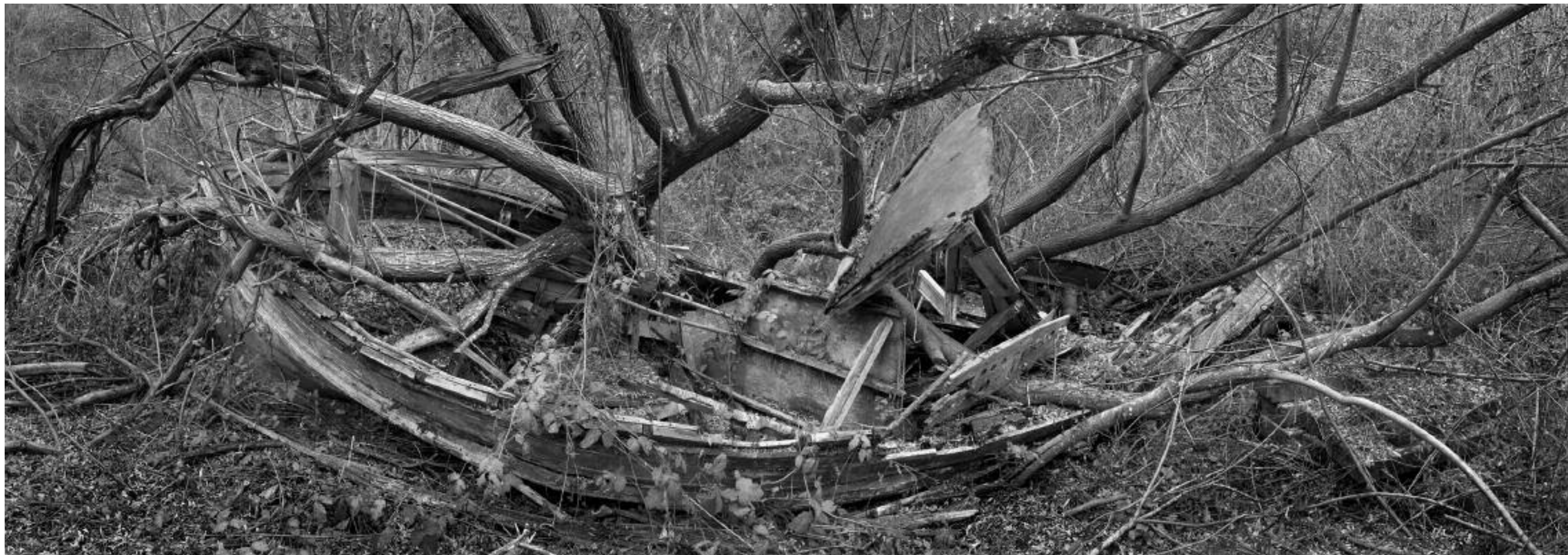
LOST BOAT — 2009