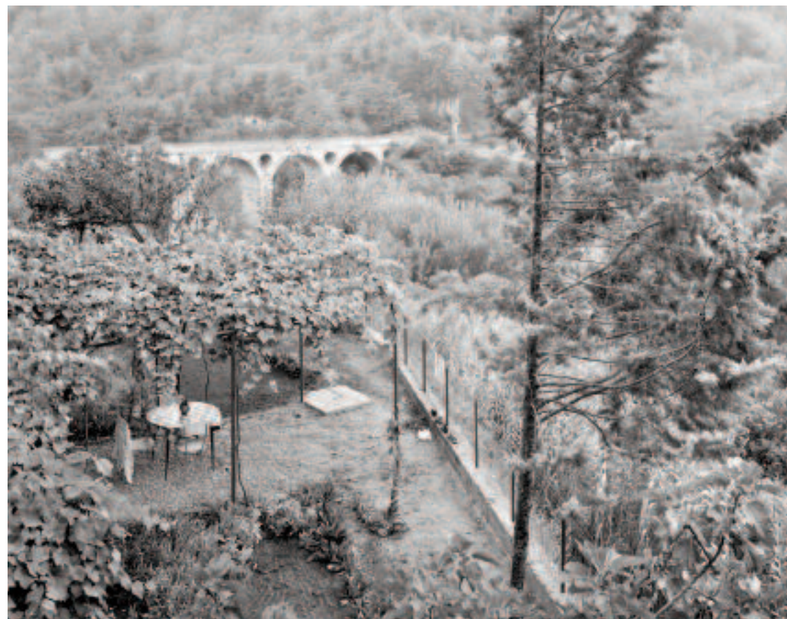
VIEW FROM PITIGLIANO — 1987