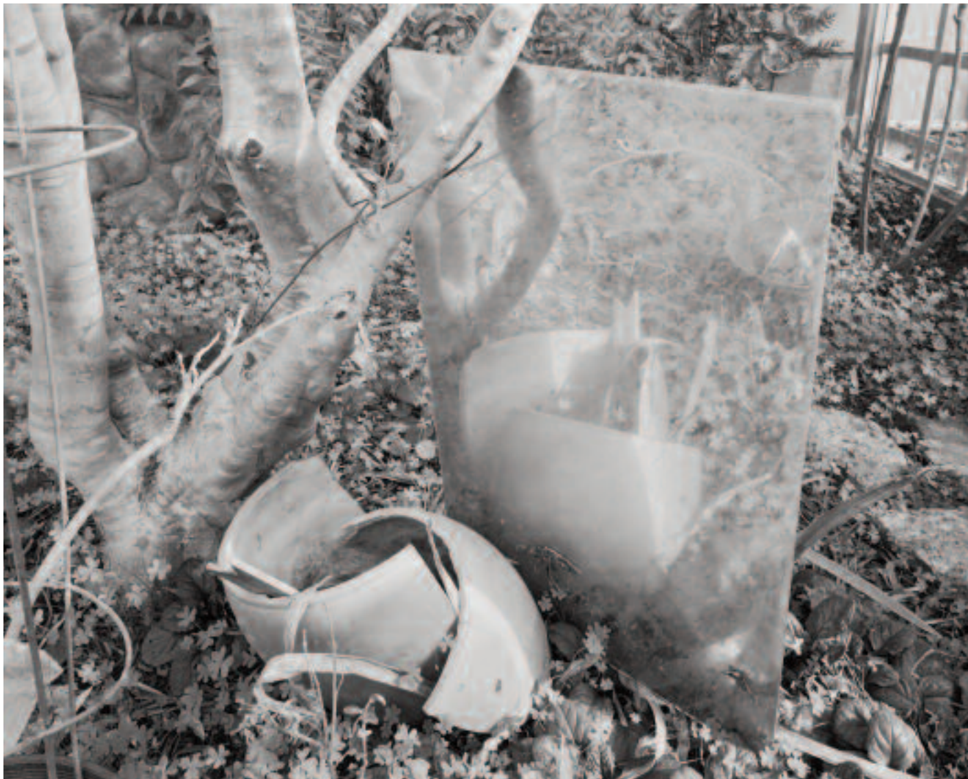
GARDEN MIRROR — 2005

In “View of Crockett” (1983), the crystalline light possesses a luminosity that verges on the religious, recalling images from the Hudson River School and 17th-century Spanish and Flemish landscape painting. Taken from the city’s hill top, and pointed across the Carquinez Strait, the picture lights up both the town’s buildings and the white ship on the opposite shore in a manner similar to the track of light in the “View of Colonnata” taken from the mountain slopes of Carrara. Yet the formal structures in both photographs—the window frame in “Doorway” and the bridge and buildings in “View of Crockett”—quietly provide a firm counterweight that prevent either picture from sliding into a luminous form of bathos.