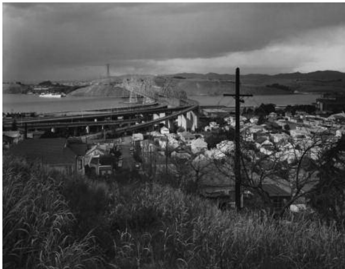
VIEW OF CROCKETT—1983