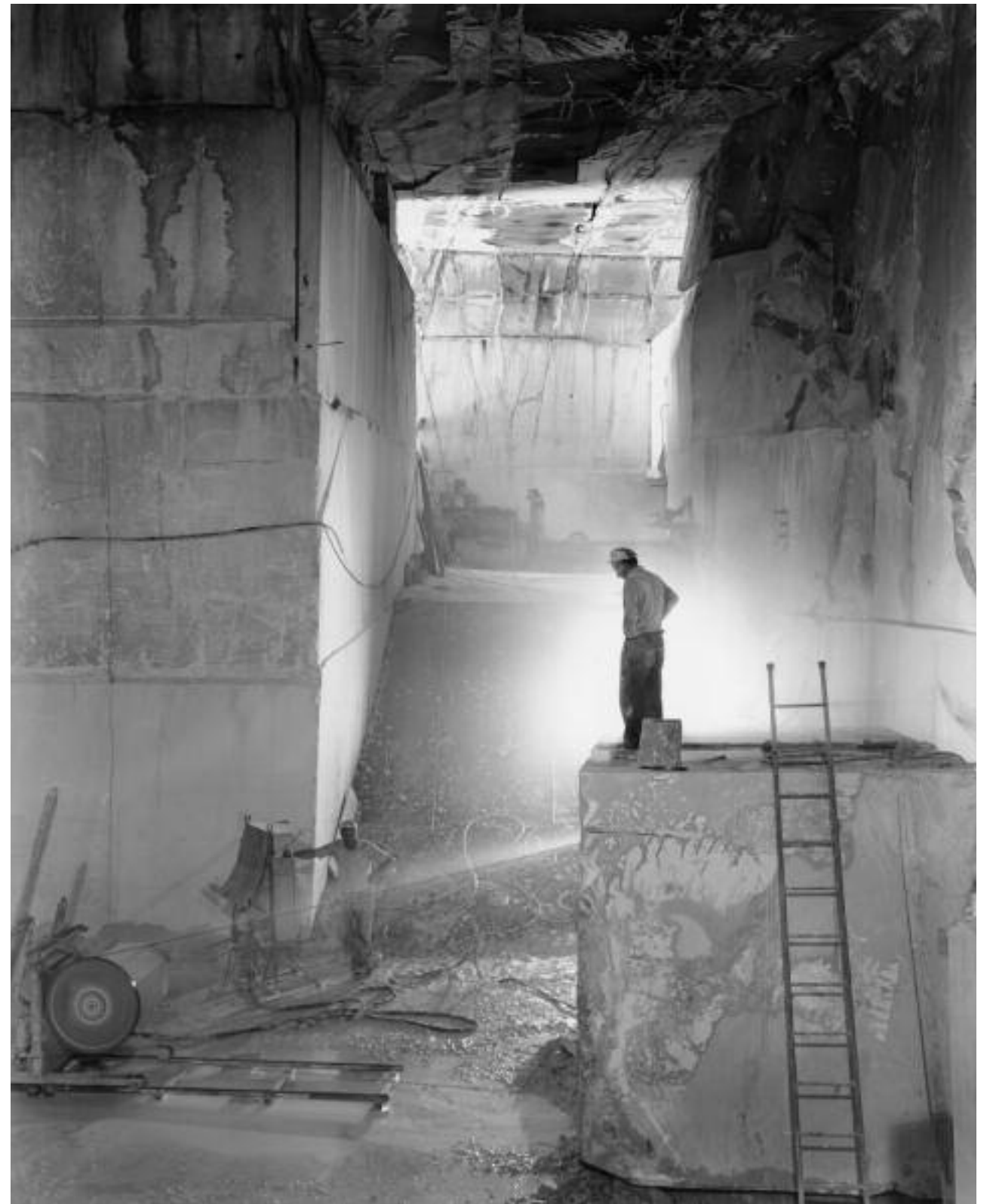
UNDERGROUND QUARRY WORKMEN — 1988