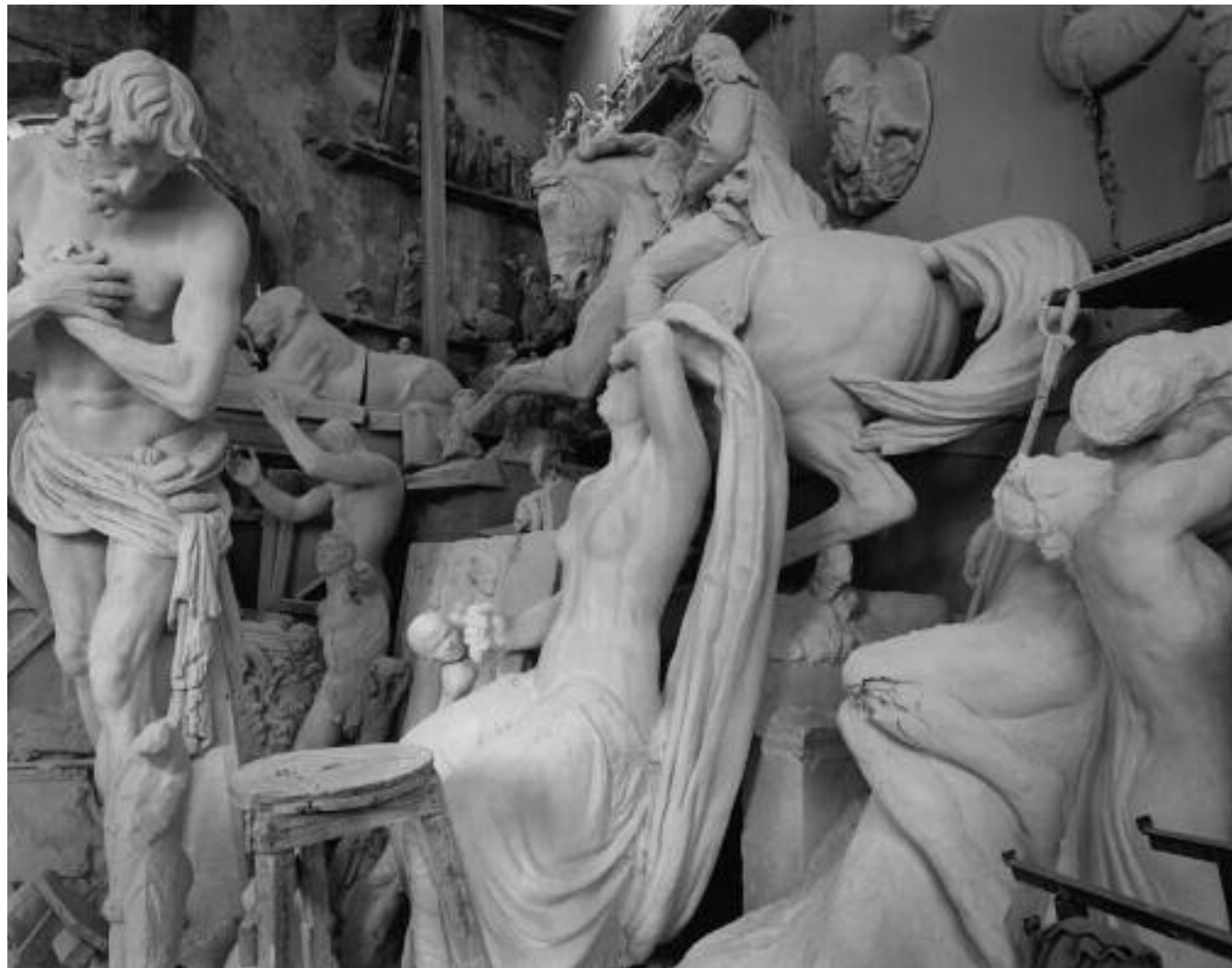
THE ALLEGORY OF LOVE — 1989

We see, rising above the left-hand side of a river below, a mountain in which the careful shapes left by the milling of the marble contrast with a precarious slide of scree. On the other bank, and further down the river, the photograph is framed and angled in such a way that it connects the mine's marble flanks with the lit-up forms of the town's marble church and local buildings.