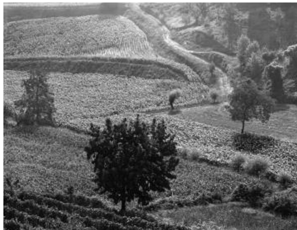
LANDSCAPE 136 — 1987

"View from Pitigliano" (1987) is a remarkable interweaving of nature and formal human intervention in which the forest, architecture and garden appear to achieve a balance. The bridge's Roman arches, and an undefined arch beyond, play against and compliment the checkered surface of the circular garden table.