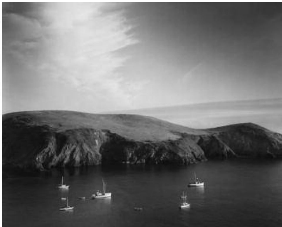
ALBION RIVER MOUTH—1980