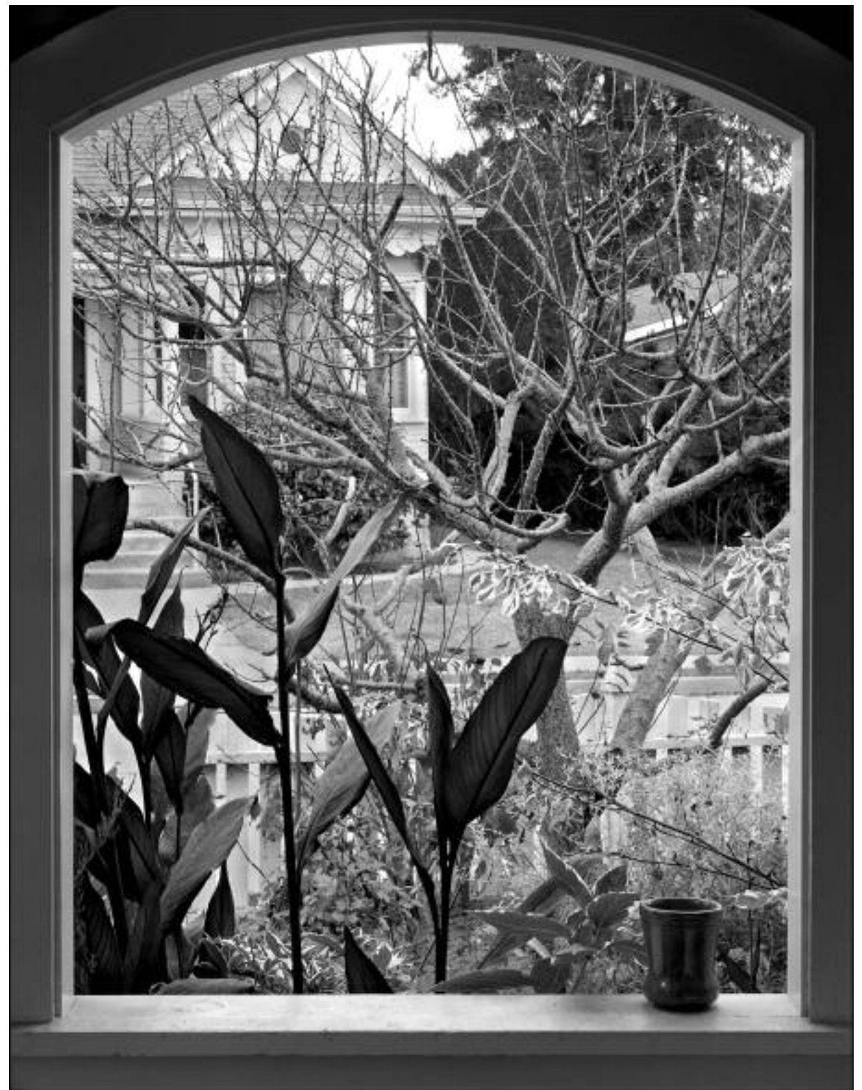
DOORWAY — 2006

P art of Leivick’s engagement as an artist is to discover the way a photograph distinguishes and defines itself as different and/or similar to natural and other cultured forms. “Garden Mirror” (2005) creates a parable of the transaction between the camera and its subject. In the midst of the garden we see a pot, now in shards yet enfolded into the form of a broken spiral. The leaning mirror, settling into its own decline, acts as a kind of alternative lens, giving us a back view of the pot, while the photograph, as “the image of record,” contains both the broken pot and its reflection in the mirror. In its subtle way, the photograph expands our consideration of the ambiguities and interpretations of what initially appears to be “in plain sight.”