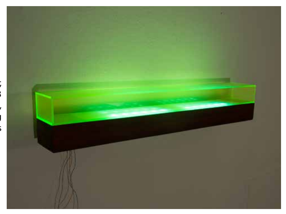
Emily Ellis | Page 17