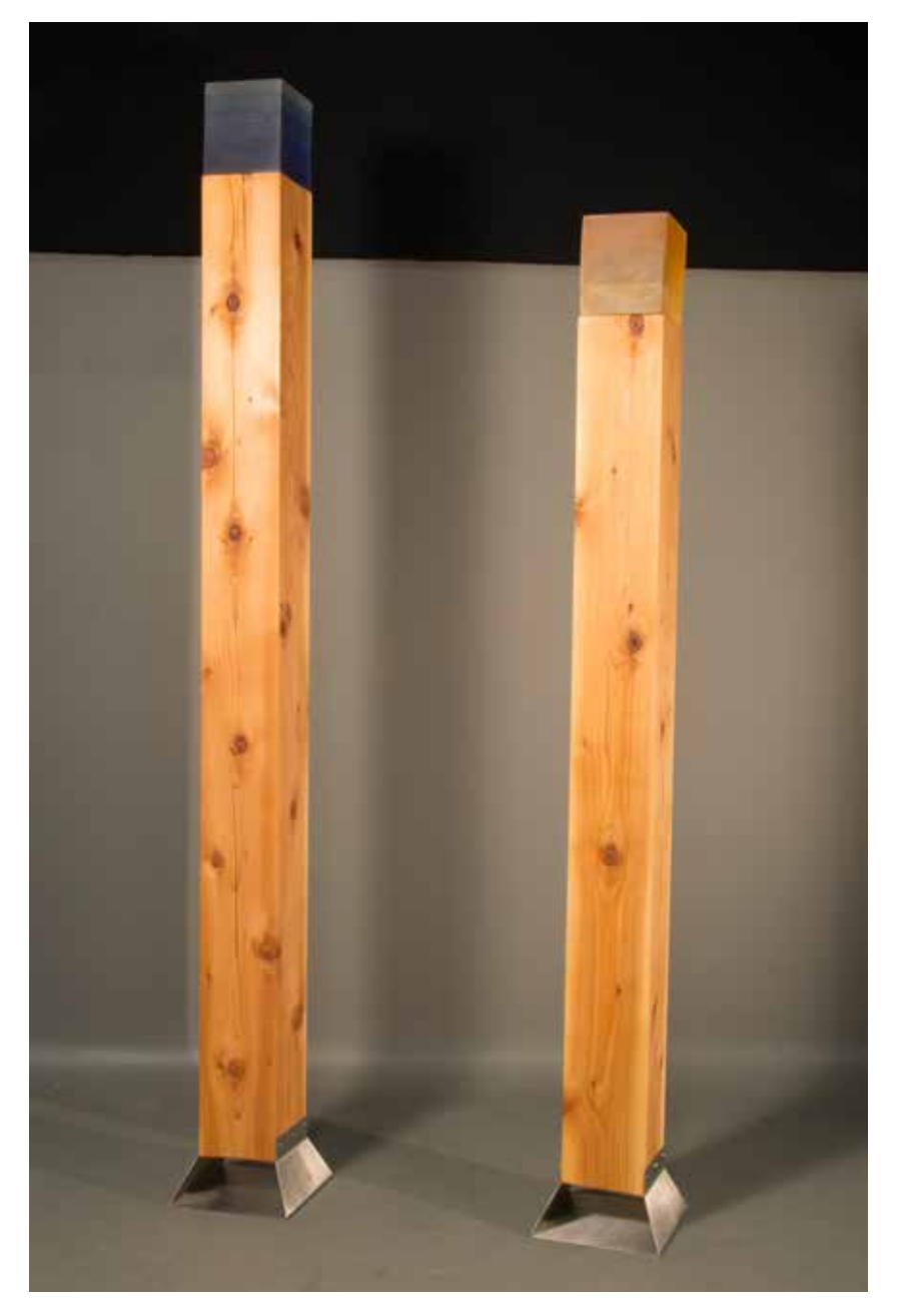
/ Was Thirteen and He Was Sixteen, 2014 Fir, Cast Resin Blue: 97.5 x 11.25 x 11.25 inches Yellow: 85.5 x 11.25 x 11.25 inches