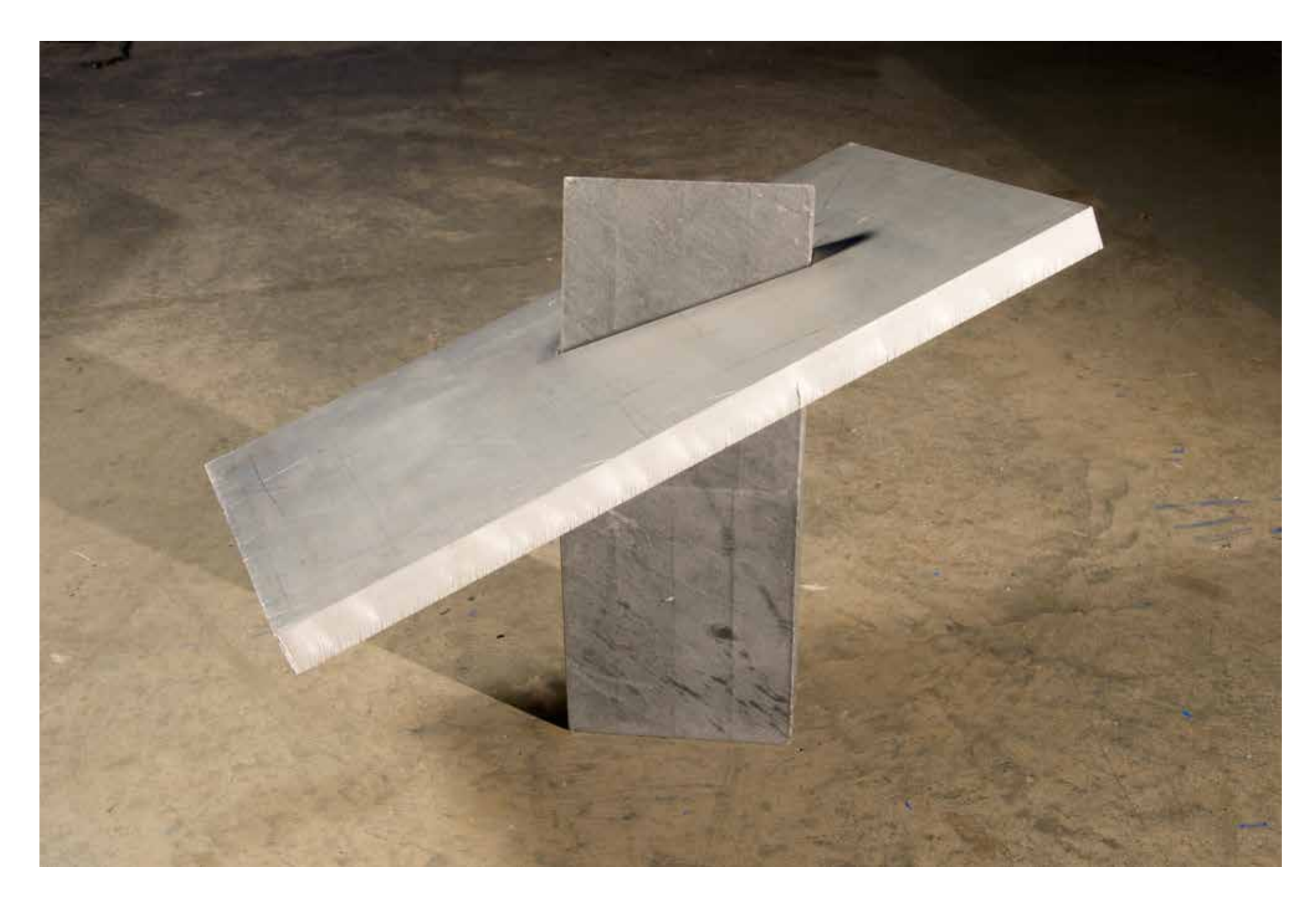
Gray Crush , 2014 Aluminum, Vancouver Island Marble 15.5 x 20 x 12 inches