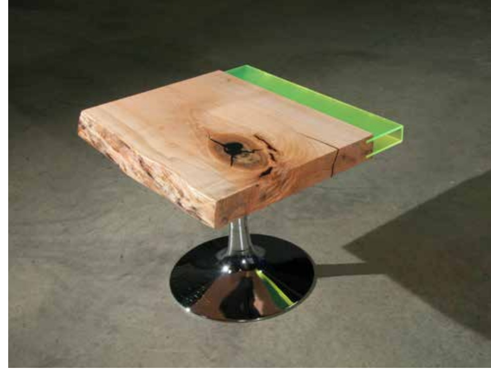
End Table Design, 2014 Maple, Plexiglass, Steel Base 18.5 x 24.5 x 22 inches