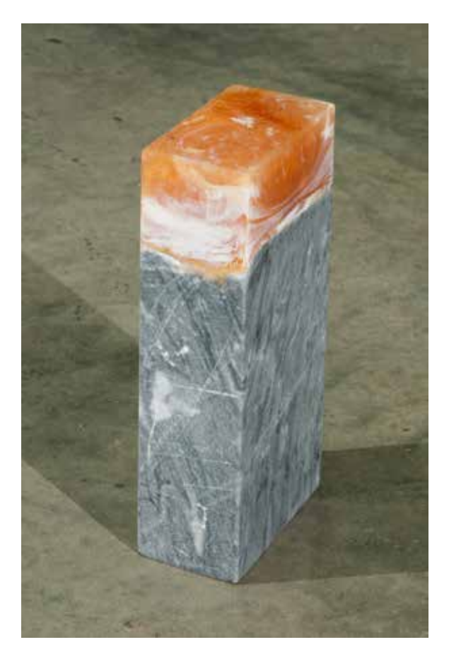
Stone and Honey: I'm into Neon Now Series #7, 2014 Vancouver Island Marble, Urethane Plastic Resin 11.25 x 5.25 x 3 inches