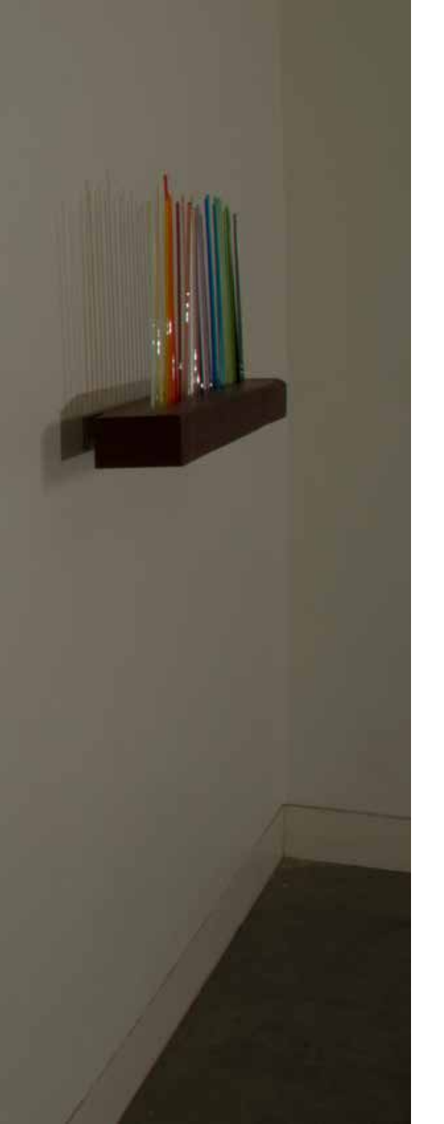
The Colour of My Dreams, 2013 Purple Heart Wood, glass, 16 x 34.5 x 5 inches