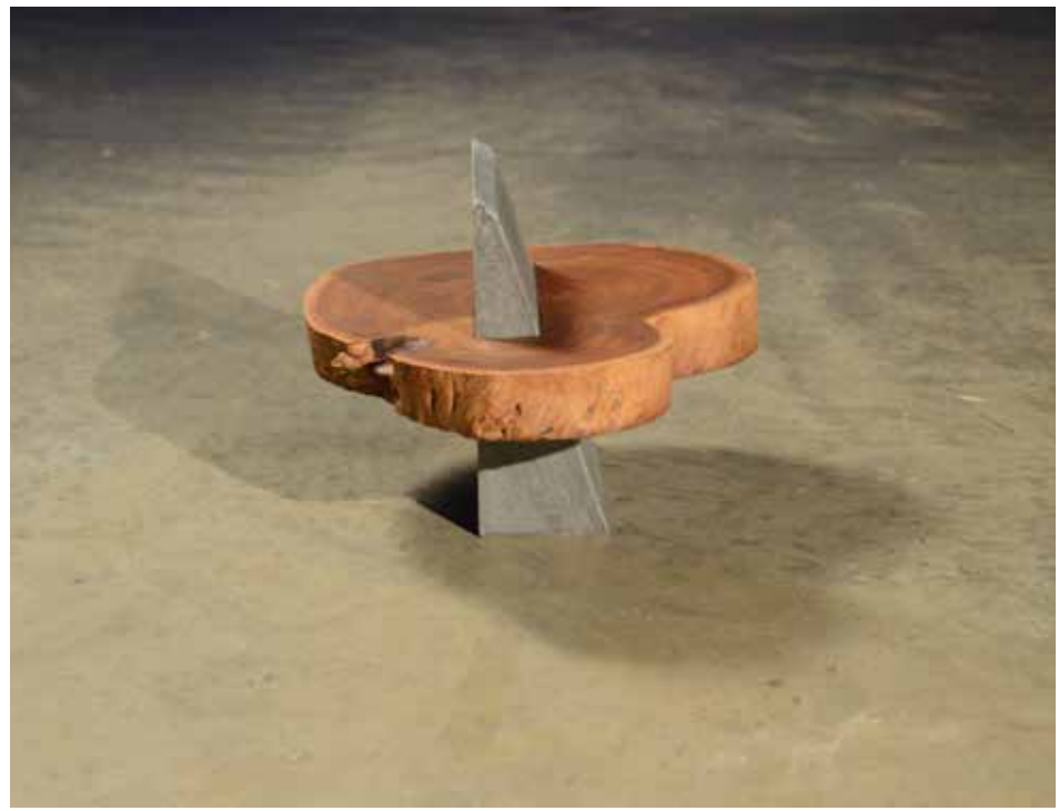
West and Beyond, 2014 Vancouver Island Marble, Arbutus 8 x 11 x 11 inches