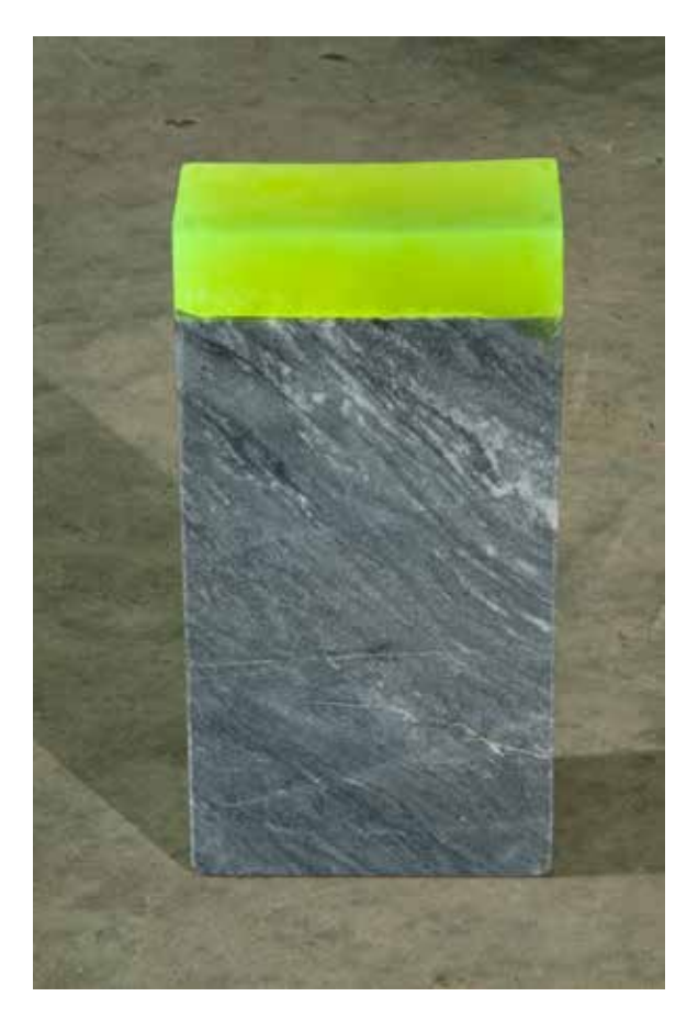
I'm into Neon Now Series #4 , 2014 Vancouver Island Marble, Urethane Plastic Resin 11.25 x 5.75 x 3 inches