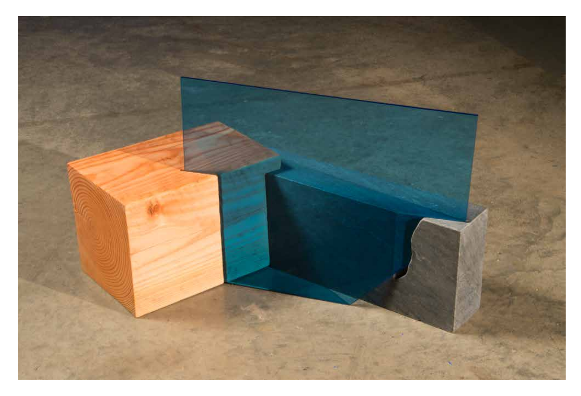
I'm Staying Home, 2014 Fir, Plexiglass, Vancouver Island Marble 12 x 23 x 12 inches