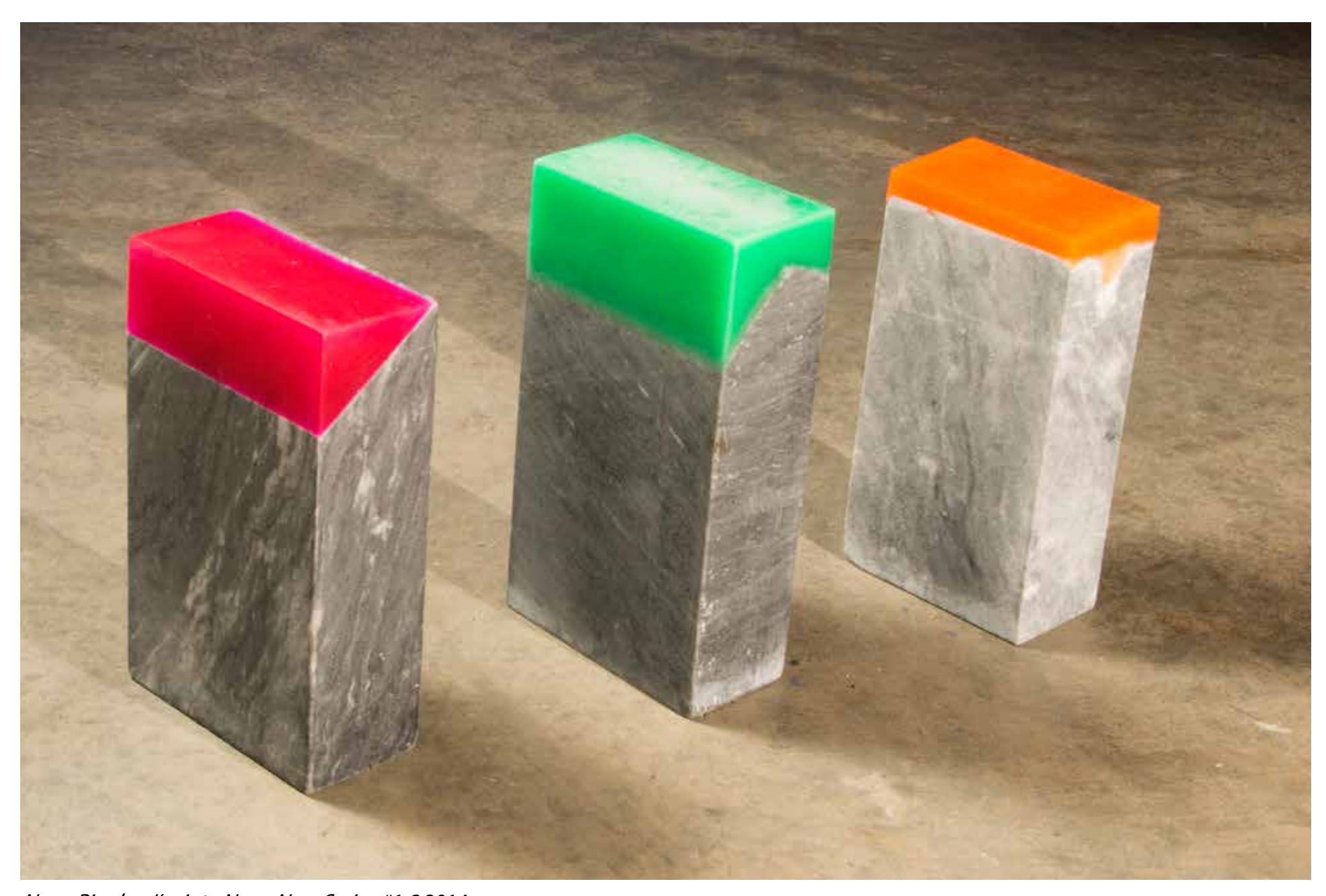
Neon Ripples: I'm into Neon Now Series #1-3, 2014 Vancouver Island Marble, Urethane Plastic Resin 11 x 6 x 3 inches each