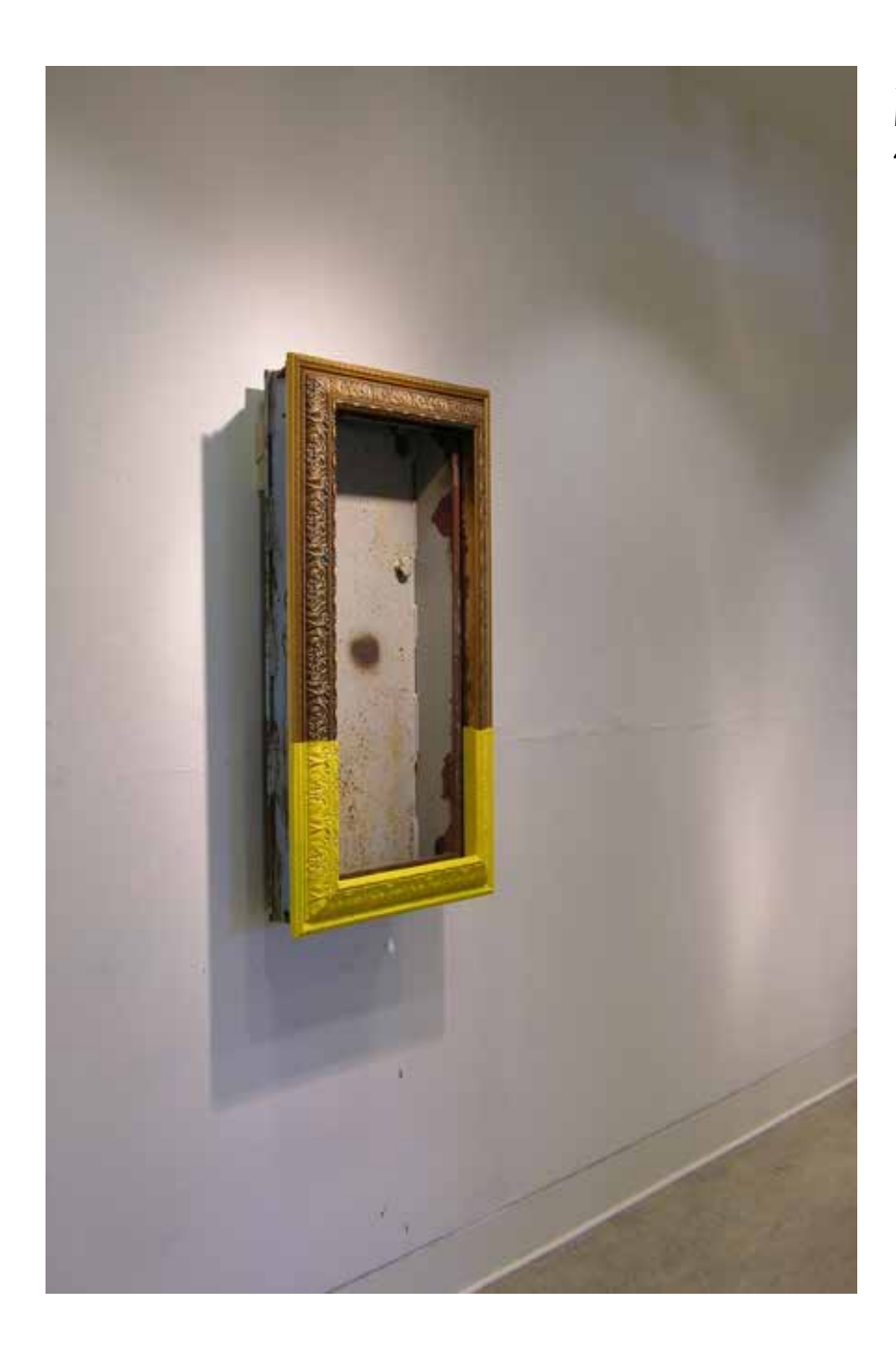
Don't Disappear, 2014 Mixed Media 44" x 24" x 6" inches