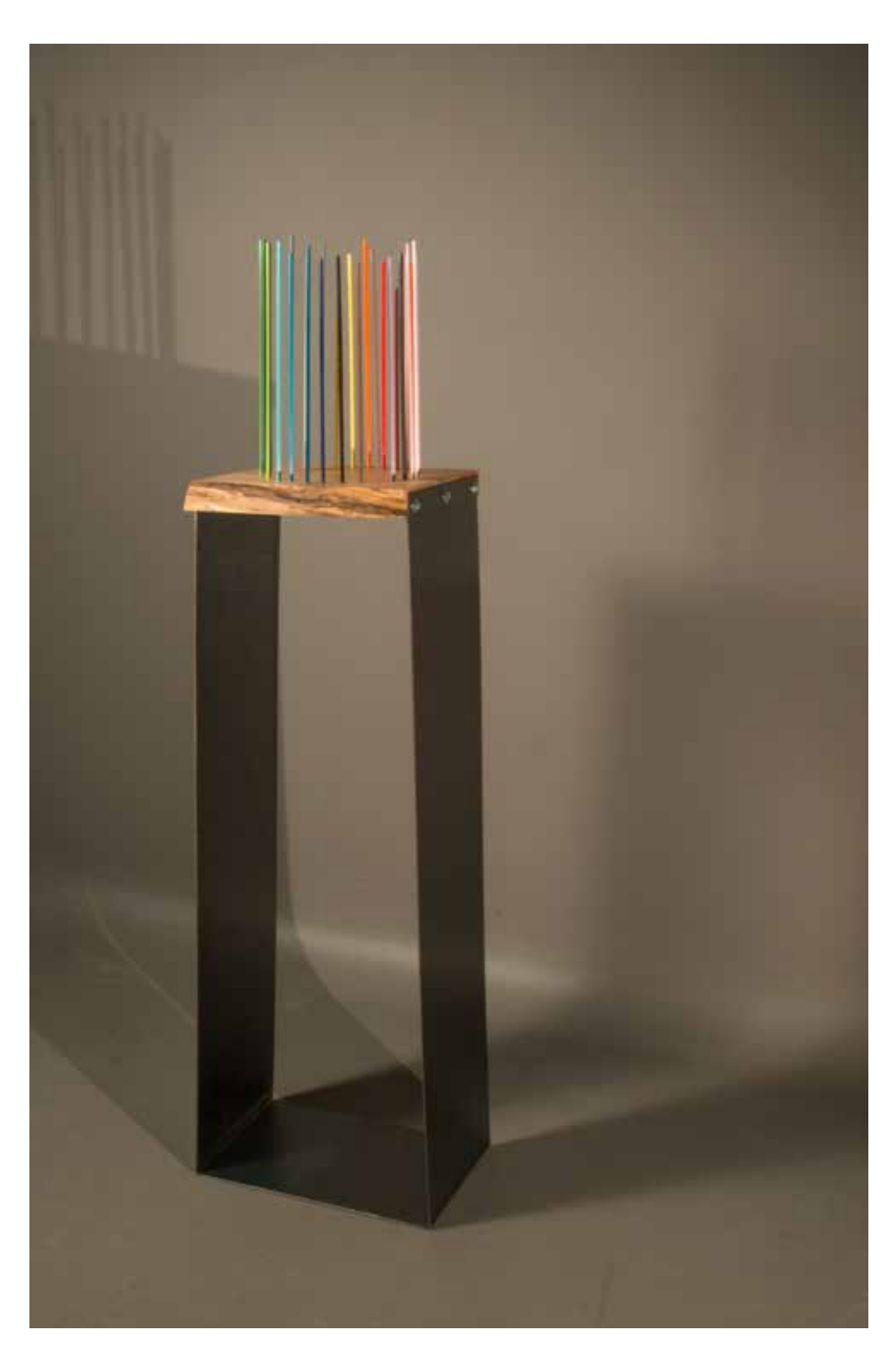
It Stays Here, 2013 Steel, Maple, Glass 59 x 13 x 13 inches

Sometimes You Don't Need To See Things to Know, 2013 Encaustic on Wood Panel, Glass, Steel 64 x 36.25 x 12 inches