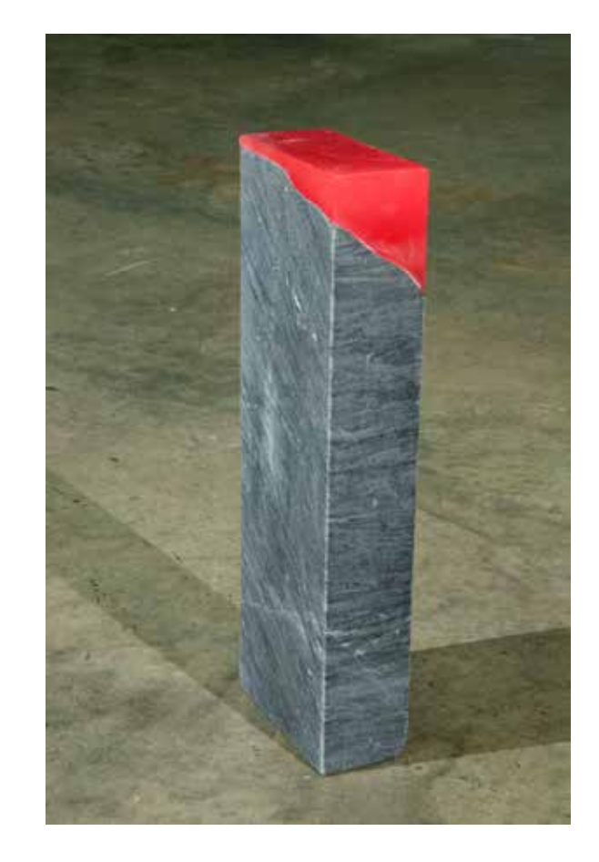
I'm into Neon Now Series #6, 2014 Vancouver Island Marble, Urethane Plastic Resin 18 x 6 x 3 inches