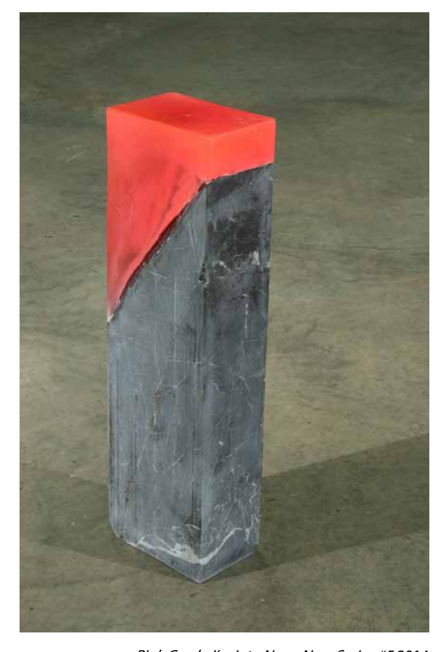
Pink Crush: I'm into Neon Now Series #5 , 2014 Vancouver Island Marble, Urethane Plastic Resin 25 x 8 x 4.75 inches