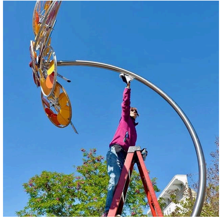
Cleaning Sunflower after installation

This is our tallest sculpture standing at 17 feet tall. It is a whimsical homage to the North American native wildflower that was first domesticated to a single headed plant by the American Indians. As a kinetic sculpture, Sunflower comes to life in the slightest airflow, to the delight of the viewer and creates a joyful spectacle as its heart and petals spin in both clockwise and counter-clockwise directions.