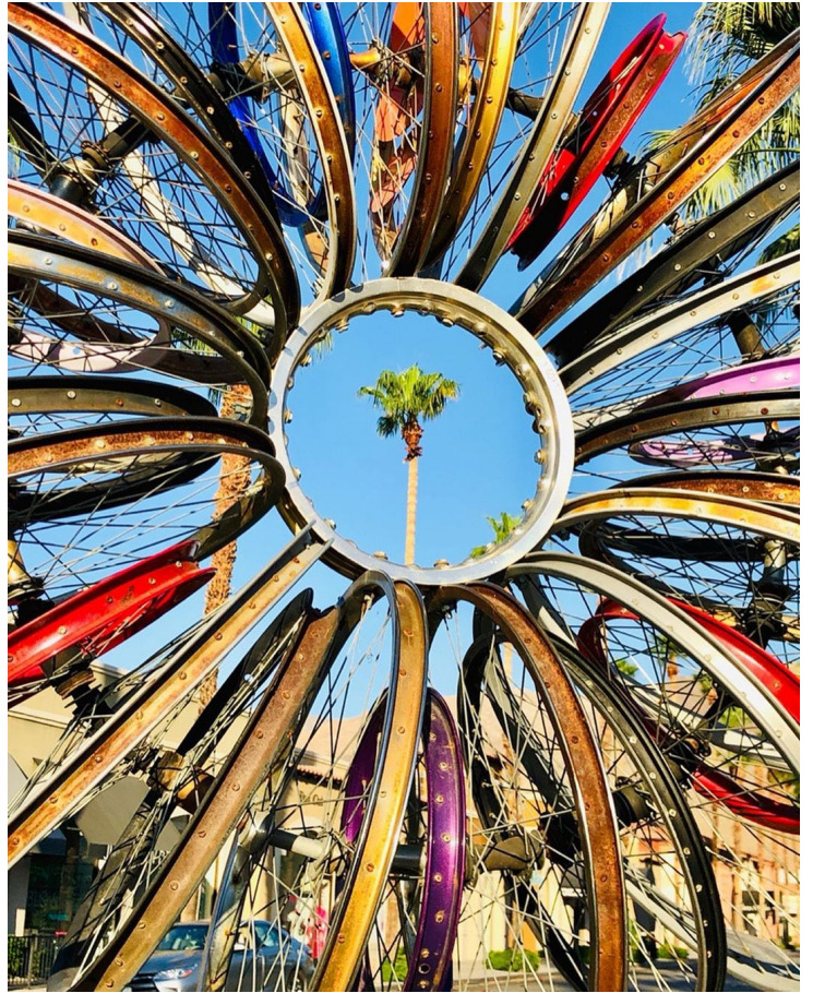
2019/2020 El Paseo Exhibition

RADIANCE is a statement of life, energy, hope and exuberance. A cylindrical structure lifts a sun-like circle of bicycle wheels of three different sizes in the air, a little above eye level. The larger wheels are attached to a central rim while the smaller wheels rotate freely and spin in the wind like windmills.