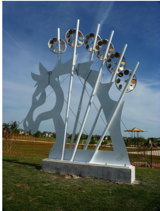
"Dreaming", a giant white horse head with manes (windmills) blowing in the wind, was the winner of the Public Art Competition for Wranglers Range Neighborhood Park - Frisco, Texas