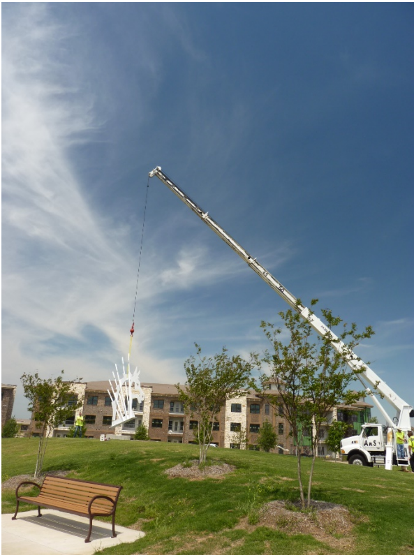
The 1,300 pound sculpture was moved into place by a 22-ton crane.